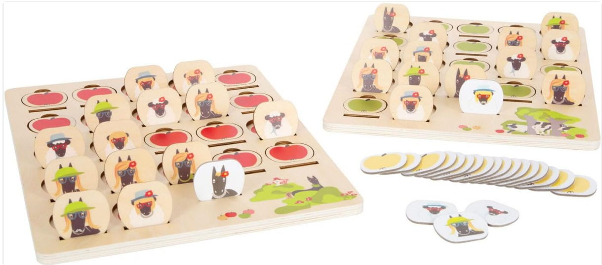
Image 3.1: All components of the Small Foot Who Am I? 12363 game, including the two wooden game boards and various character cards.