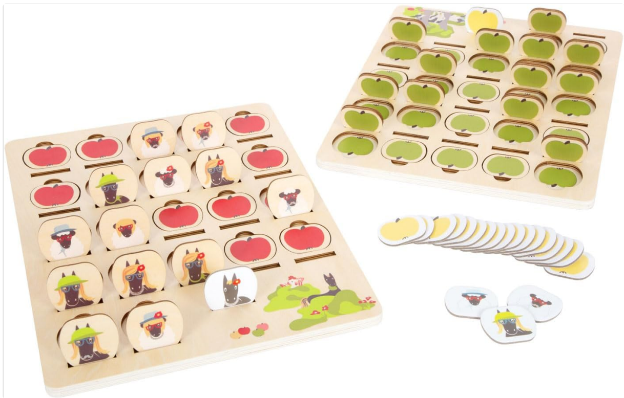
Image 4.1: The game boards with character cards inserted, ready for play. The separate cards for guessing are also shown.