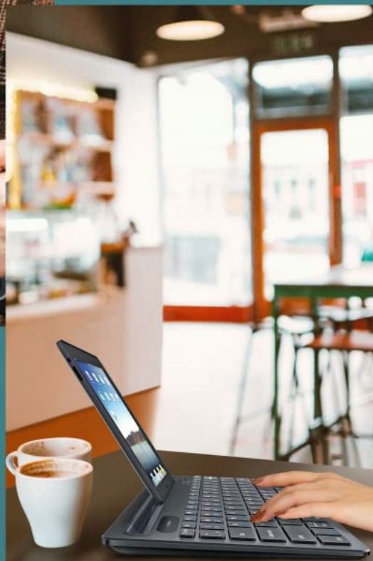
Image 5.1: The Lil'Clicks keyboard's portability, shown being carried and used in a cafe setting.