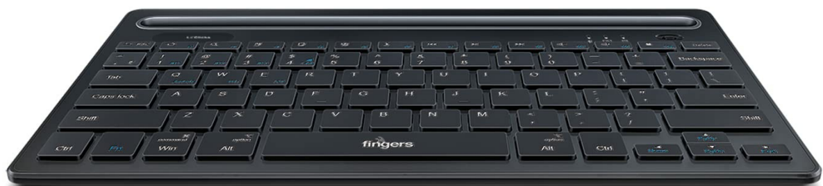
Image 1.1: The FINGERS Lil'Clicks Bluetooth Wireless Mini Keyboard, showcasing its compact design.