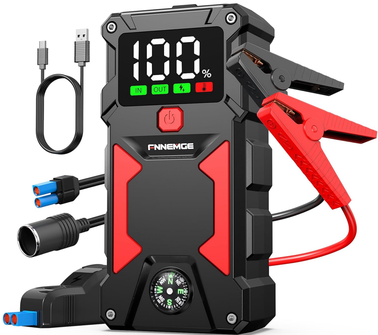
The FNNEMGE Car Jump Starter with included smart jumper cables, USB-C charging cable, and EC-5 cigarette lighter adapter.