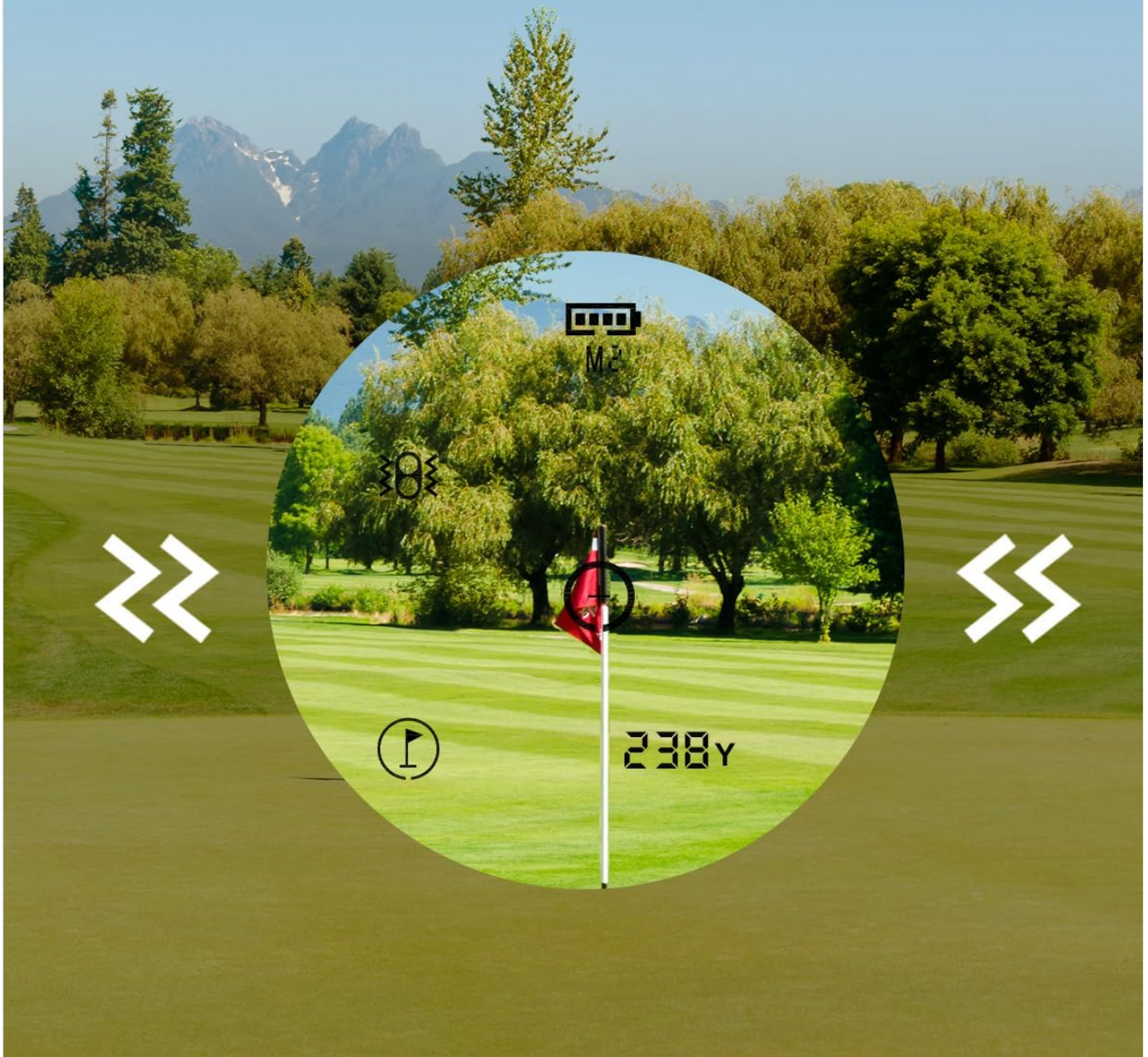
Figure 5: Visual representation of the flag lock feature, showing the rangefinder's display focusing on a golf flag and indicating vibration.