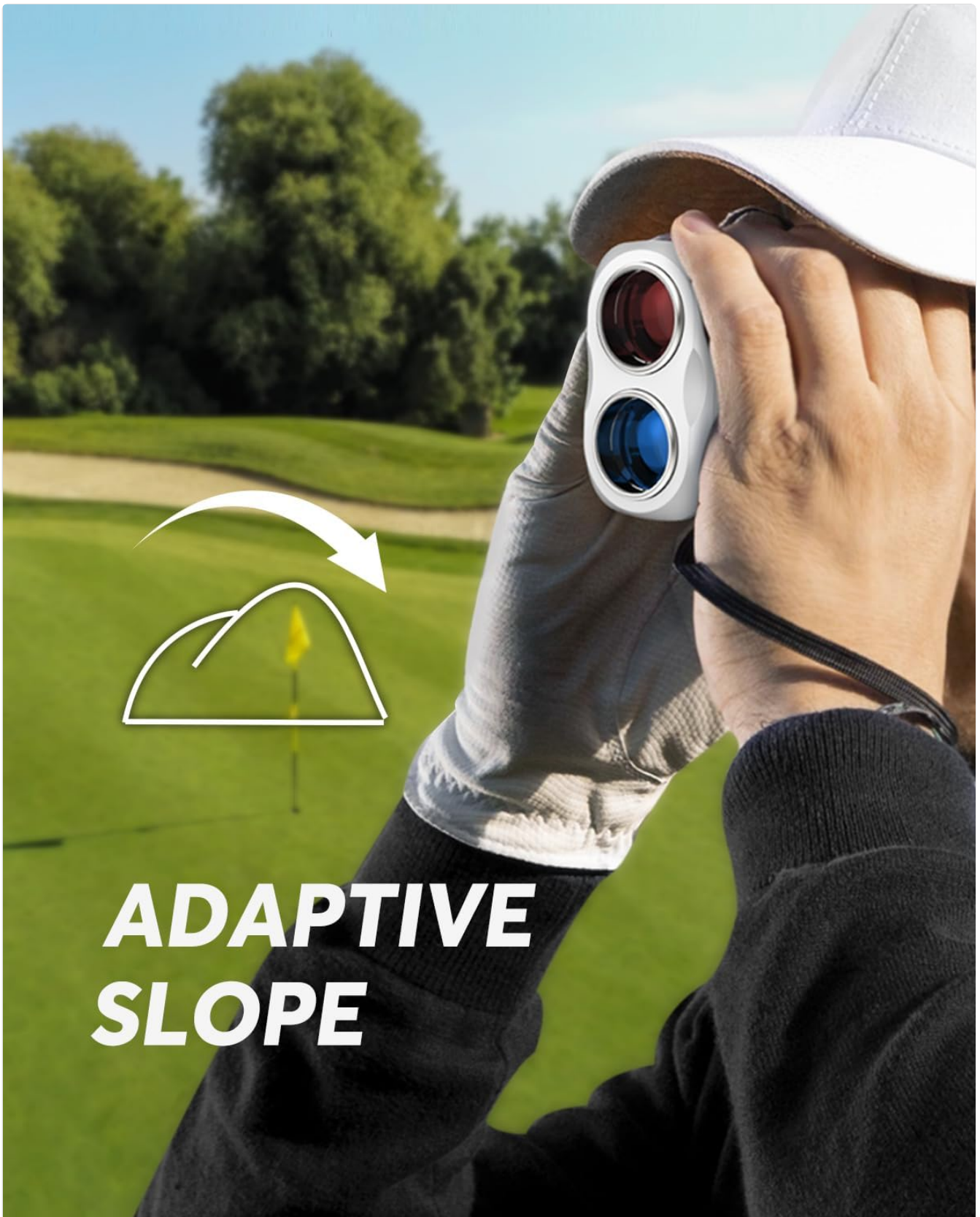
Figure 6: A golfer using the rangefinder, with an overlay illustrating the adaptive slope measurement, showing how it accounts for elevation changes.