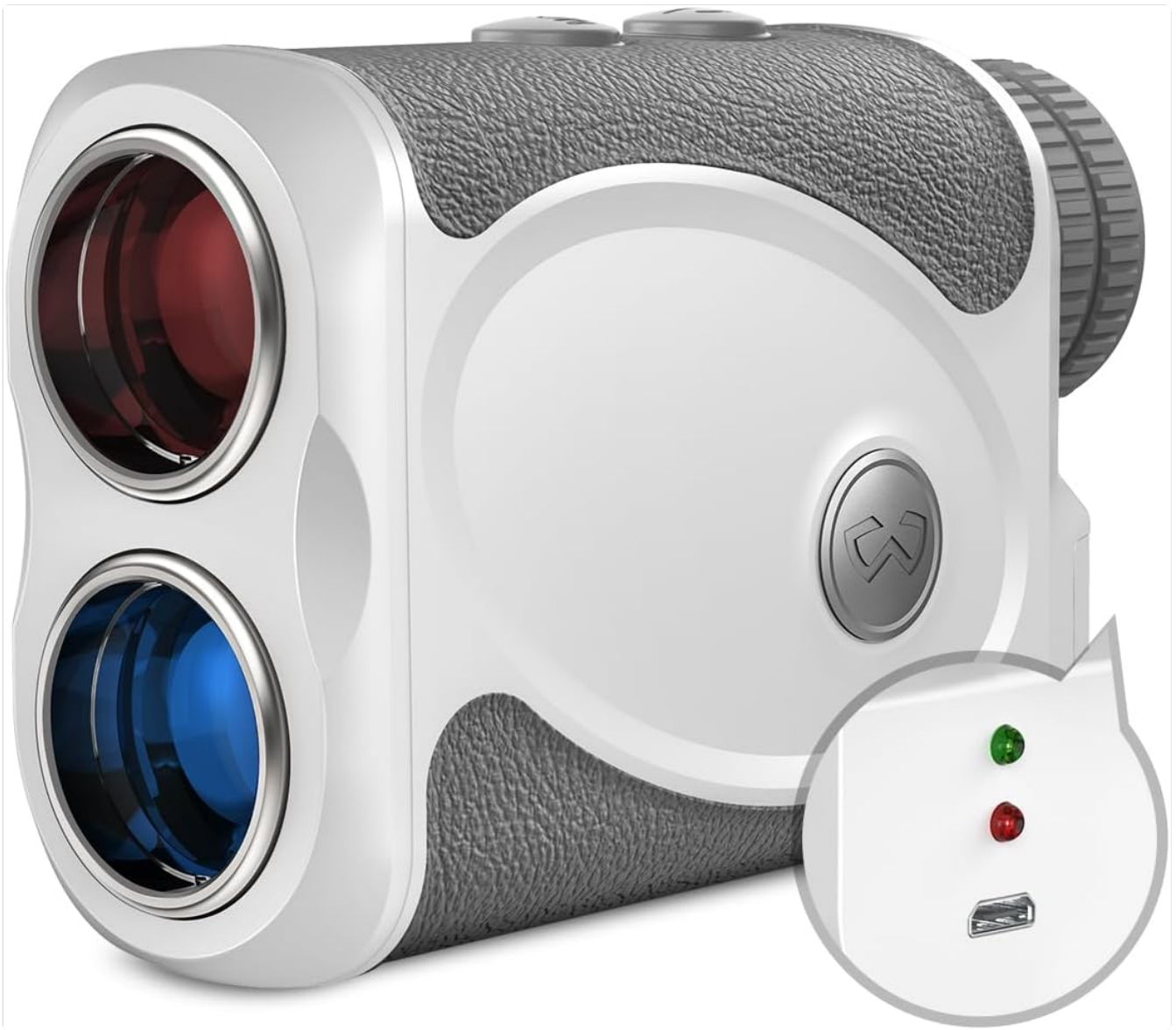
Figure 1: WOSPORTS H-111 Golf Rangefinder, showcasing its compact and ergonomic design with the objective and eyepiece lenses visible.