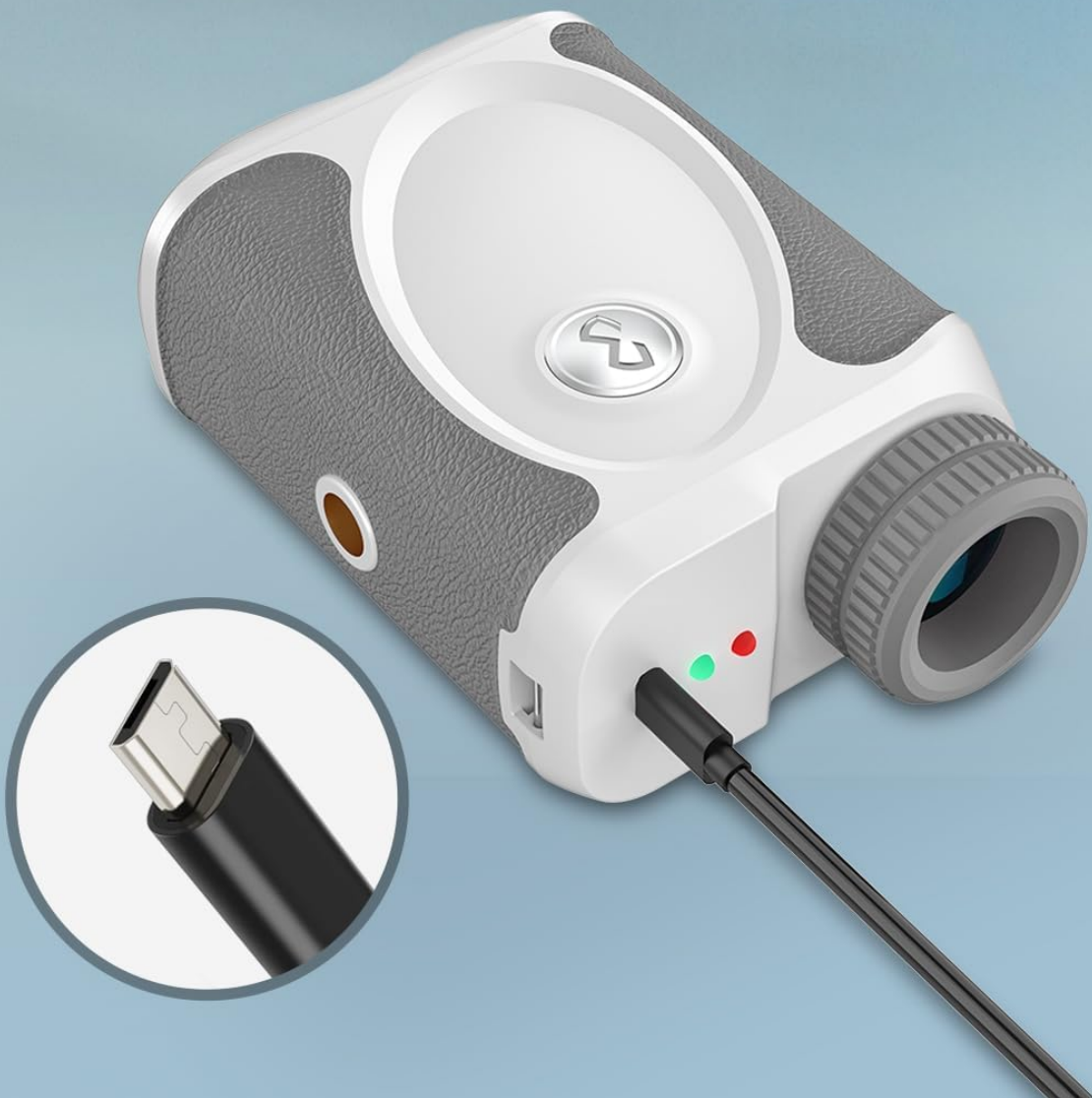
Figure 3: The rangefinder connected to a USB charging cable, illustrating the charging port and indicator lights.