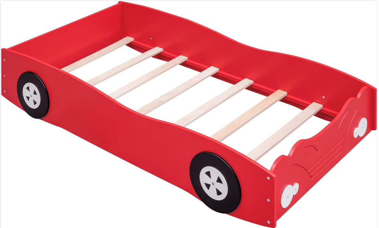
Image: An angled view of the red Bellemave Race Car Bed frame, showcasing the wooden slats that support the mattress.