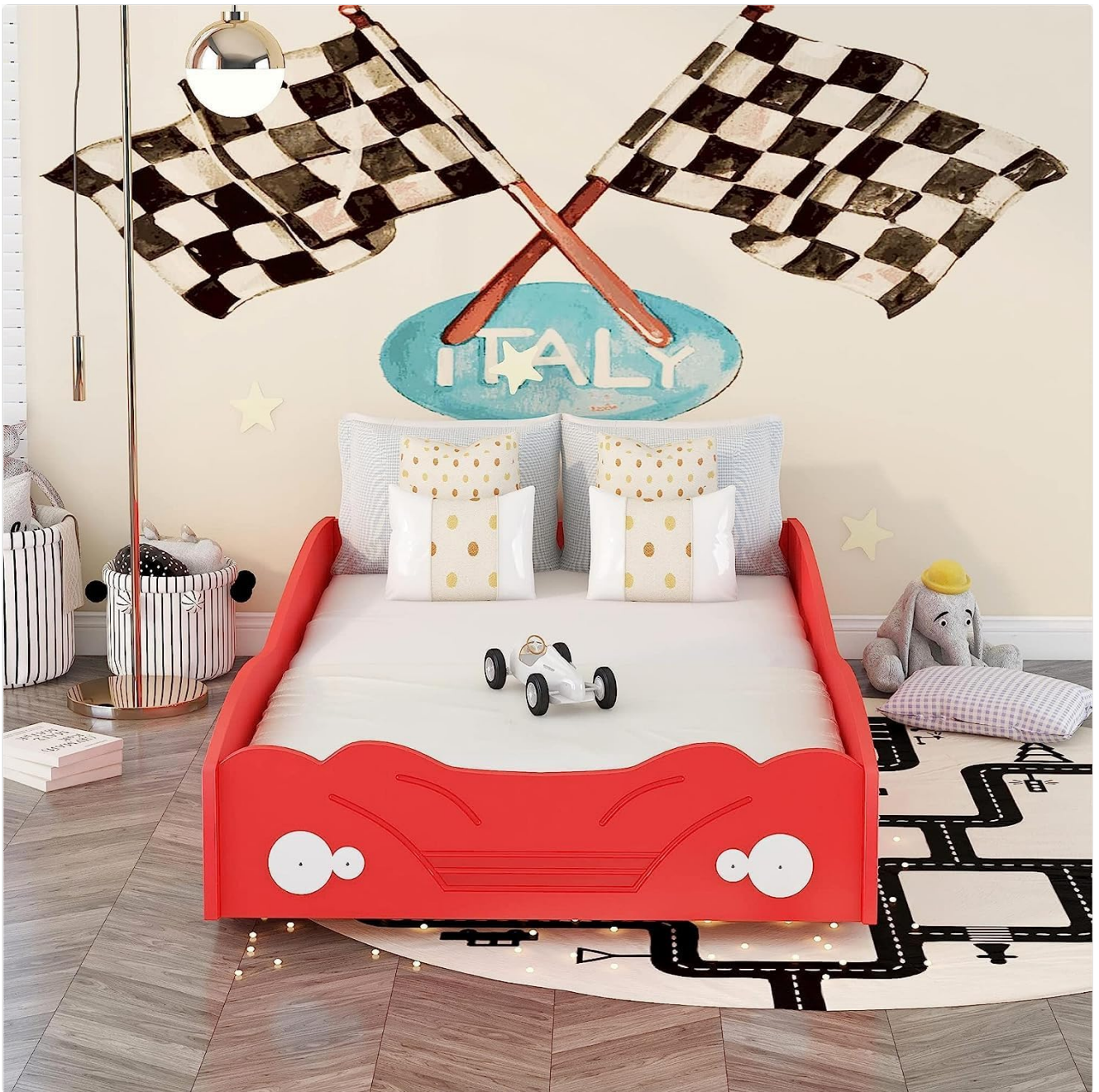
Image: The Bellemave Twin Size Race Car Bed, red with black and white accents, placed in a child's bedroom setting.