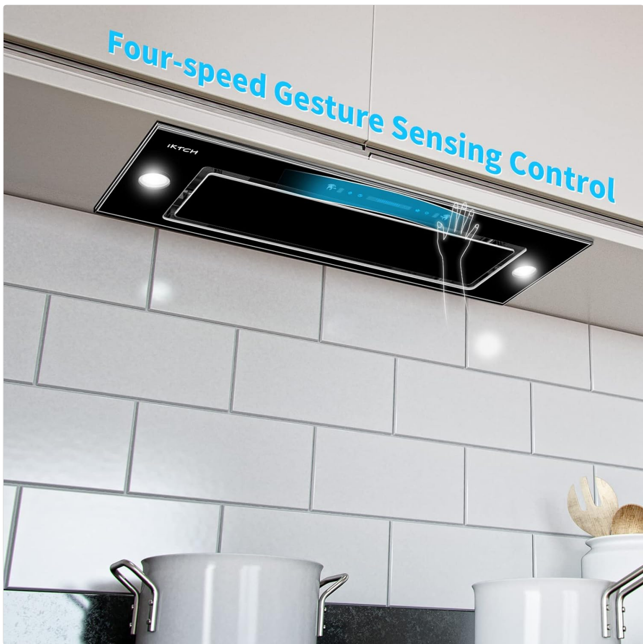
Figure 3.2: Demonstrating the gesture sensing feature for convenient control.