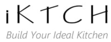
Figure 7.1: iKTCH Brand Logo.