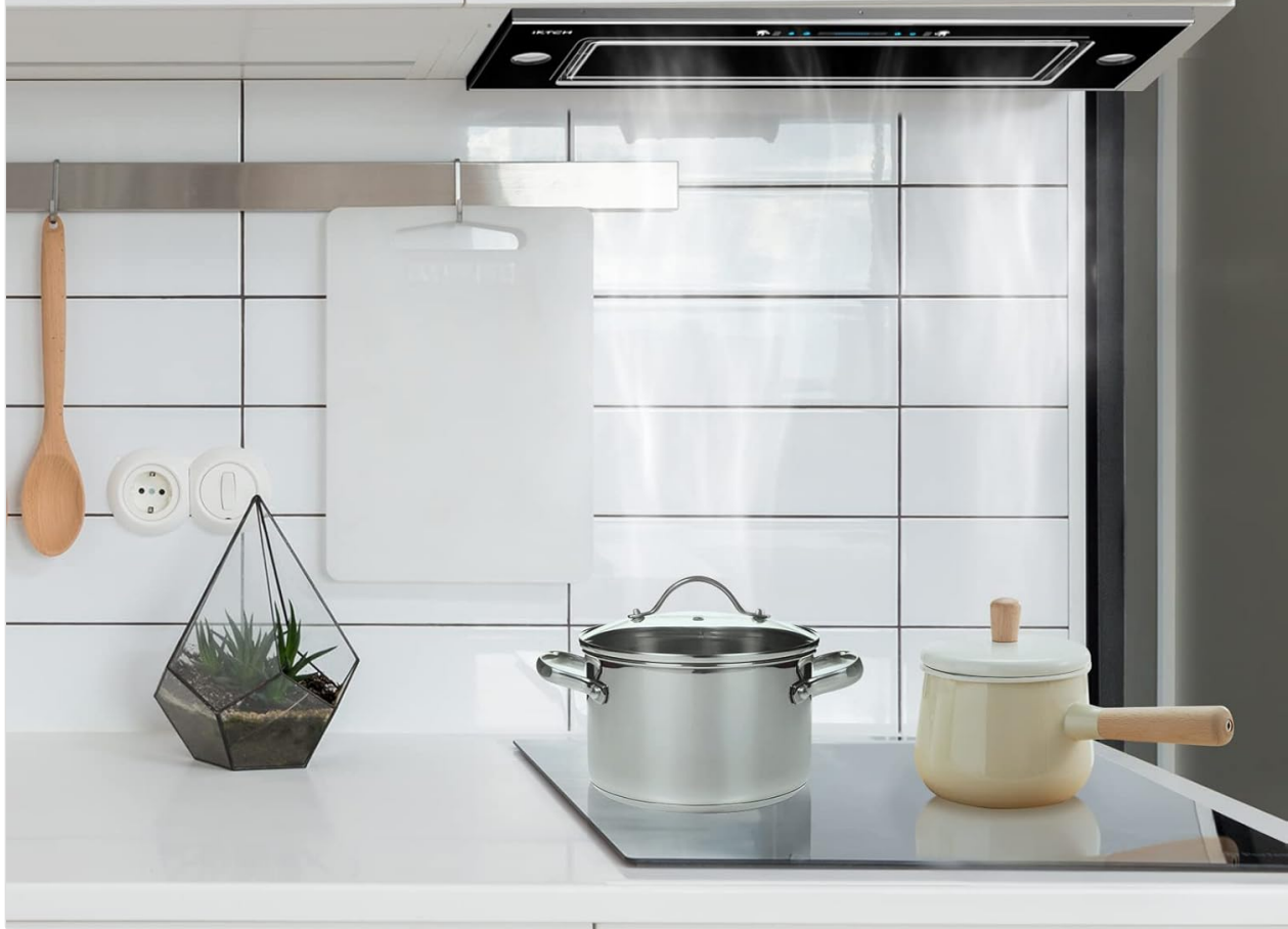
Figure 1.2: The IKTCH 900 CFM insert range hood seamlessly integrated into a kitchen environment.

Make Smoke and Cooking Odor Removal Effortless