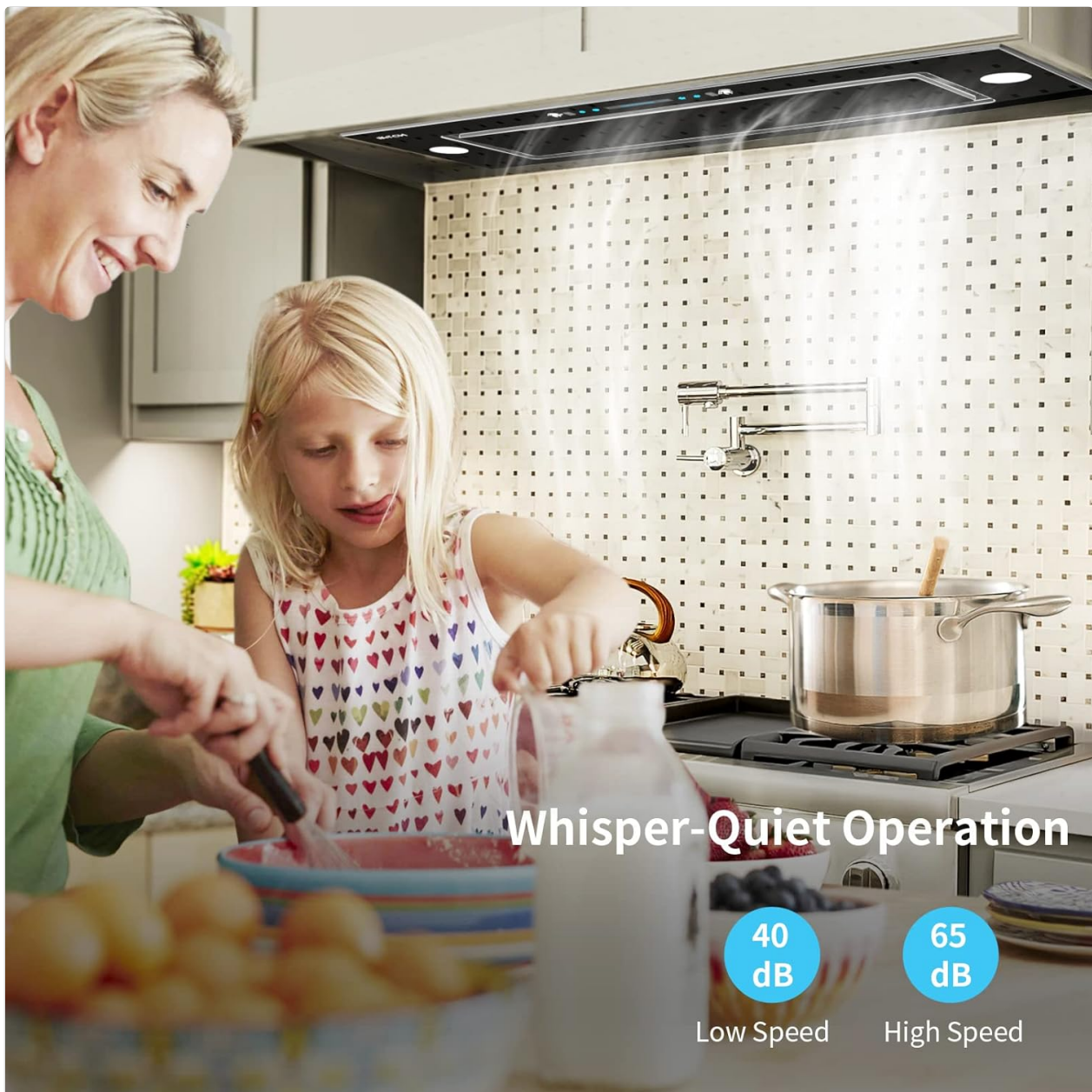
Figure 1.3: The range hood operating quietly, maintaining a comfortable kitchen atmosphere.

Your browser does not support the video tag.