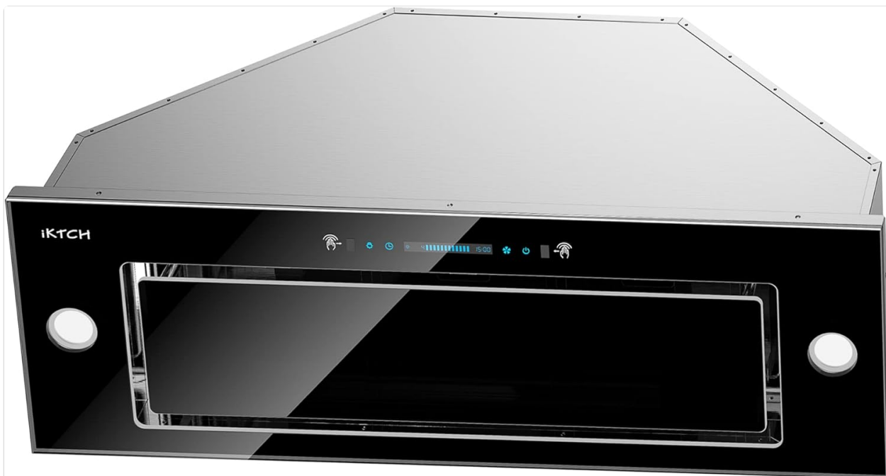
Figure 1.1: IKTCH 36-inch Insert Range Hood, showcasing its sleek design and control panel.

The IKTCH 36-inch Insert Range Hood is designed to efficiently remove smoke, grease, and odors from your kitchen. Featuring a powerful 900 CFM motor, 4-speed settings, gesture sensing, touch controls, and energy-efficient LED lighting, this unit offers both ducted and ductless convertible options for versatile installation.