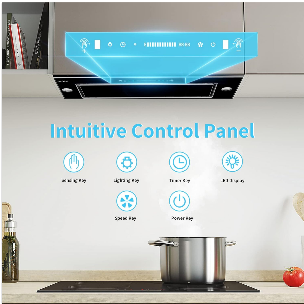
Figure 3.1: Detailed view of the intuitive control panel.