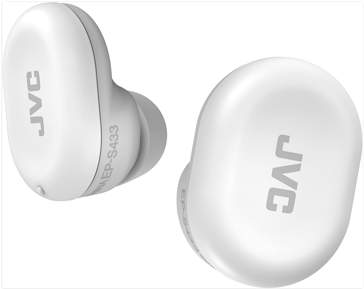
Image 1: The JVC EPS433 Ultimate Sleeping Earplugs, shown in white, highlighting their compact and ergonomic design.