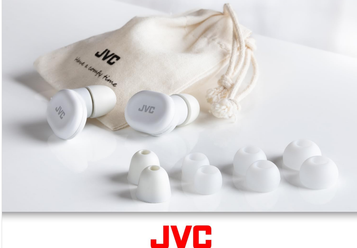
Image 4: Contents of the JVC EPS433 package, including the earplugs, a soft carrying pouch, and multiple sets of memory foam and silicone earpieces.