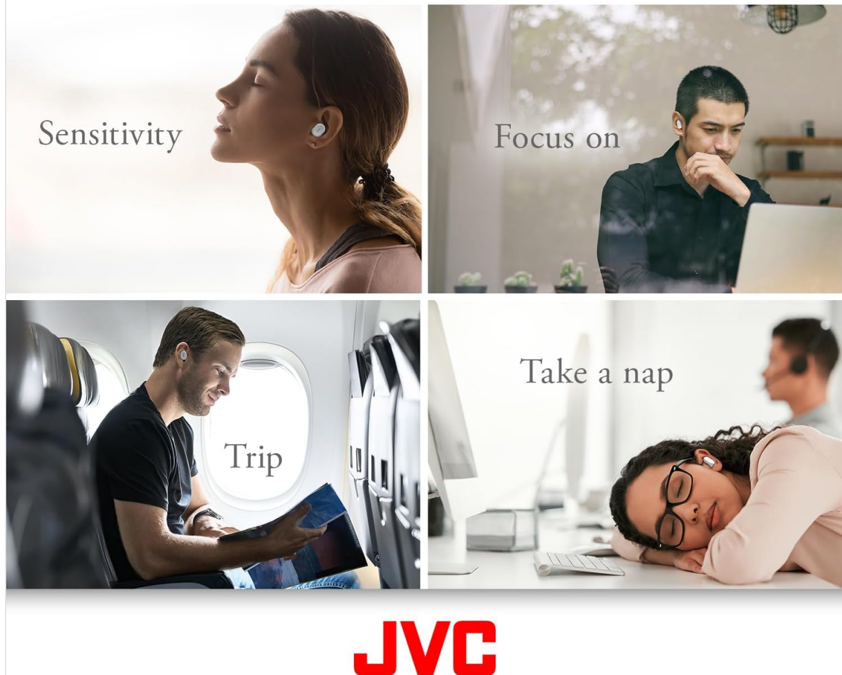
Image 6: A visual representation of the diverse applications for JVC earplugs, including enhancing sensitivity, aiding focus, facilitating travel, and enabling naps.

Your browser does not support the video tag.