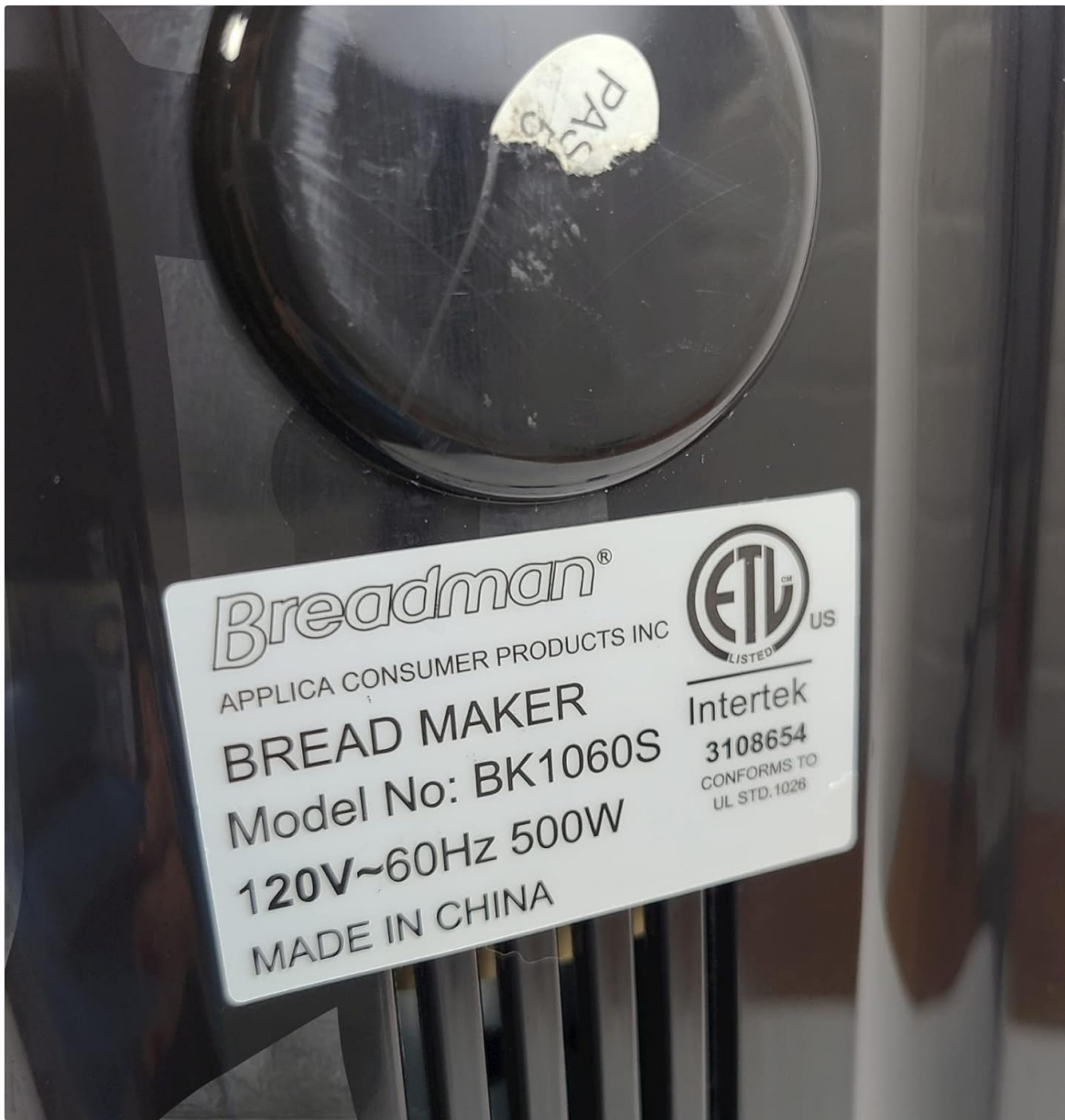
Image 3: Example of a Breadman bread maker label indicating model BK1060S.