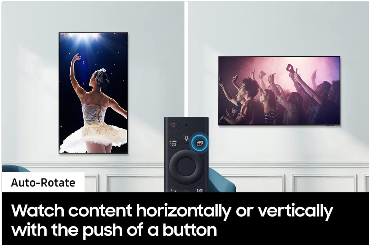
Figure 5.1: Remote control with auto-rotate function. This image shows a Samsung remote with the rotate button clearly marked, demonstrating its use for switching TV orientation.