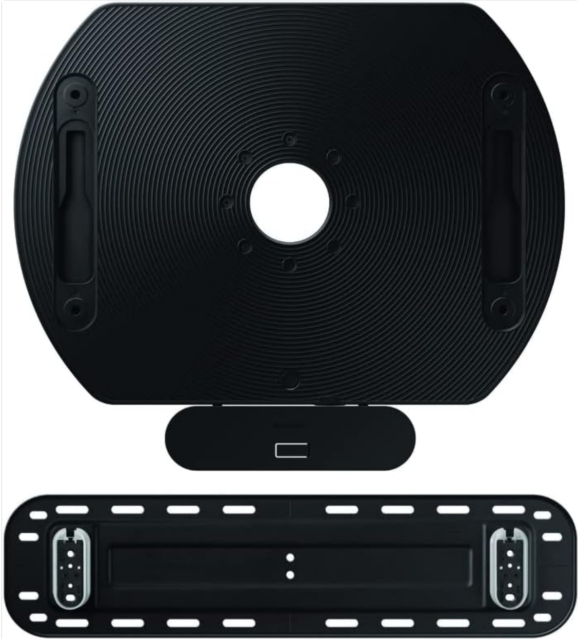
Figure 3.1: Overview of the SAMSUNG Auto Rotating TV Wall Mount components. This image displays the main circular rotating plate and the rectangular wall bracket, illustrating the primary parts included in the package.

The SAMSUNG Auto Rotating TV Wall Mount package typically includes the main rotating mechanism, wall bracket, TV attachment bracket, power adapter, and various screws and mounting hardware. Please verify all components are present against the packing list provided in your product box before beginning installation.