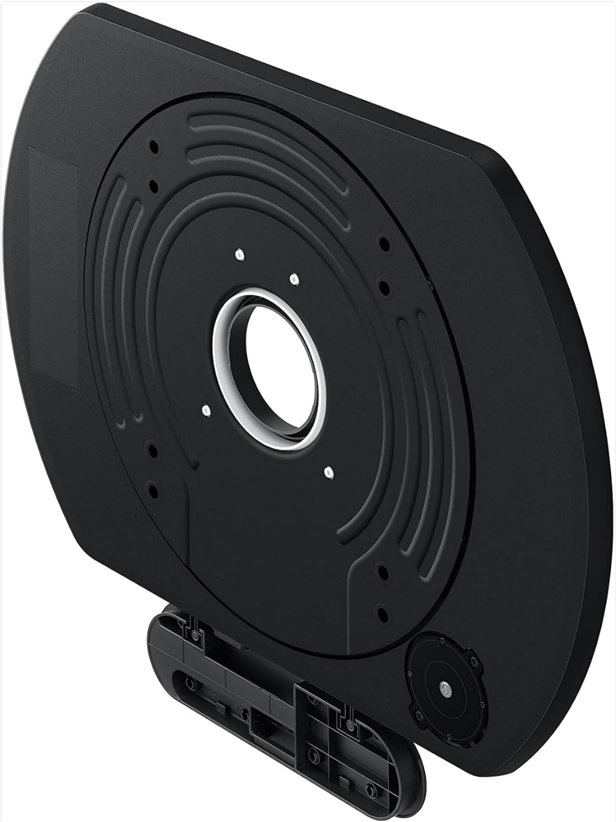
Figure 3.2: Angled view of the rotating mechanism. This image provides a detailed perspective of the mount's rotating components, showing its structural design.