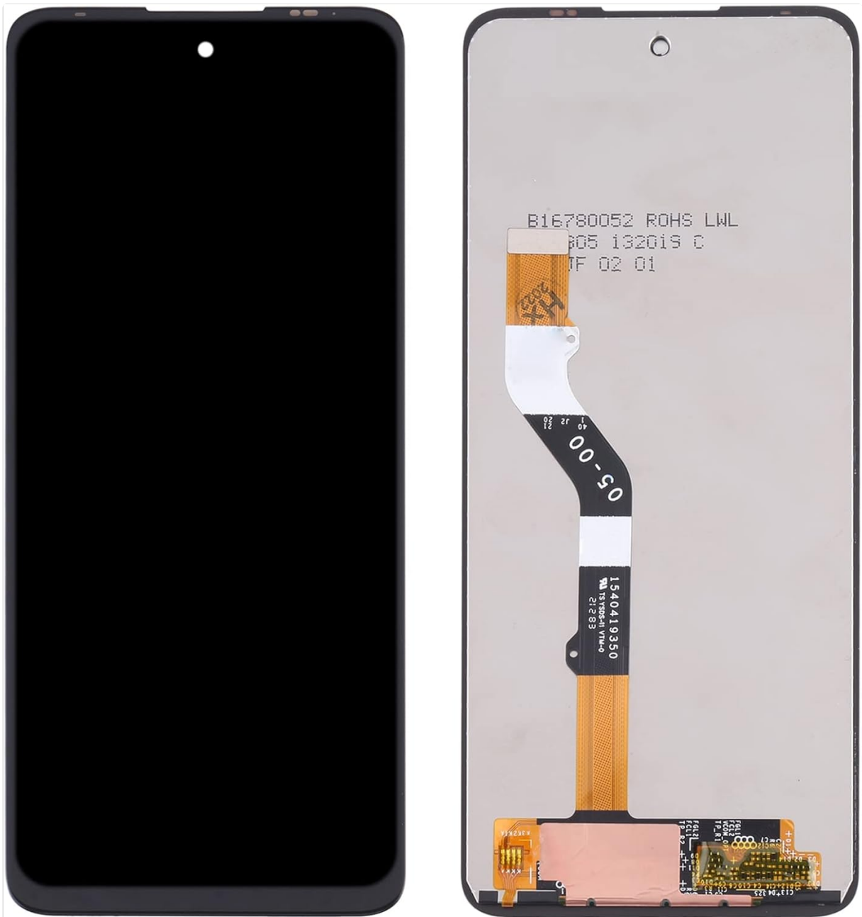
Image: Front and back view of the TFT LCD screen and digitizer assembly. The front shows the display area, and the back reveals the flex cable and connectors.