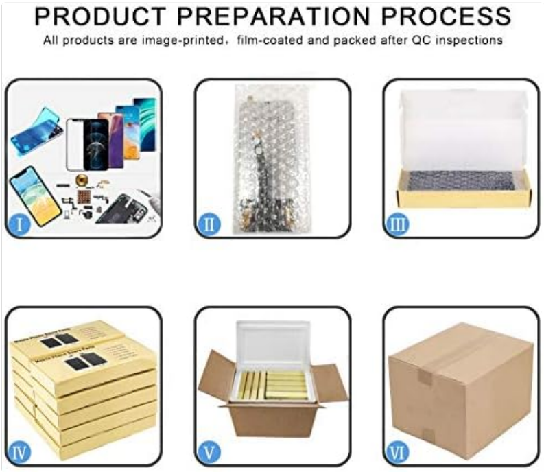
Image: Product preparation process, detailing quality control and packaging steps.