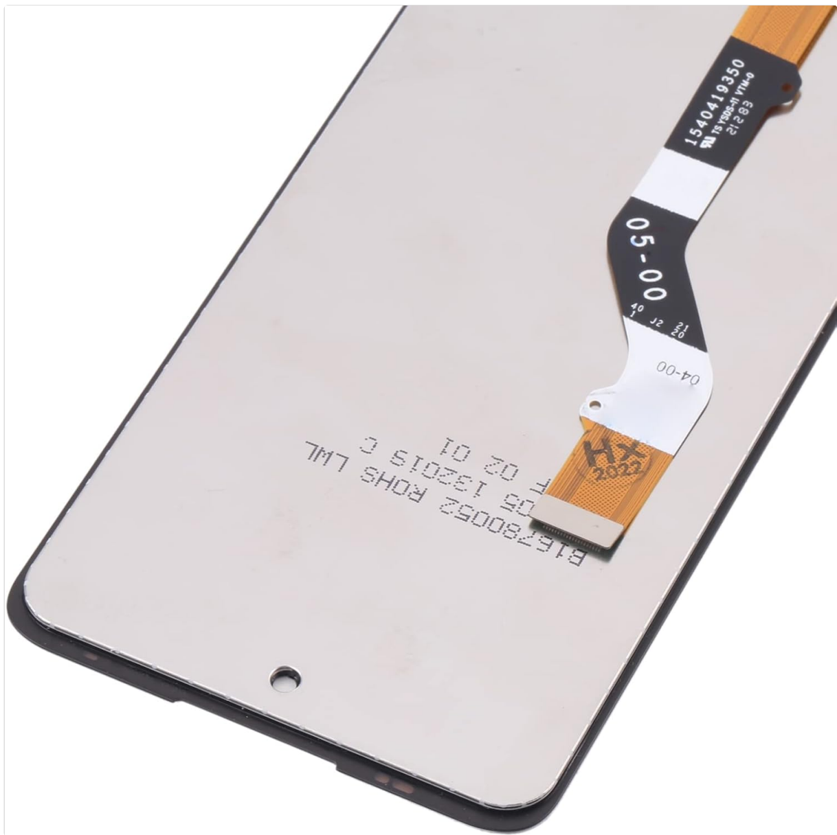
Image: Detailed view of the flex cable and its connection point on the screen assembly.