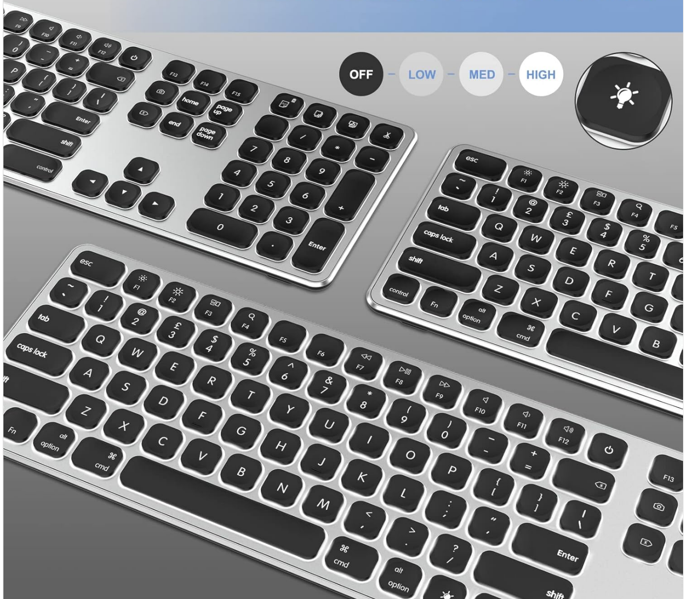
Figure 5.1: The keyboard offers three adjustable backlight levels (Low, Medium, High) and an off setting.