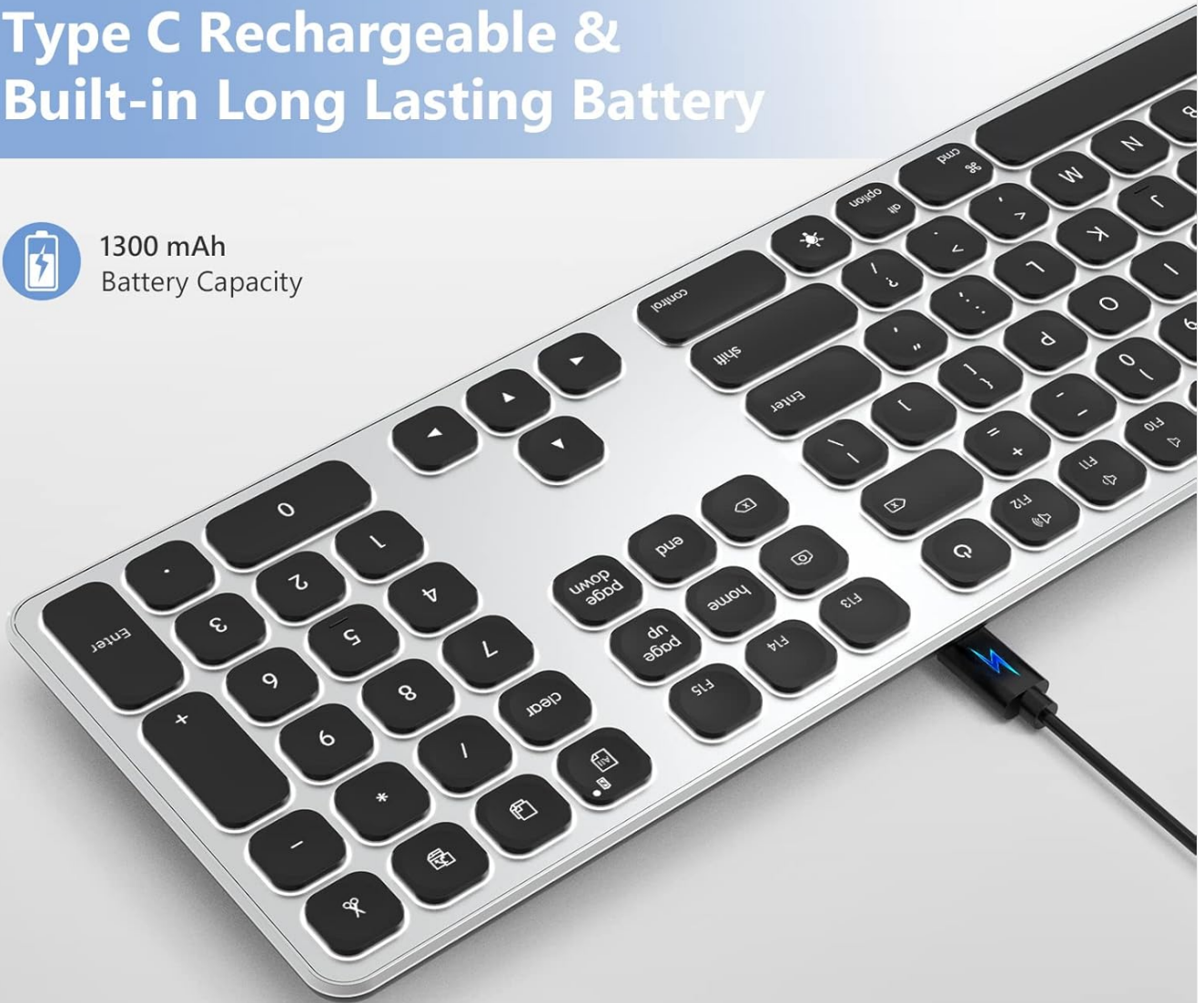
Figure 5.2: Overview of the multimedia and function keys, including Decrease Brightness, Increase Brightness, Mission Control, Search, Previous Track, Pause/Play, Next Track, Mute, Volume Down, Volume Up, Power On/Off (long press), Select All, Copy, and Cut.