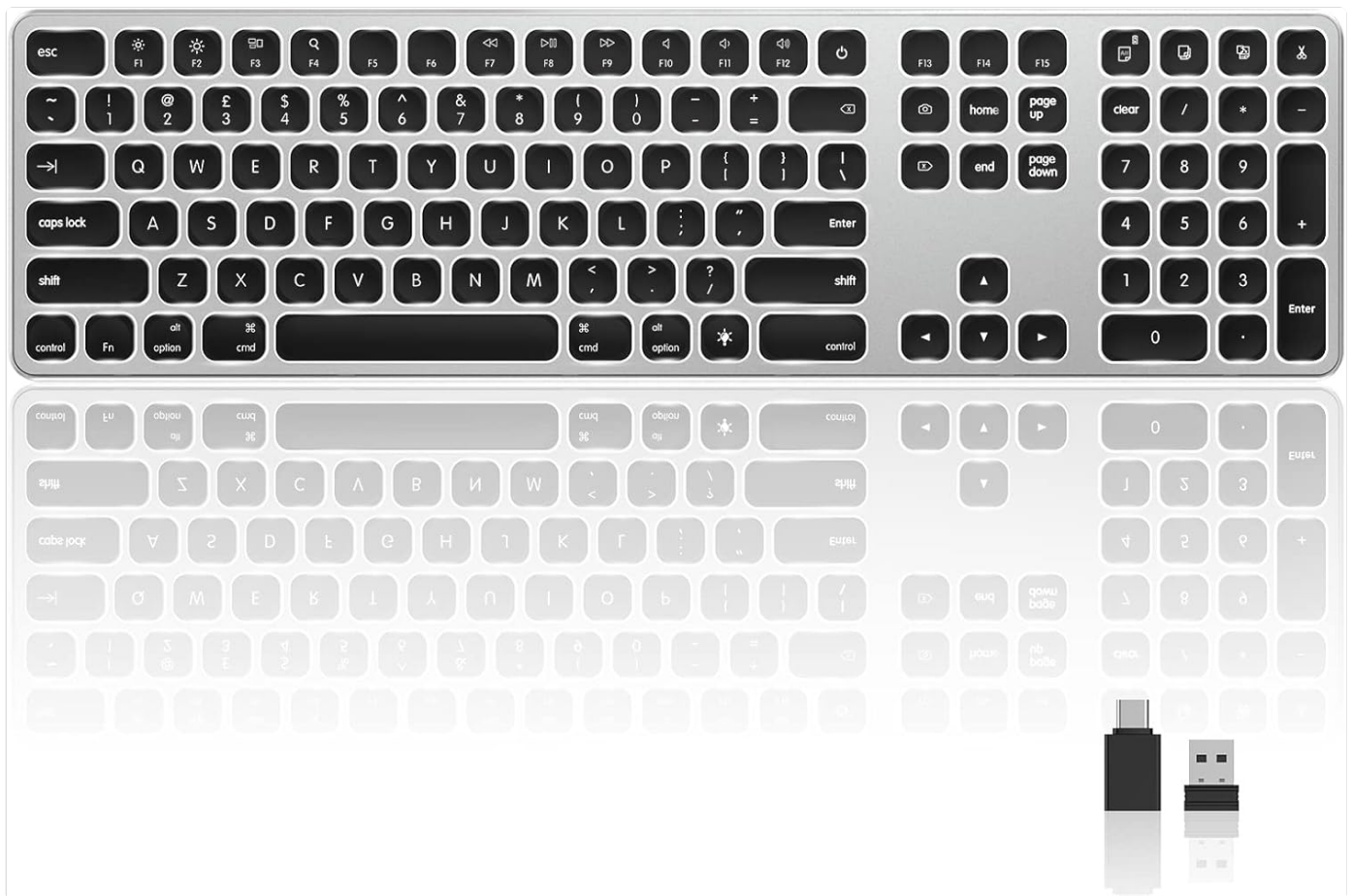
Figure 3.1: Full layout of the Seenda Wireless Backlit Keyboard, showing all keys including the numeric keypad and function row.