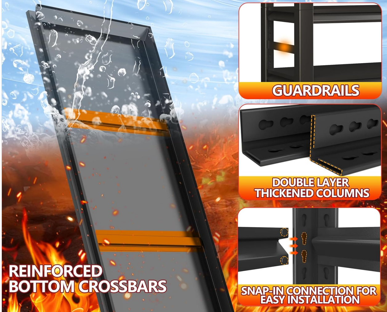
Image: Details of the quality materials and thoughtful design, including reinforced crossbars and thickened columns.