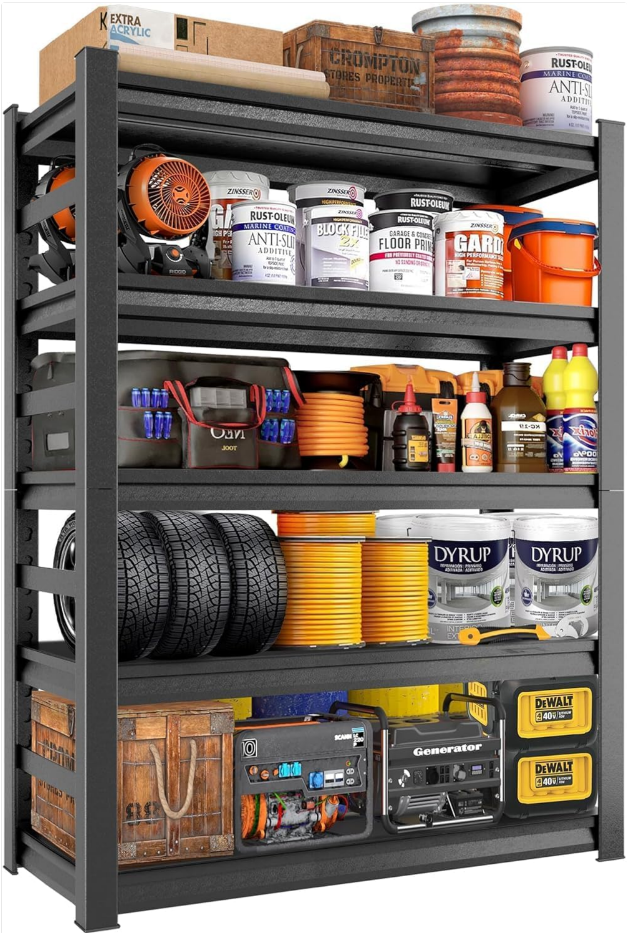
Image: Fully assembled Bezuny shelving unit with various items stored on its five tiers.