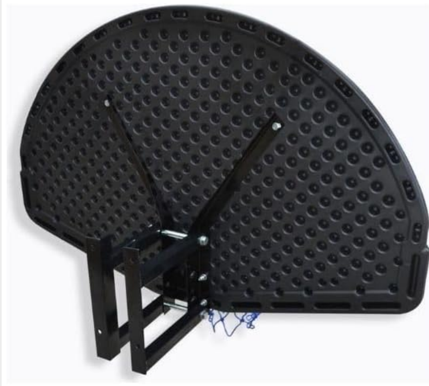
Figure 3.1: Rear view of the Pegasi Basketball Board, illustrating the included steel wall bracket and mounting points. This image helps in understanding the installation process.

Dieses Basketballbrett wird mit Stahlwandhalterung und Befestigungsmaterial geliefert