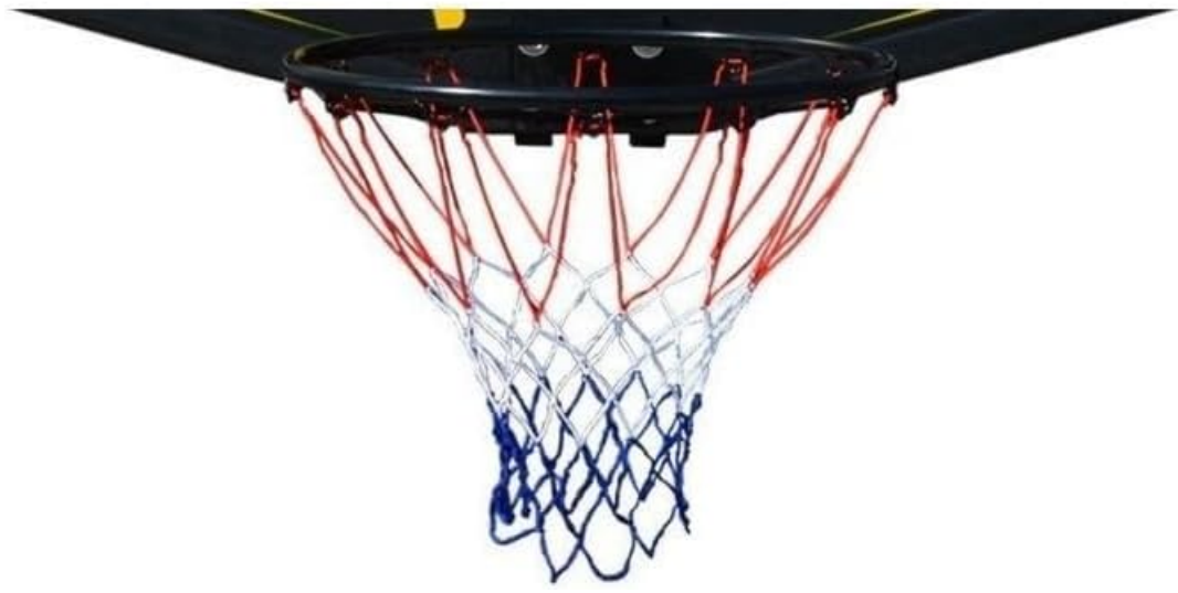
Figure 5.1: This image provides a detailed view of the basketball net, showcasing its weather-resistant nylon material and the white, red, and blue color combination.

Dieser Basketballkorb ist wetterfest und aus Nylon gefertigt