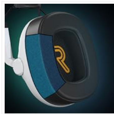
Image: A diagram illustrating the breathable memory foam ear pads, emphasizing comfort and airflow.

Adjust the telescopic arms to ensure a comfortable fit on your head. The soft memory foam ear cushions are designed to sit comfortably over your ears, providing passive noise isolation and comfort during long gaming sessions.