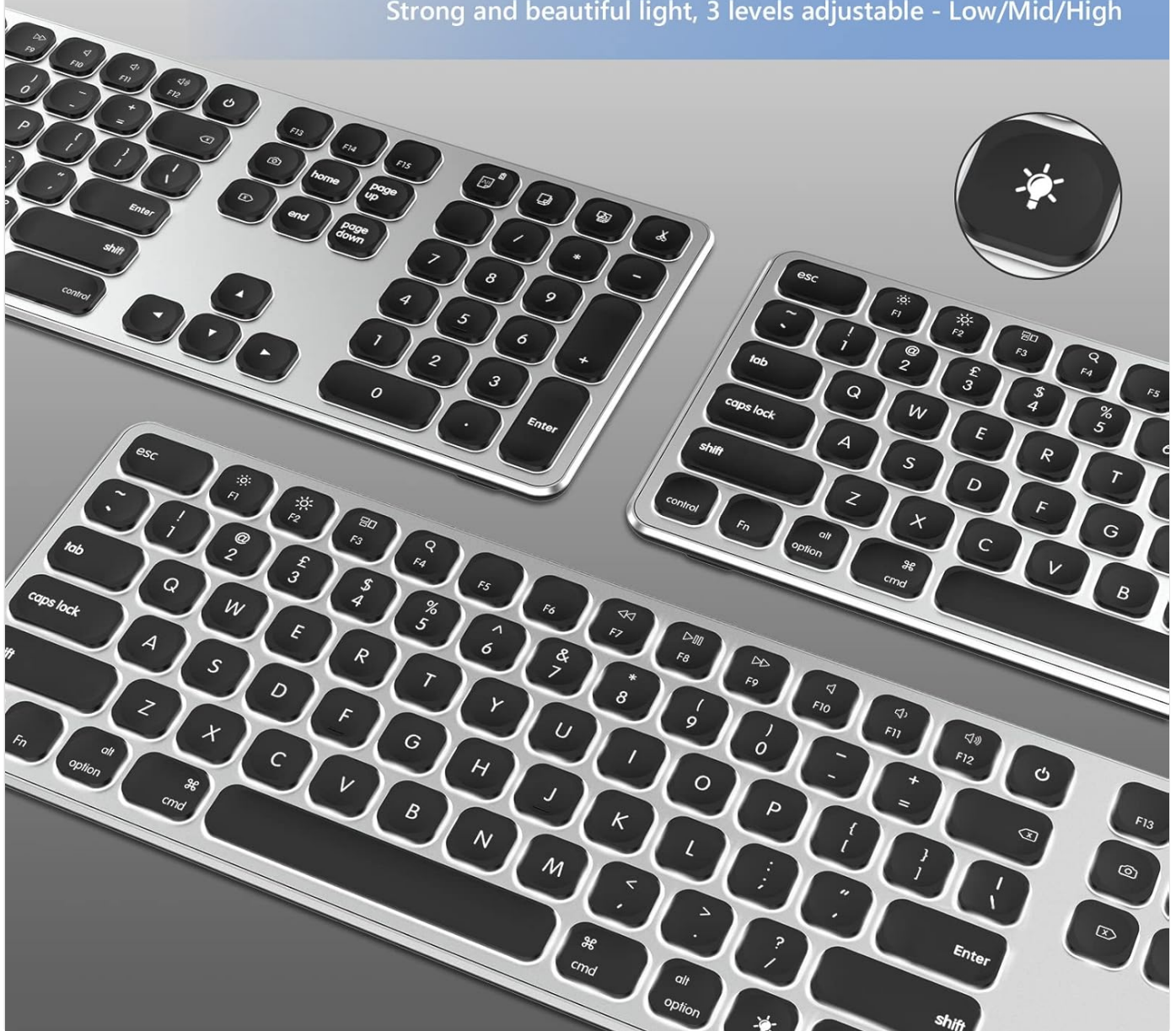
Image: Illustration of the keyboard's adjustable white LED backlight with three brightness levels.

Strong and beautiful light, 3 levels adjustable - Low/Mid/High