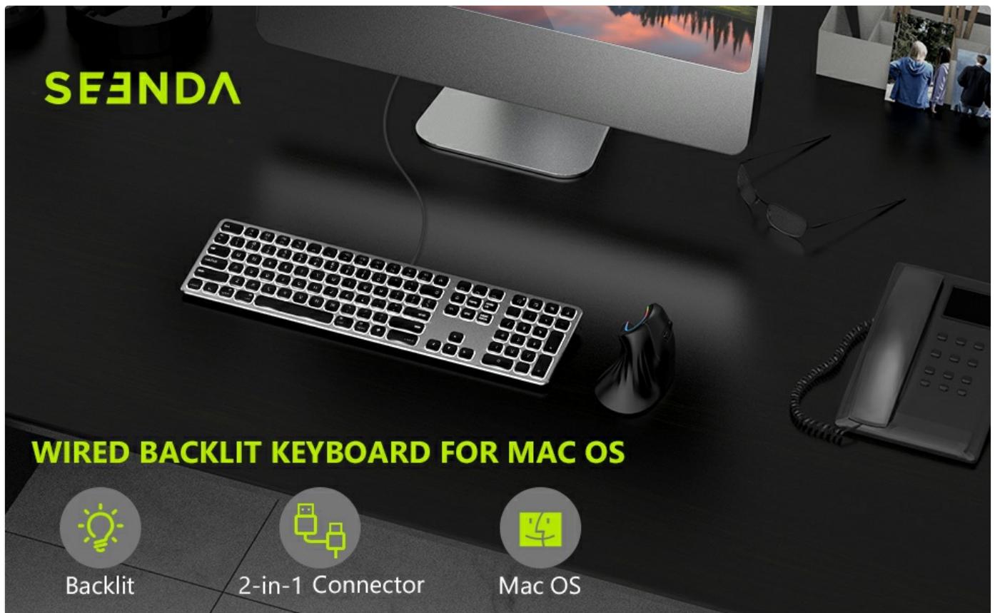
Image: The keyboard's 2-in-1 connector, showing both USB-A and USB-C options for versatile connectivity.

Note: If connecting to an iPad or iPhone, an additional adapter to a Lightning port may be required (not included).