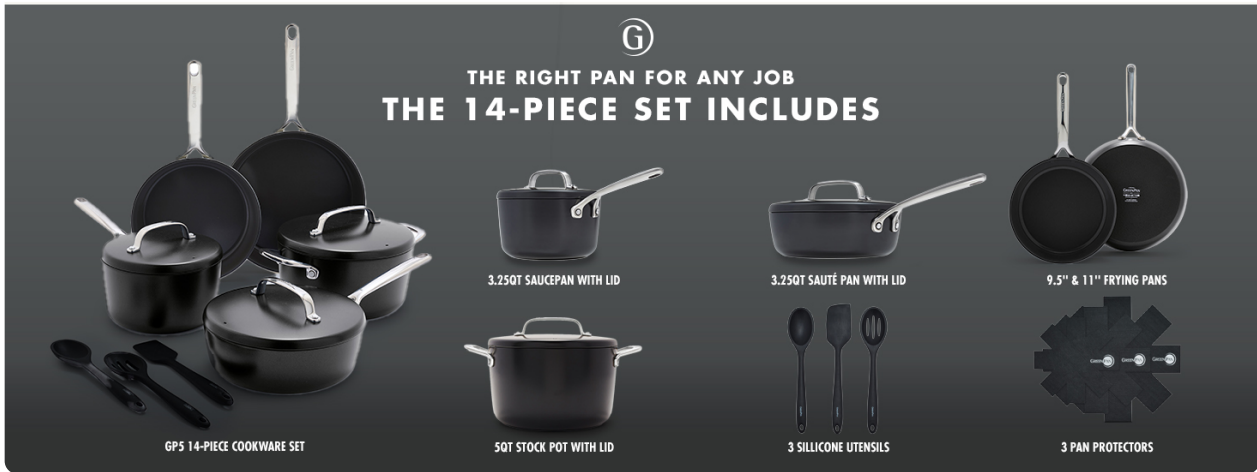
Image: A visual representation of all 14 components included in the GreenPan GP5 cookware set, including pans, pots, lids, pan protectors, and silicone utensils.