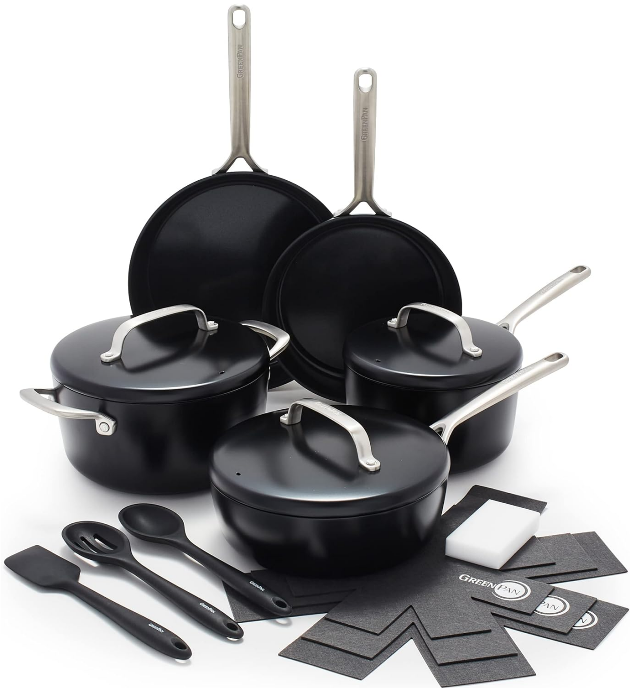
Image: The complete GreenPan GP5 14-Piece Cookware Set, showcasing various pots, pans, lids, and accessories.