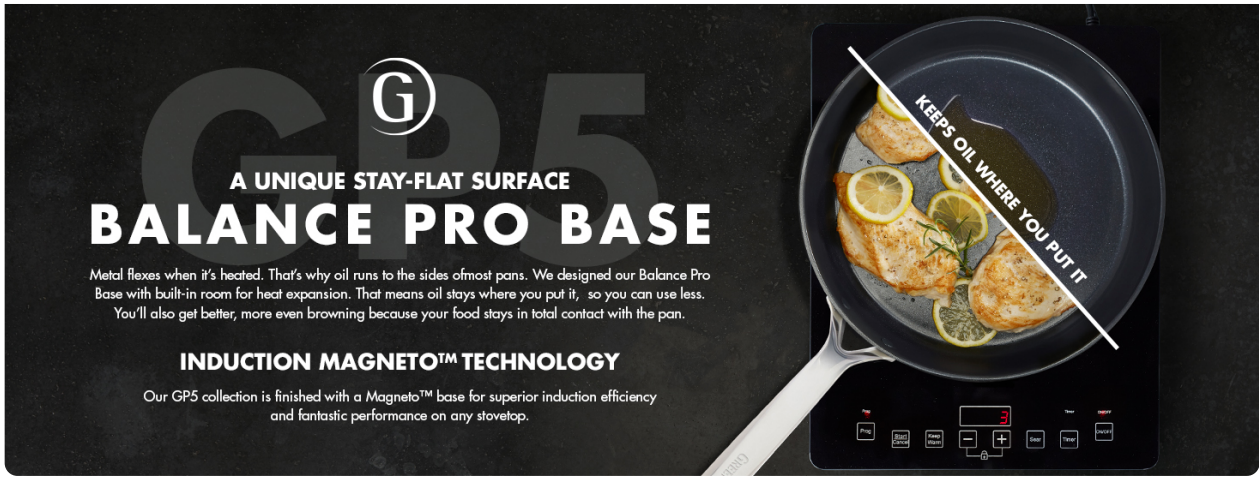
Image: A frying pan demonstrating the Balance Pro Base, which keeps oil evenly distributed, and highlighting the Magneto Induction Technology for efficient heating on all stovetops.