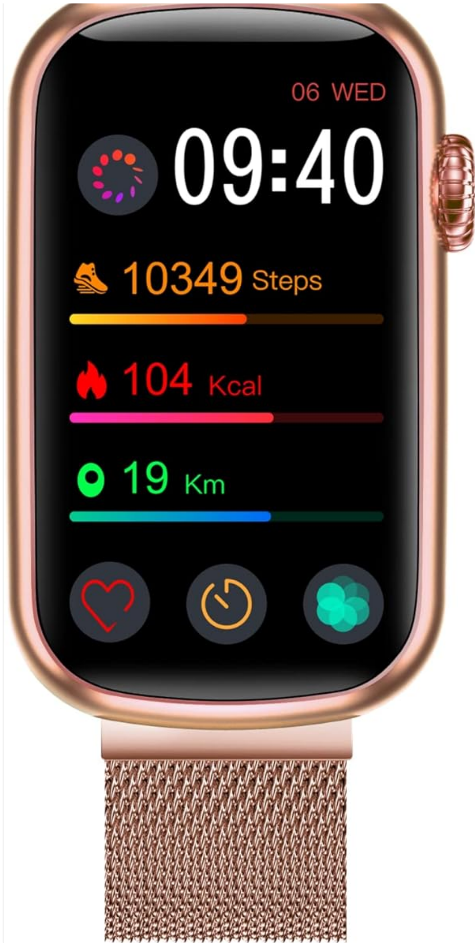
Figure 1: HM08 Smart Watch (Pink Steel Belt). This image shows the watch face displaying steps, calories, and distance, along with icons for heart rate, music, and weather.