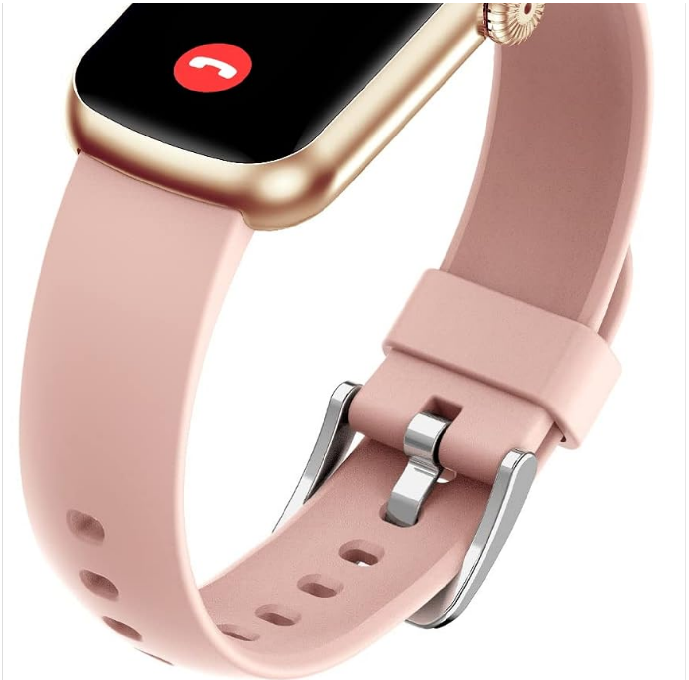
Figure 7: Call reminder feature. This image shows the watch screen displaying an incoming call notification with the caller's name, indicating its ability to alert users to calls.