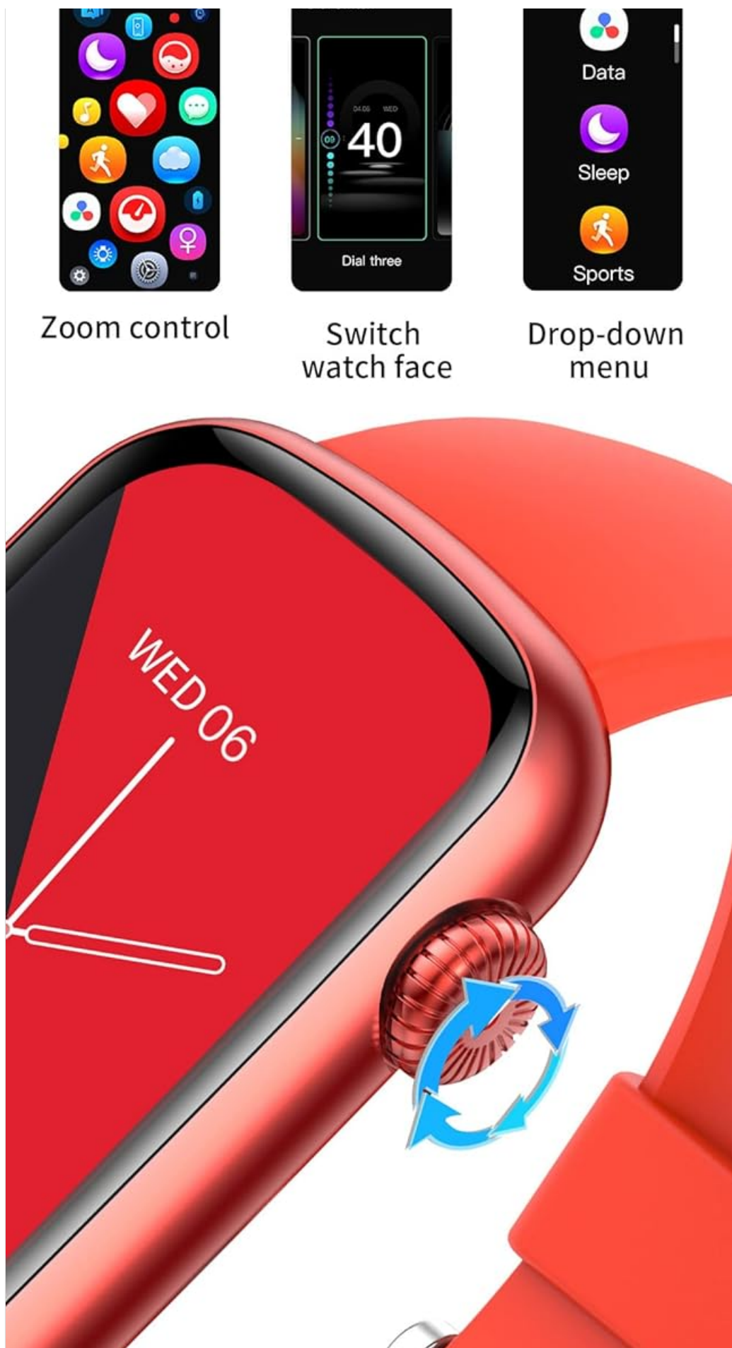
Figure 3: Rotary button controls. This image illustrates the three main functions of the rotary button: zoom control for apps, switching watch faces, and accessing the drop-down menu for quick settings.