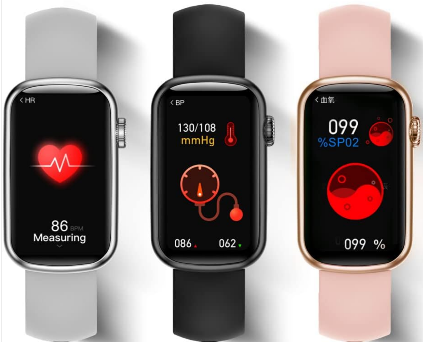
Figure 5: Comprehensive health tracking. This image displays three watches, each showing a different health metric: heart rate, blood pressure, and blood oxygen, emphasizing the watch's ability to monitor multiple vital signs.

Encourage you to develop good habits; it can also monitor heart rate, blood pressure, and blood oxygen. Notify you when detecting abnormal conditions so that you can take action to protect your health.