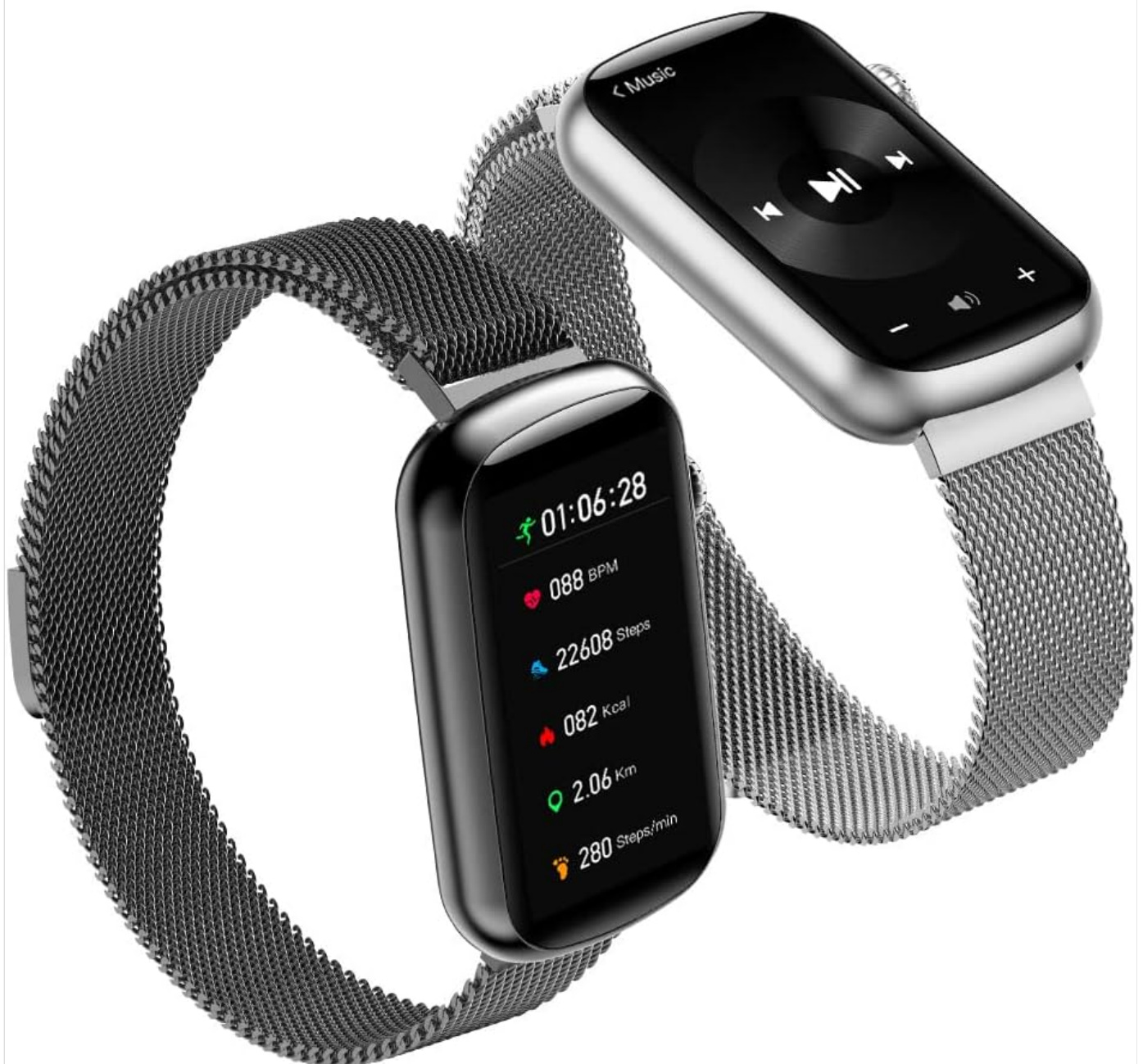
Figure 8: Music control during exercise. This image shows the watch displaying music playback controls, indicating that users can manage their music while tracking exercise data.

During exercise, play mobile phone music synchronously. At the same time of entertainment, record your every exercise data.