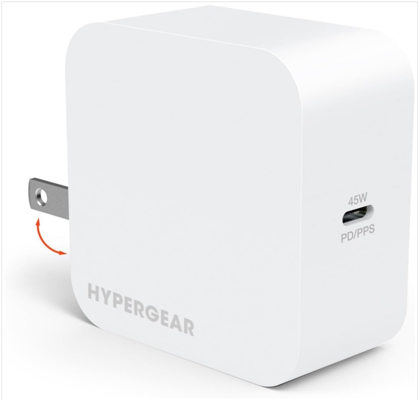
Image: The HyperGear 45W USB-C PD Wall Charger in white, featuring foldable prongs for portability.