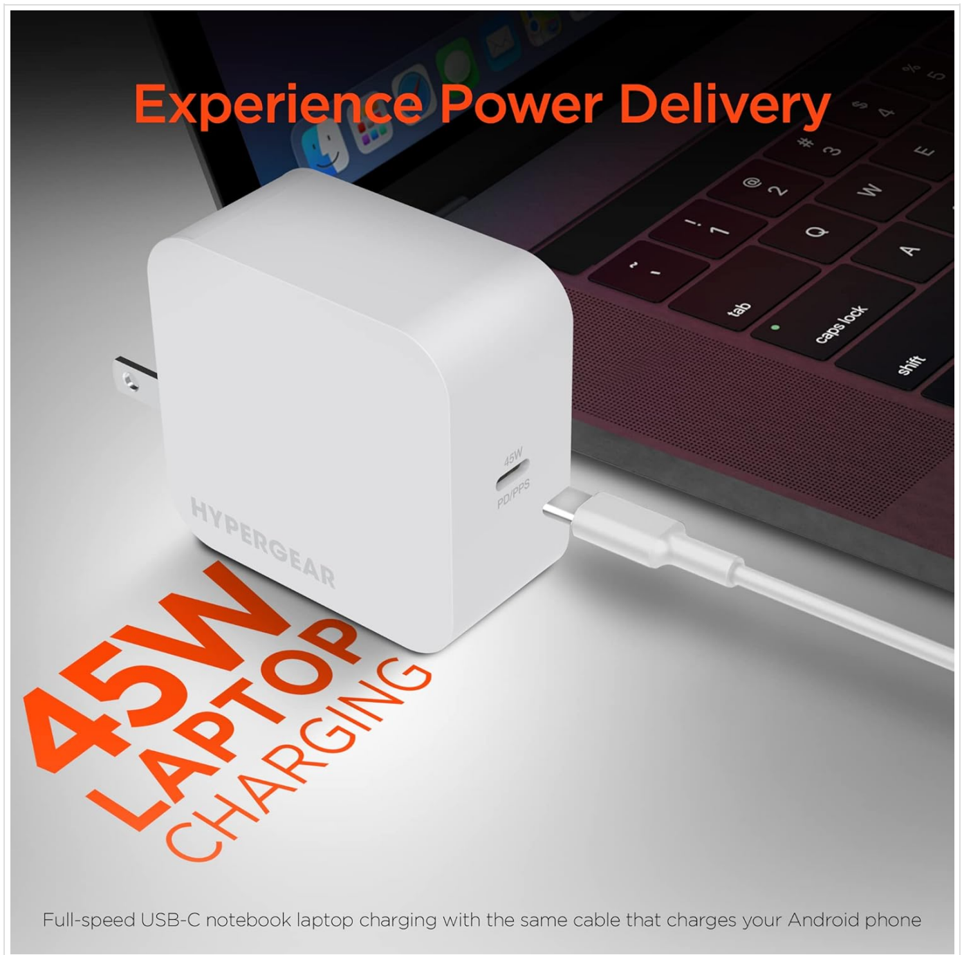
Image: The 45W USB-C PD Wall Charger providing full-speed charging to a laptop, demonstrating its high power output.