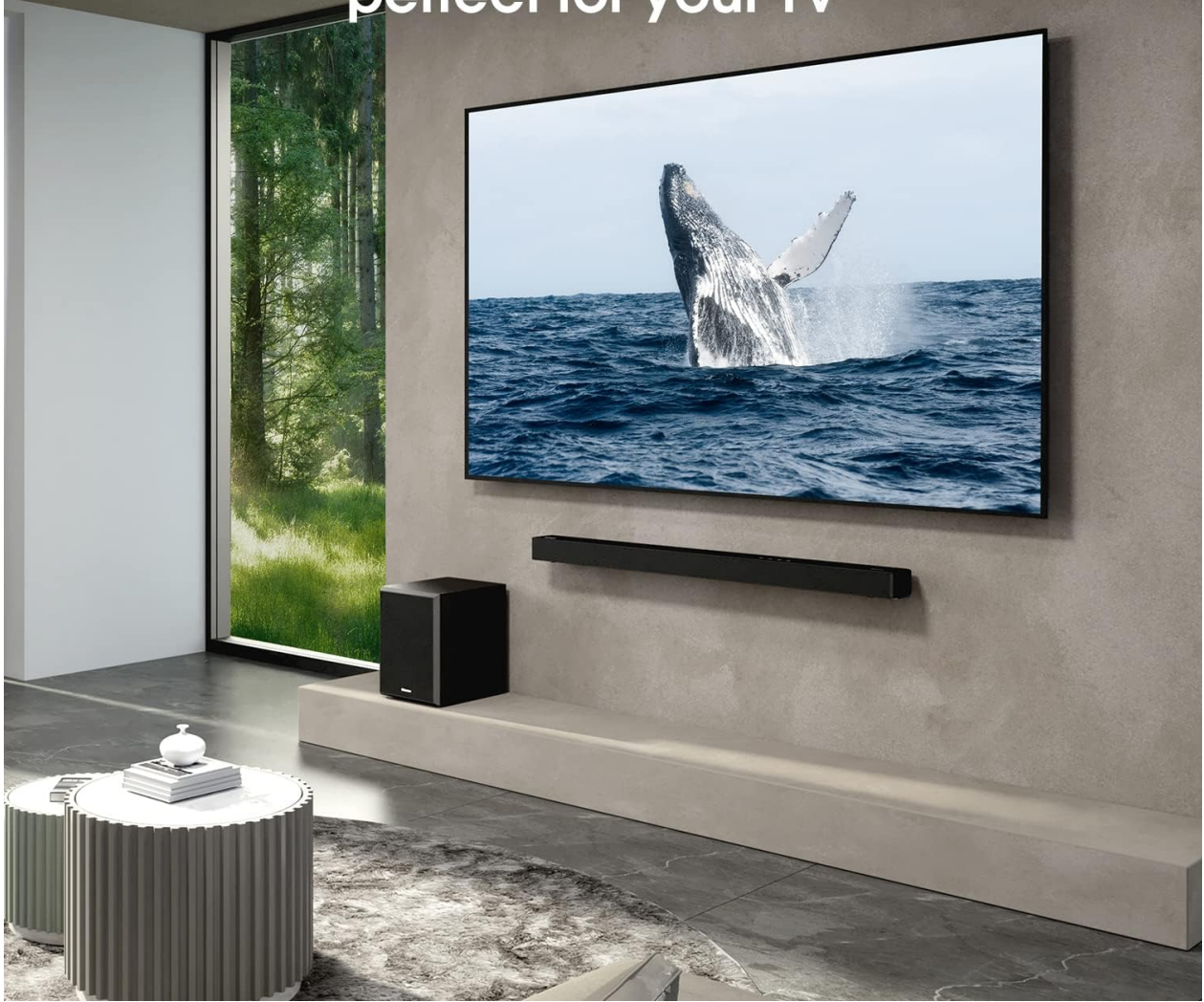
Image: A Hisense sound bar and subwoofer positioned in a living room setup with a large television, illustrating a typical home theater arrangement.