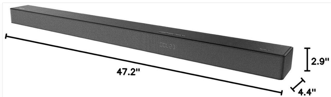
Image: The dimensions of the Hisense sound bar, showing a length of 47.2 inches, a width of 4.4 inches, and a height of 2.9 inches.