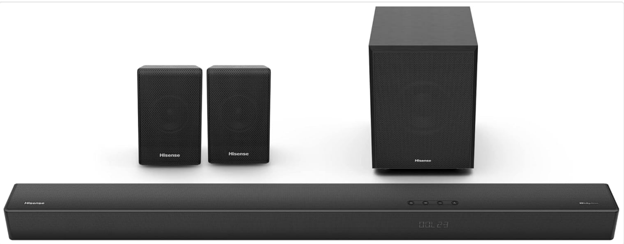
Image: The Hisense U5120GW+ sound bar system, including the main sound bar unit, two wireless rear speakers, and a wireless subwoofer.