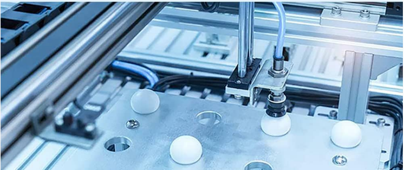
Figure 5: Example of the ESP32 module's application in industrial automation, contributing to reliable and efficient control systems.

Products Are Designed And Produced To Meet Various Industry Standards And Requirements,Therefore, The Reliability And High Performance Of The Automatic Control System Can Be Guaranteed.