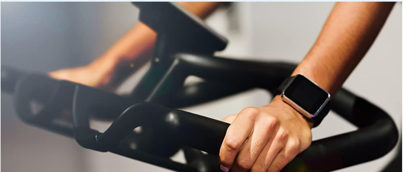
Figure 2: Illustration highlighting the ultra-low power consumption capabilities of the ESP32 module, featuring an ultra-low power RF architecture and power-saving patents for extended battery life.

The Esp32 Low-Power Chip Includes Three Technical Features: Fine -Grained Clock Gate, Multiple Low-Power Modes, Adaptive Dynamic Voltage Adjustment.