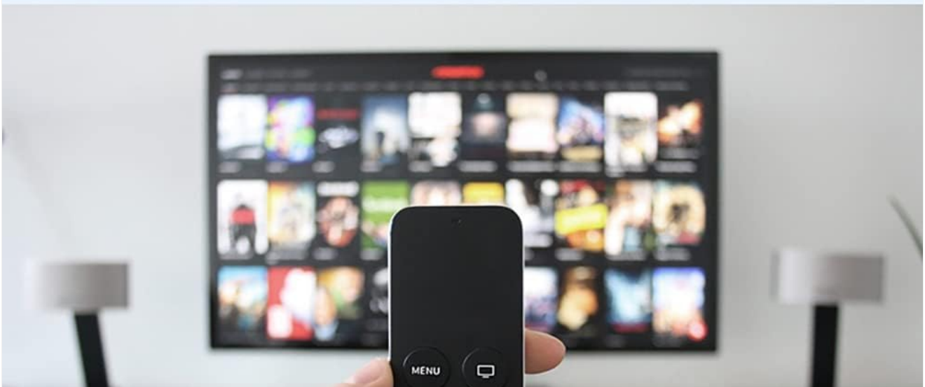
Figure 4: Example of the ESP32 module's application in smart home environments, enabling wireless connectivity for various devices and systems.

Helping The Development Of The IoT Smart Home Industry To Make Life Smarter And More Comfortable. Wireless Connection Products Can Help Manufacturers Easily Realize The Wireless Network Function Of Hardware Devices, Multiple Platforms Are Currently Supported.