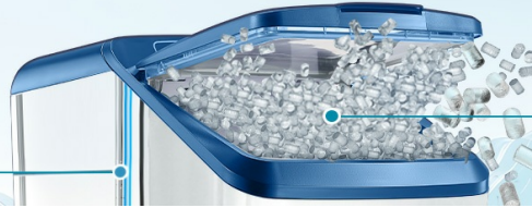
A graphic highlighting the rapid ice production, with the first batch ready in 5 minutes and up to 38 lbs in 24 hours.

press clean button to activate the selfclean function. Use the selfcleaning function to keep your ice cube maker's interior hygienic and