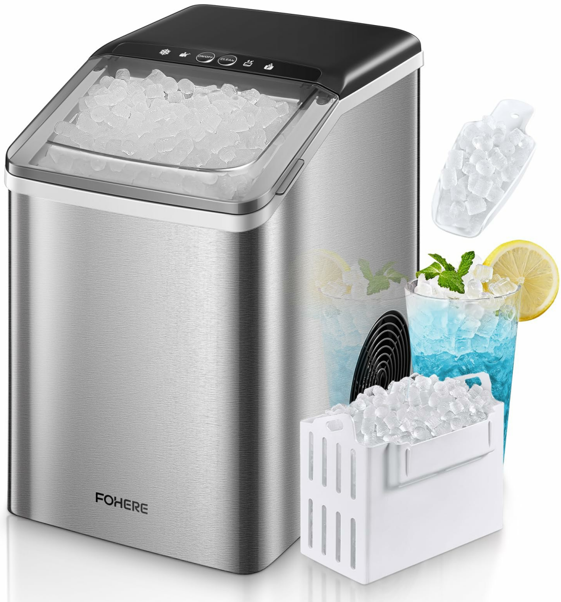
The FOHERE Nugget Ice Maker Machine in stainless steel silver, showcasing its sleek design.