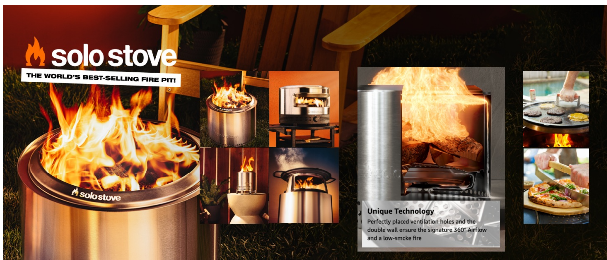
Image: The Solo Stove Yukon 2.0 in use, providing a warm ambiance for a gathering.

The Solo Stove Yukon 27 Inch Smokeless Fire Pit is designed to provide a cozy, smoke-free outdoor fire experience. Its innovative airflow design efficiently burns off smoke, ensuring a comfortable environment free from smoke and lingering odors. Crafted from premium 304 stainless steel, the Yukon 2.0 offers durability and performance for years of enjoyment. This manual provides essential information for the safe and effective use and maintenance of your fire pit.