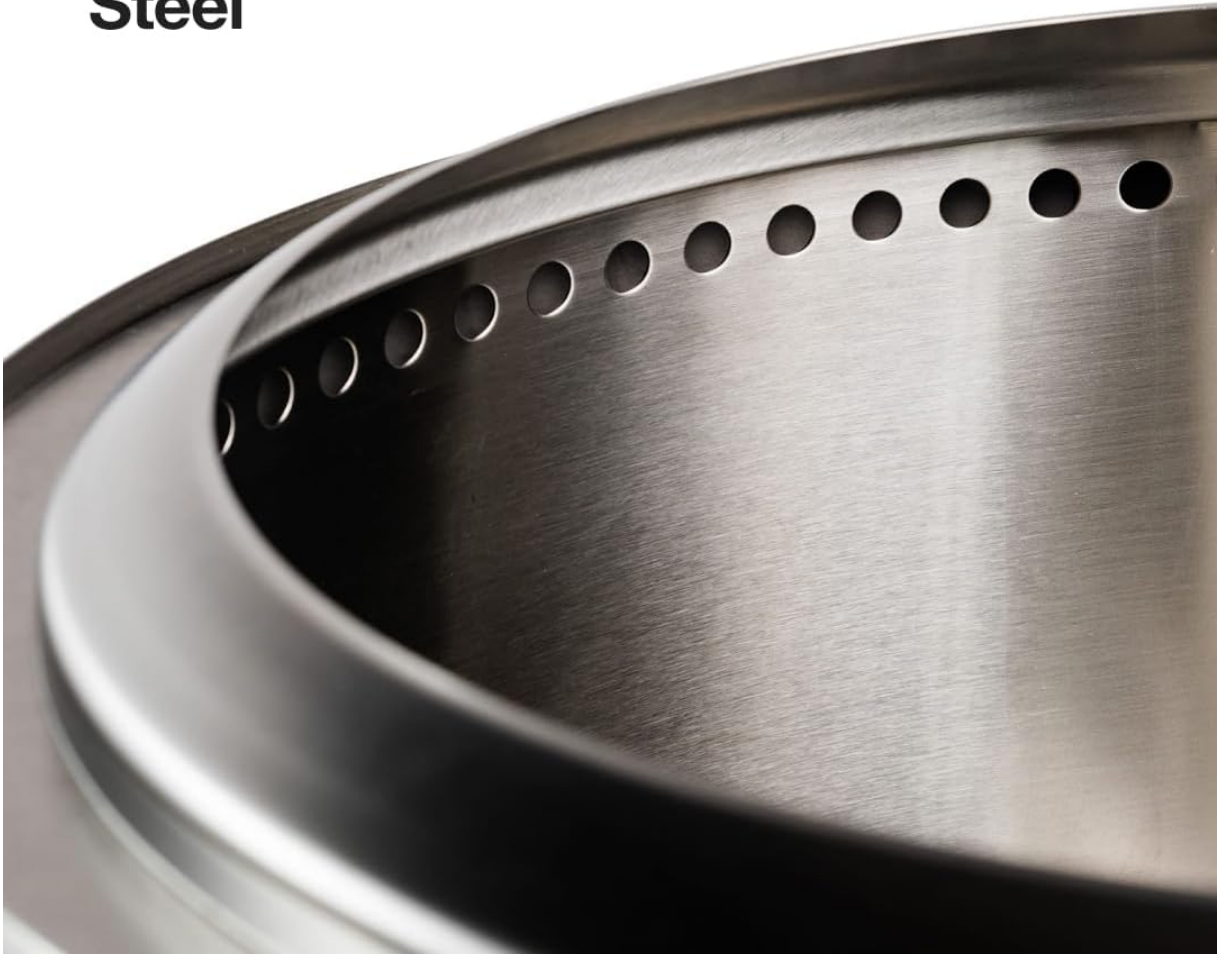
Image: A cutaway diagram showing the internal airflow system that creates the smokeless burn.