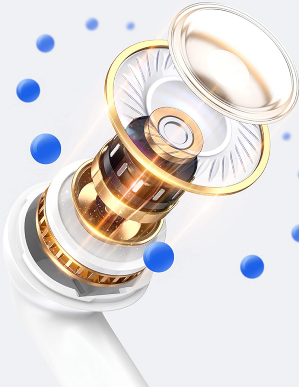
Image: An illustrative diagram detailing the internal structure and acoustic components of an earbud, highlighting its multi-layered design.