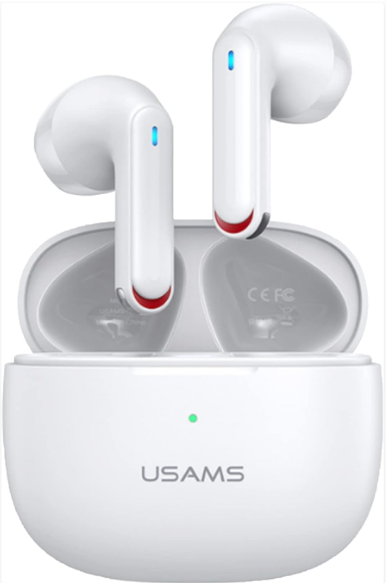
Image: The USAMS NX10 earbuds resting in their charging case, with indicator lights visible on the earbuds and case.