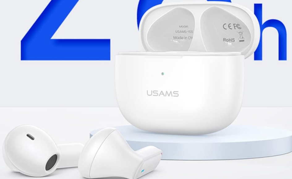
Image: Battery life indicators for the USAMS NX10, showing 5 hours per charge, 4.5 additional charges from the case, and a total of 28 hours of battery life.