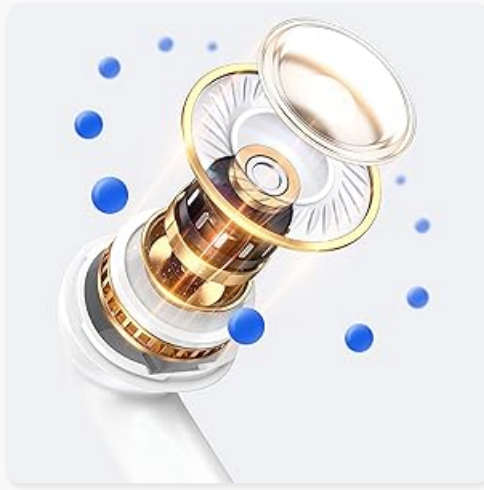
Image: An illustration demonstrating the noise suppression capabilities of the earbuds, indicating 90% noise suppression and 30dB noise reduction depth.