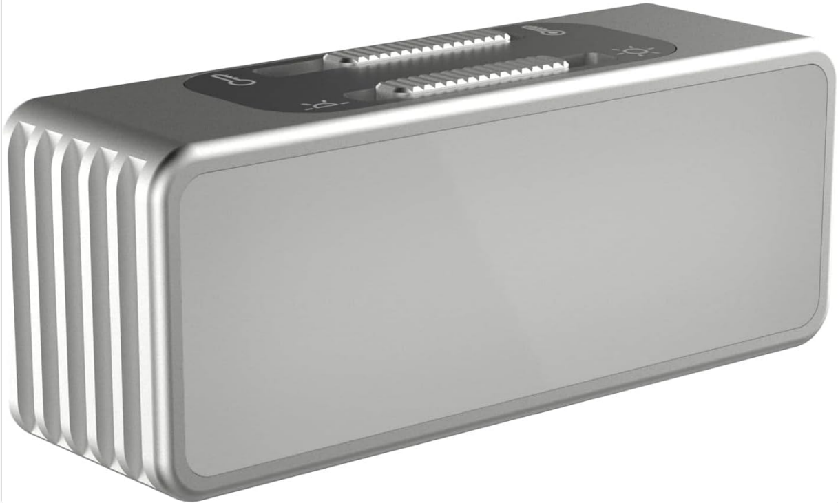
Figure 4: The magnetic fill light securely attached to a smartphone mounted on a FeiyuTech gimbal, ready for use.

Color temperature range: 3300K~5200K (adjustable)