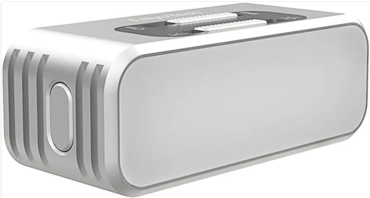
Figure 3: Side view of the fill light, showing the USB-C charging port.