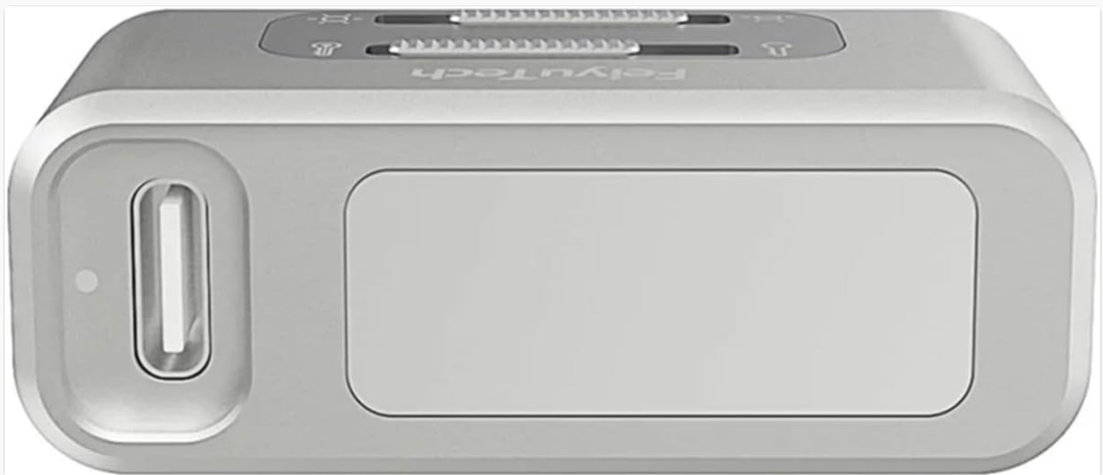
Figure 2: Top view of the fill light, highlighting the brightness and color temperature adjustment switches.