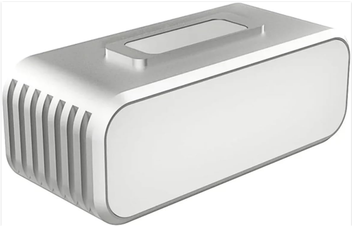
Figure 1: Front view of the FeiyuTech Magnetic Fill Light, showcasing its compact rectangular design with a textured side for grip.