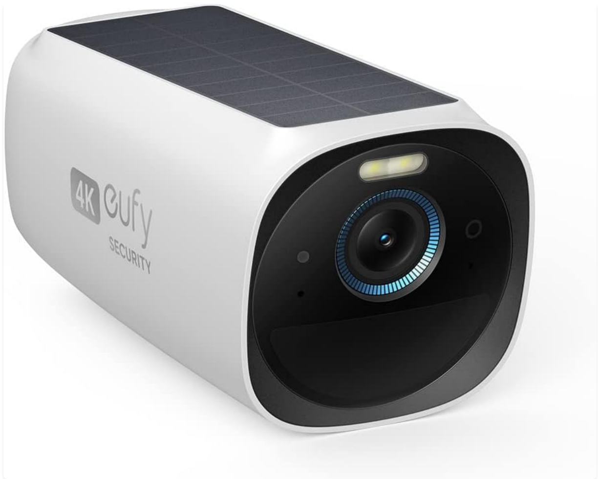
Image 1.1: The eufyCam S330 Add-on Camera, a 4K wireless security camera with an integrated solar panel.