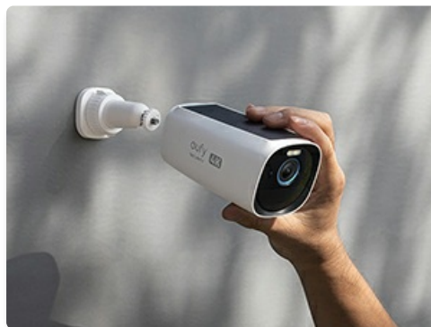
Image 4.1: A hand demonstrating the mounting process of the eufyCam S330 camera onto a wall bracket.

Select a mounting location that provides optimal sunlight exposure for the solar panel and a clear view of the desired monitoring area. The camera is designed for wall mounting.