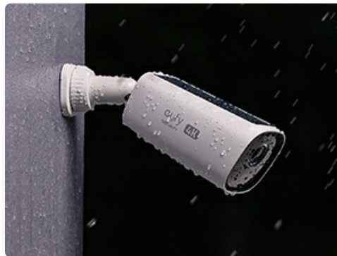
Image 6.1: The eufyCam S330 camera enduring rainfall, illustrating its weatherproof design.