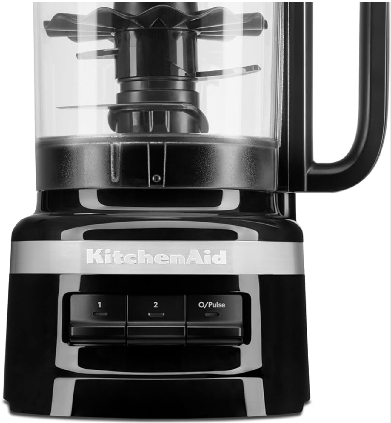
Figure 2: Front view of the KitchenAid 2.1L Food Processor, highlighting the control panel with '1', '2', and 'Pulse' buttons.