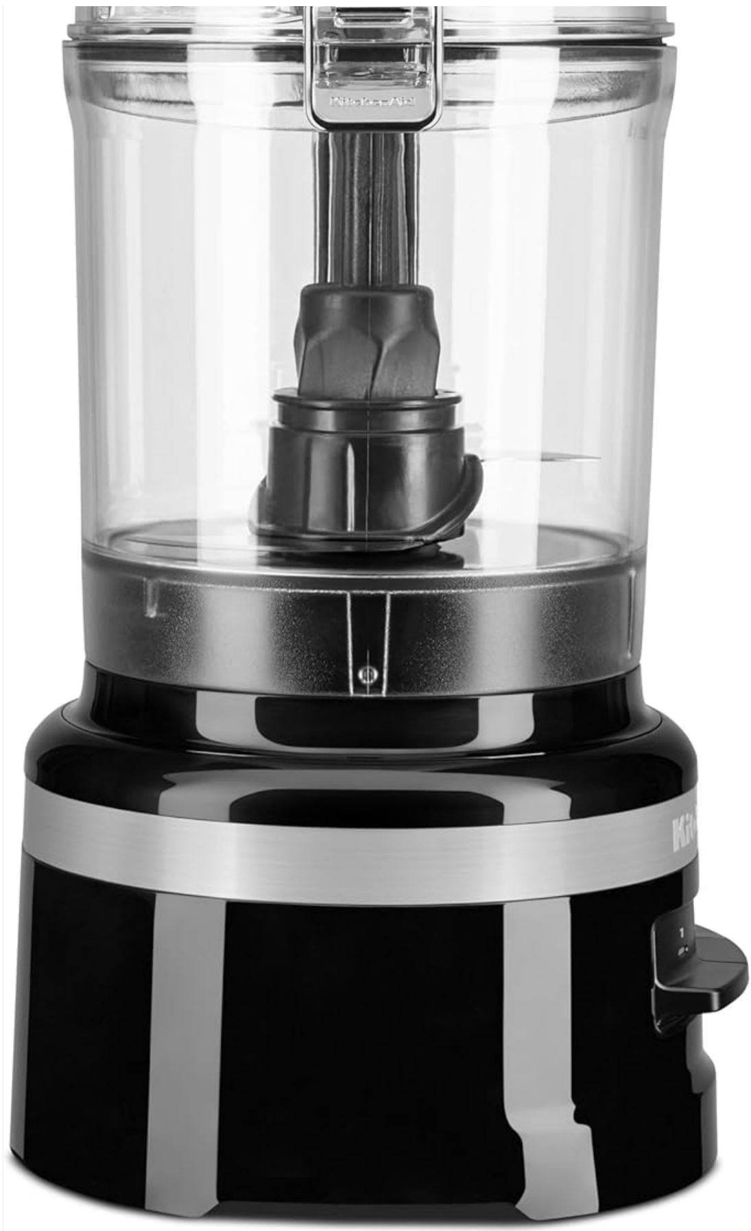
Figure 3: Side view of the KitchenAid 2.1L Food Processor, showing the clear work bowl and the feed tube on the lid.