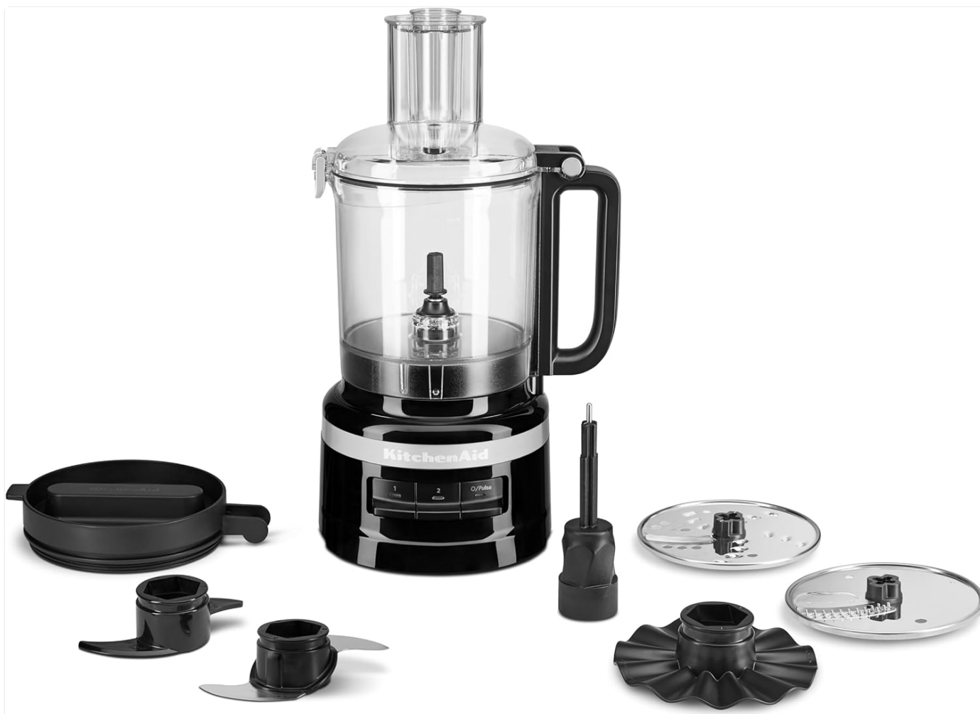
Figure 1: The KitchenAid 2.1L Food Processor base unit, work bowl, lid, and various accessories including the multi-purpose blade, dough blade, reversible shredding/slicing disc, Julienne disc, and whisk accessory.