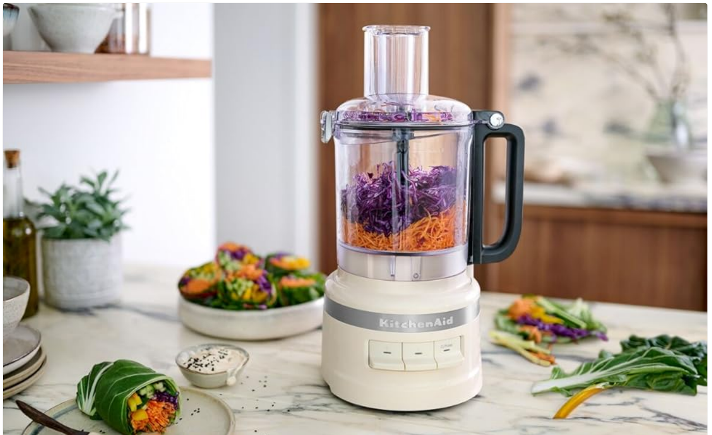
Figure 5: The KitchenAid Food Processor fully assembled on a kitchen counter, ready for use, with various ingredients prepared for processing.