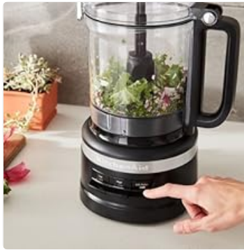
Figure 9: The food processor work bowl containing chopped tomatoes and other ingredients, indicating its use for preparing items like salsa.