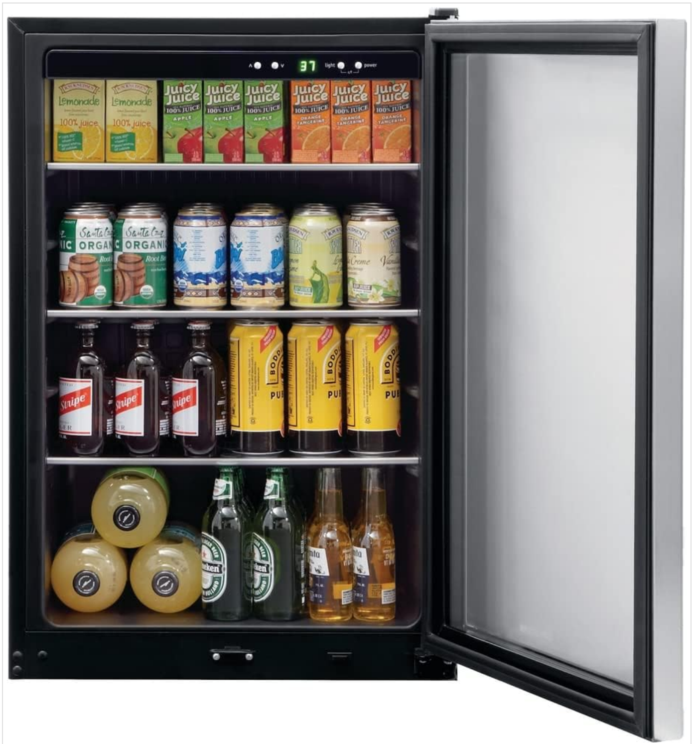
Figure 4: Interior Storage Capacity.