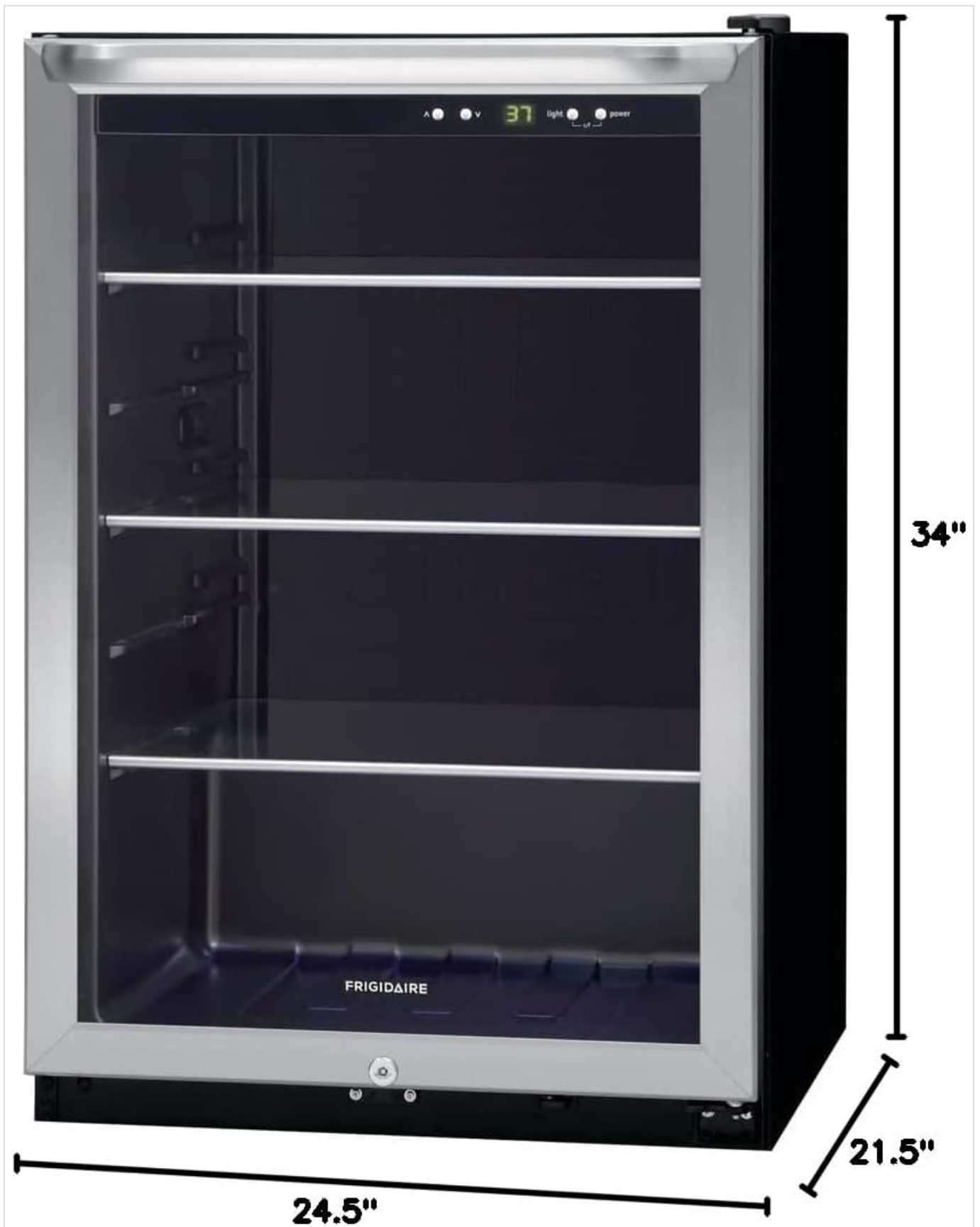
Figure 1: Product Dimensions for Placement Planning.