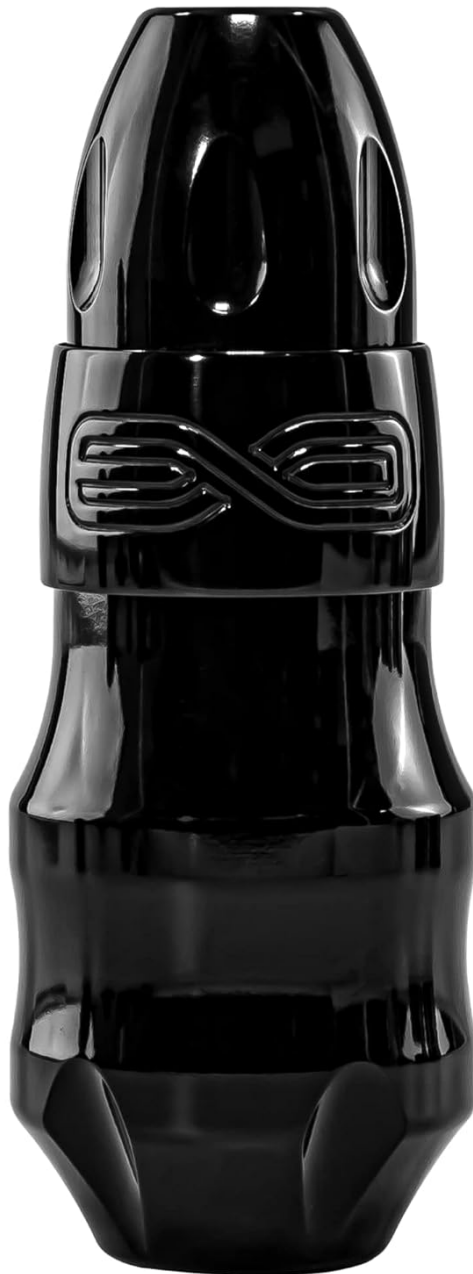
Image: The FK Irons EXO Modular Rotary Tattoo Machine Pen in Stealth finish, showcasing its sleek design.