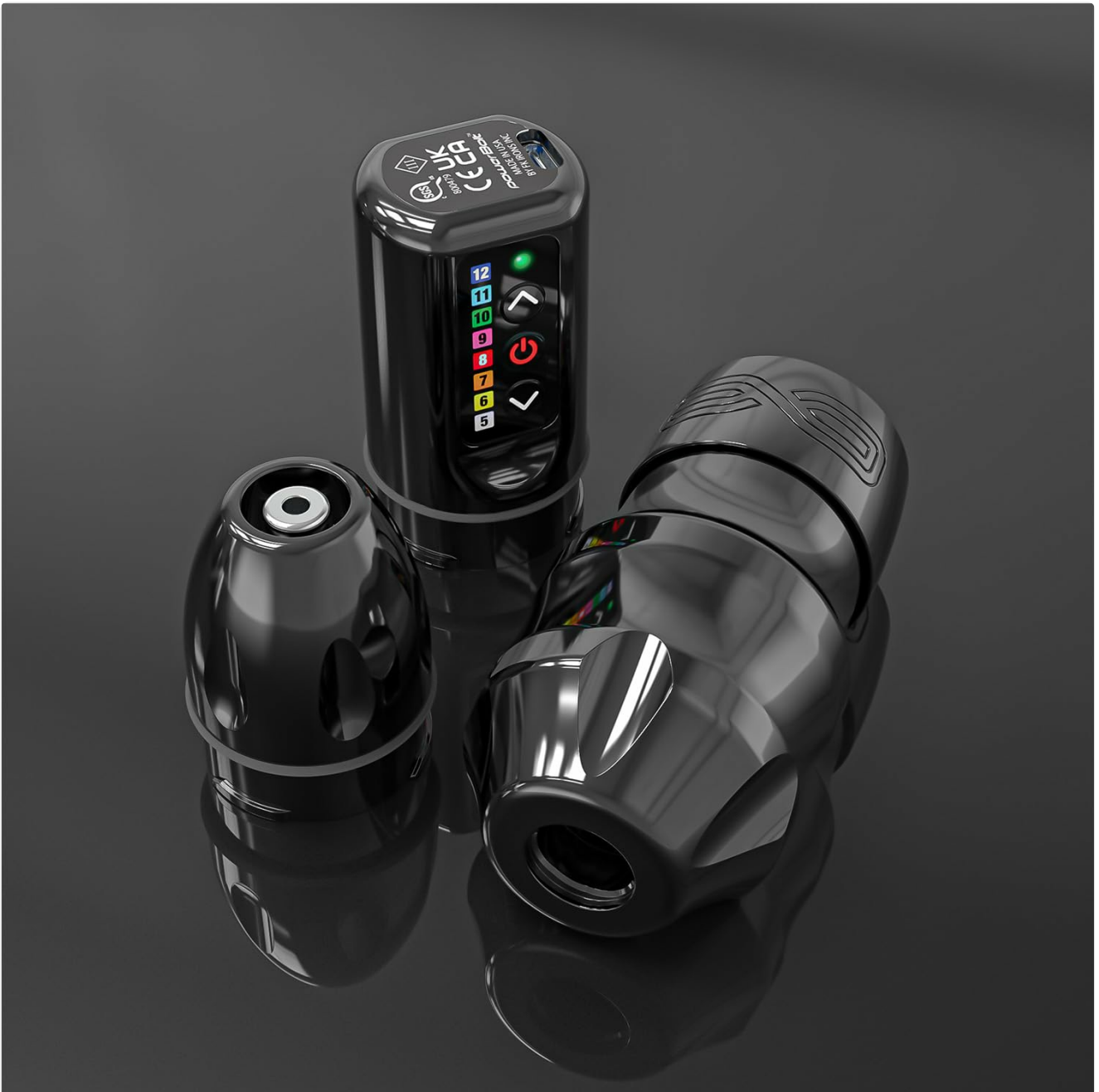
Image: The FK Irons EXO machine fully assembled with the PowerBolt battery pack, ready for wireless operation.