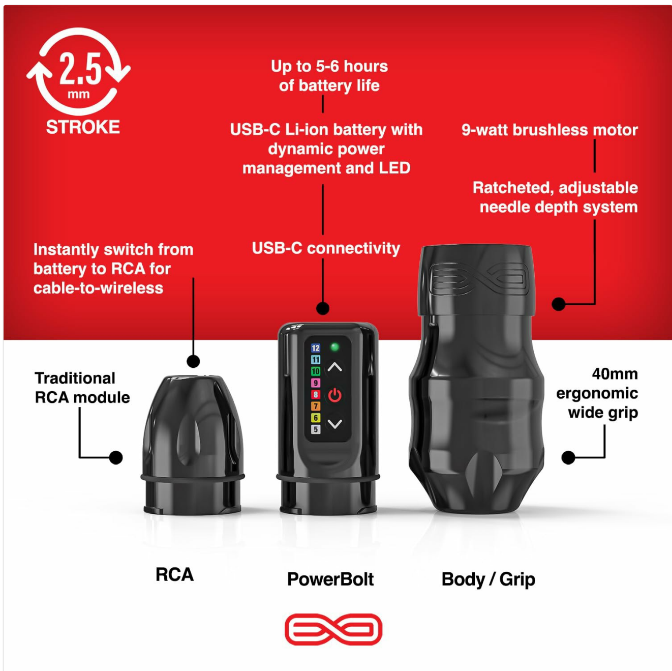
Image: Exploded view of the FK Irons EXO components: RCA module, PowerBolt battery, and the main body/grip, highlighting the 2.5mm stroke.