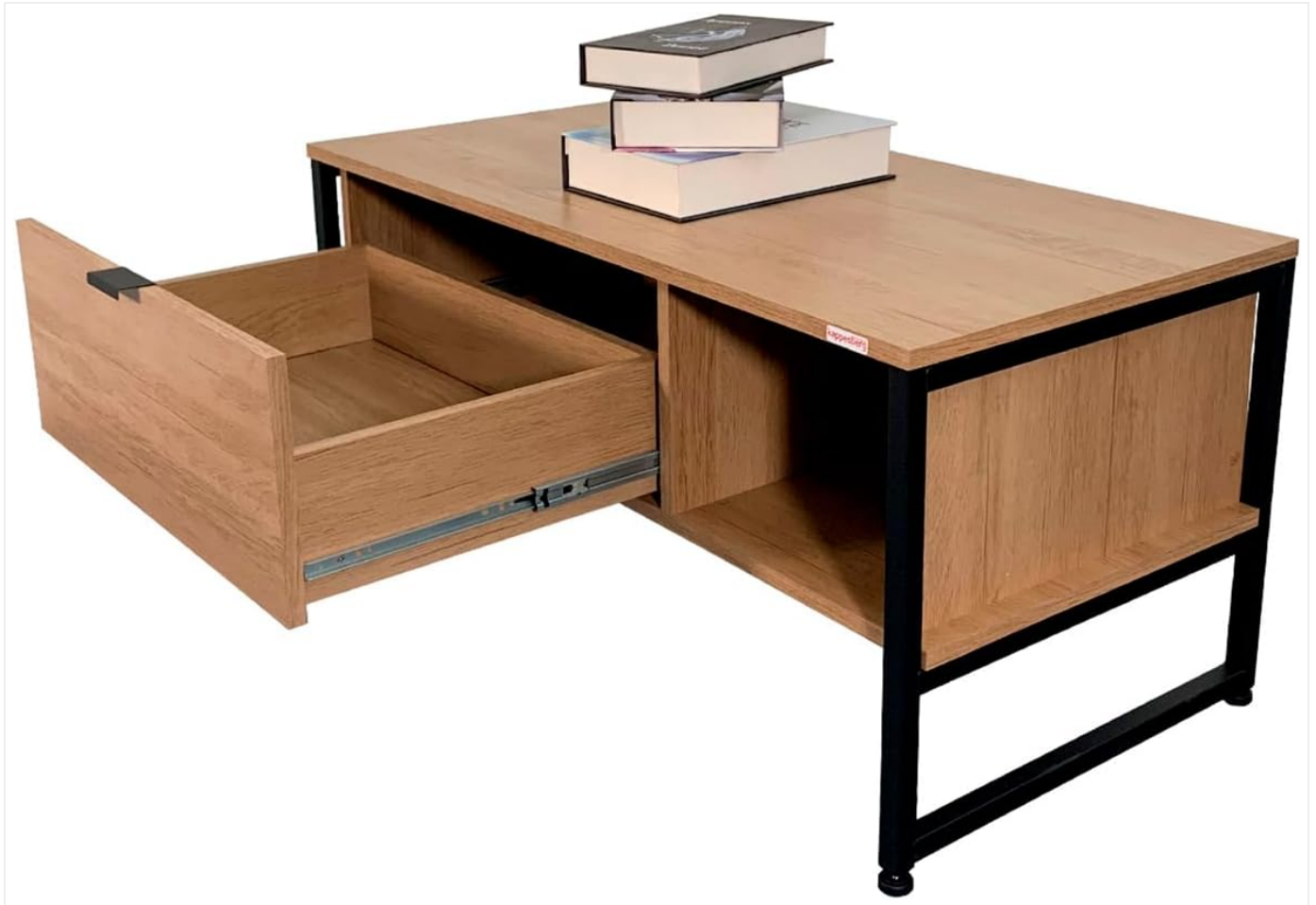
Image: The Kappesberg LI019 coffee table with its drawer fully extended, revealing the telescopic slides and the adjacent open storage niche.