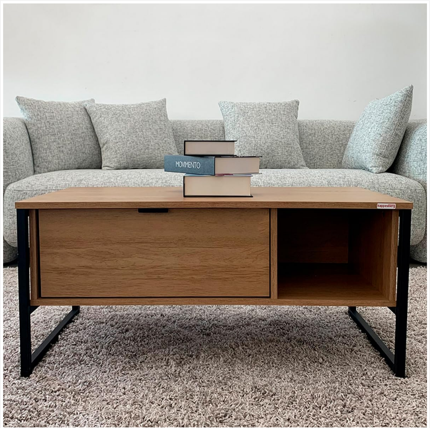
Image: The Kappesberg LI019 coffee table positioned in a living room, showcasing its functional design with a drawer and open niche.