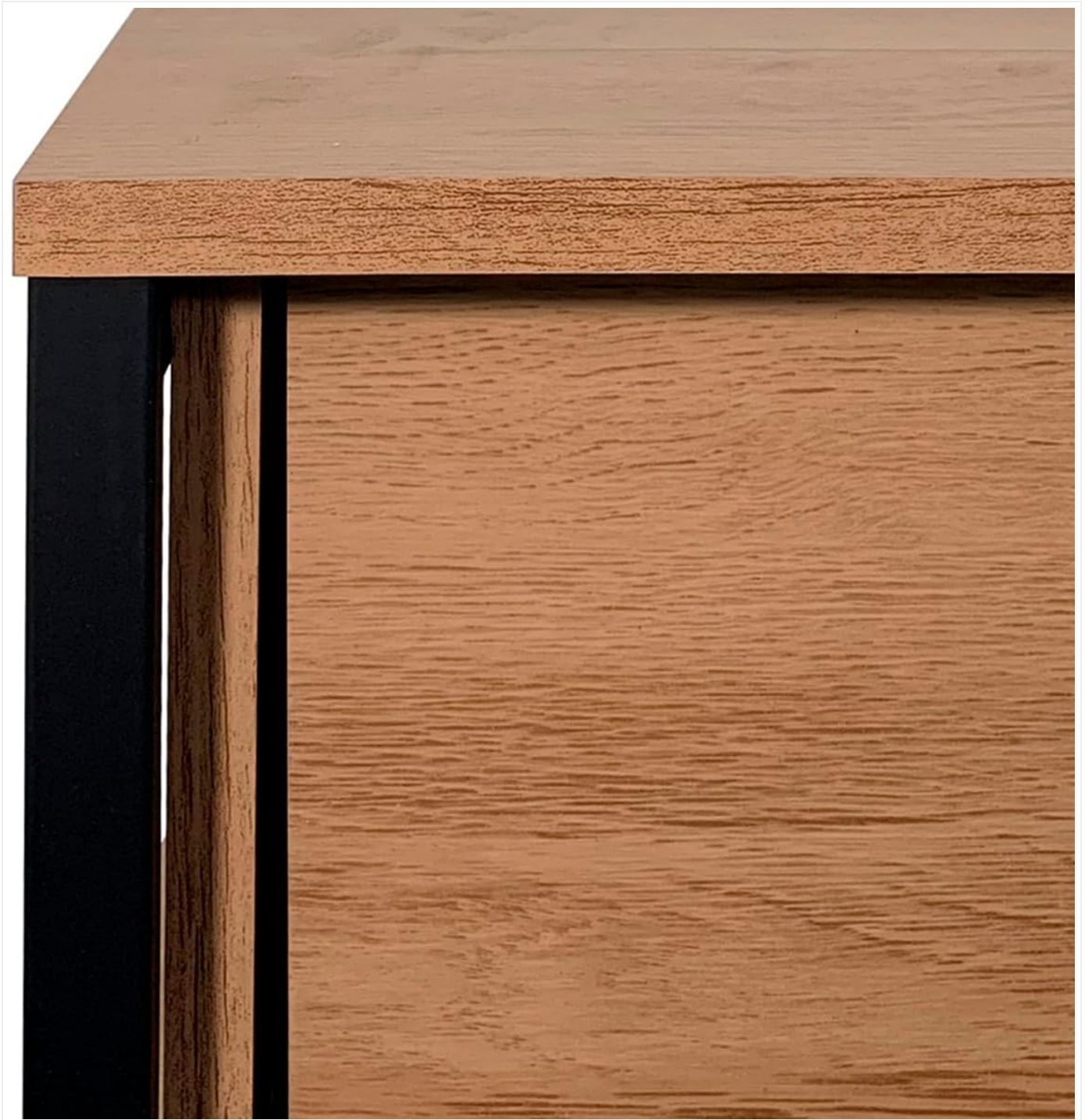
Image: A close-up view of the table's surface, showcasing the Freijó finish and texture, emphasizing the need for proper care.