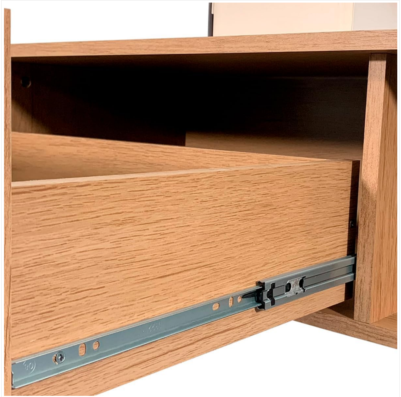
Image: A detailed view of the telescopic drawer slide mechanism, illustrating a common component that might require adjustment for smooth operation.