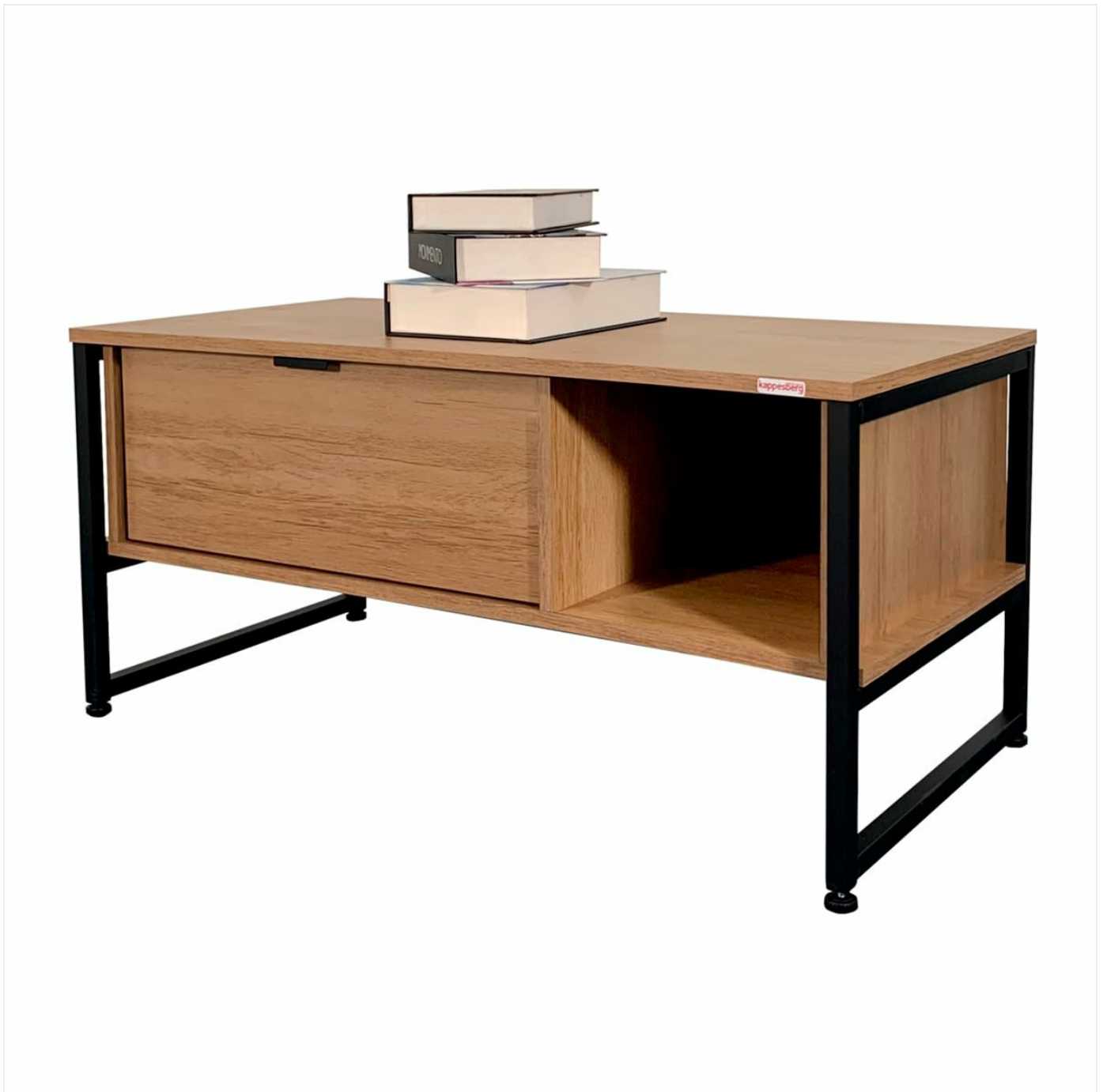
Image: The Kappesberg LI019 coffee table, showcasing its industrial design with a wooden top and metal frame, placed in a living room environment.