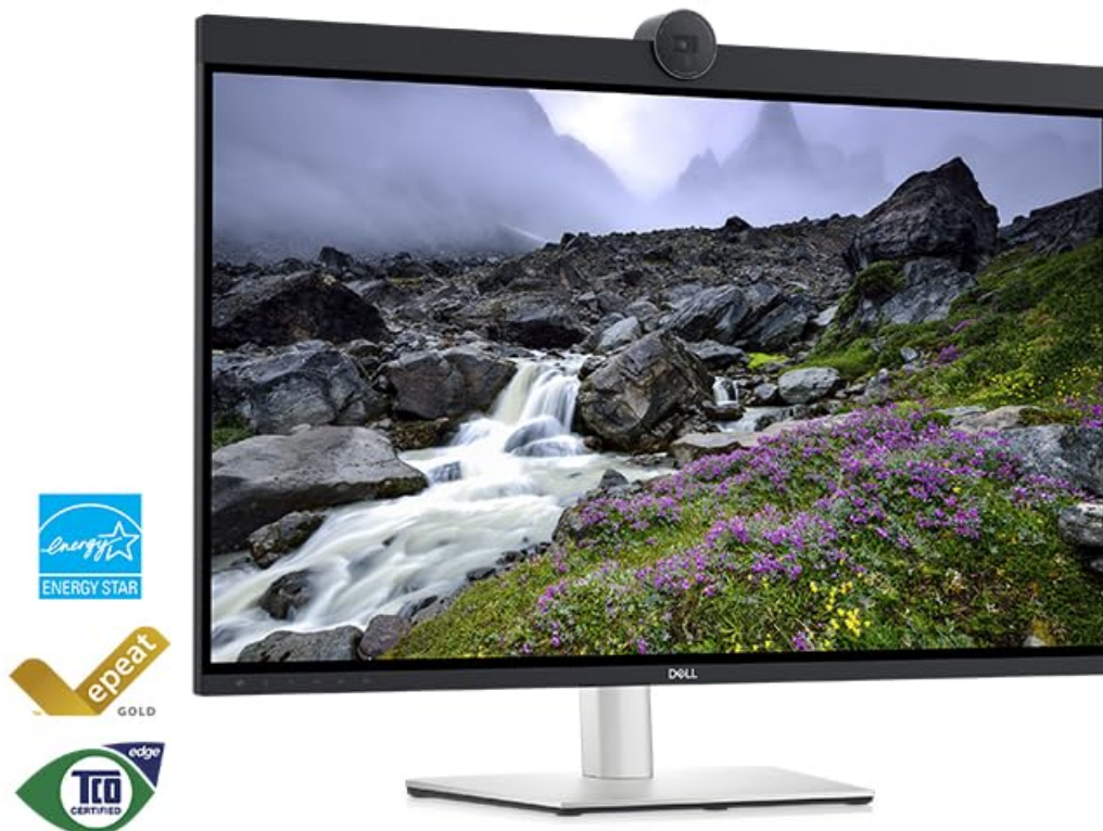
Figure 10: Environmental Certifications