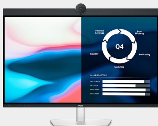
Figure 1: Dell UltraSharp U3223QZ Monitor Overview