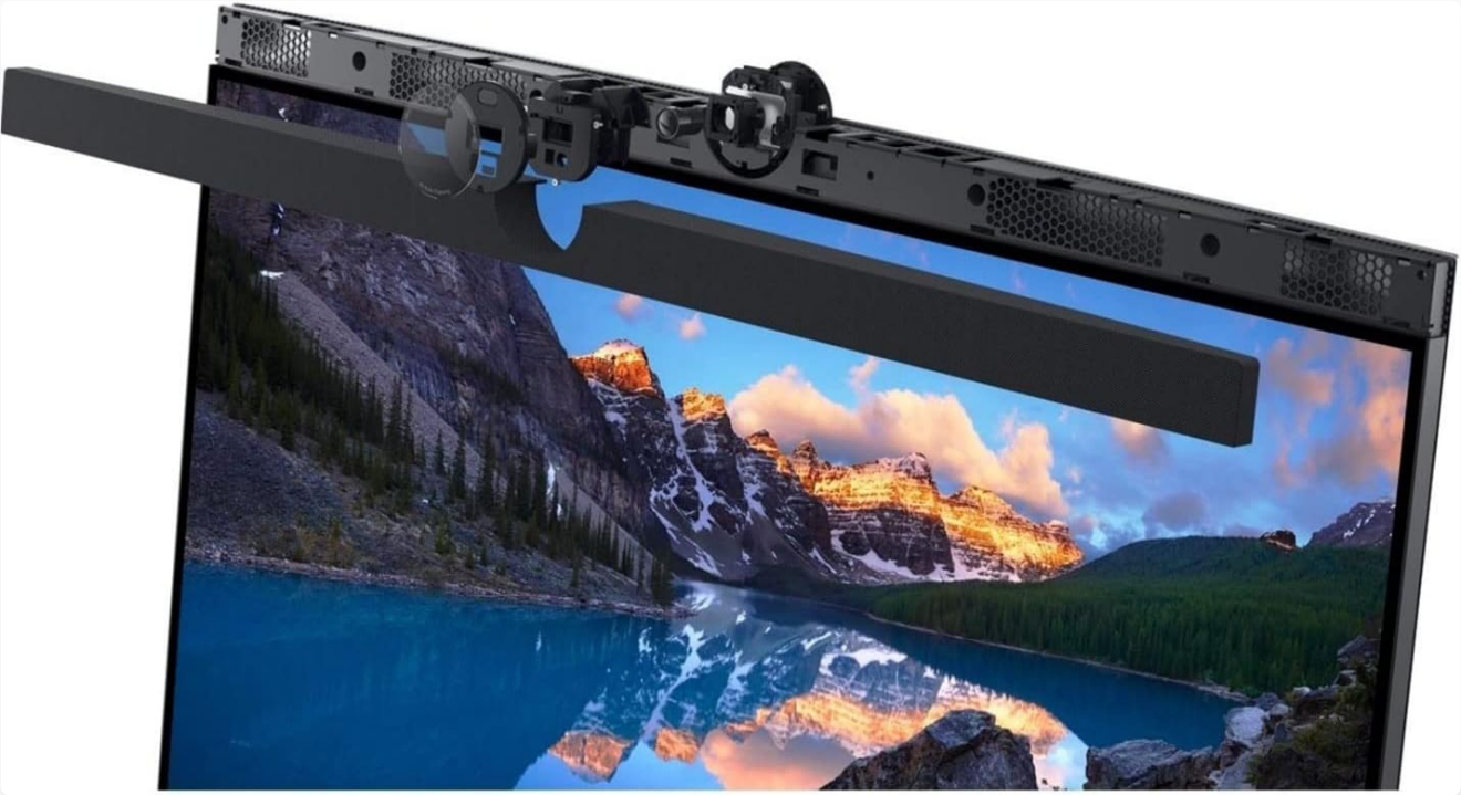
Figure 8: Integrated 4K Webcam

The integrated 4K webcam offers high-quality video for virtual meetings. Features like SafeShutter and ExpressSign-in enhance privacy and convenience. AI Auto Framing keeps you centered during calls.