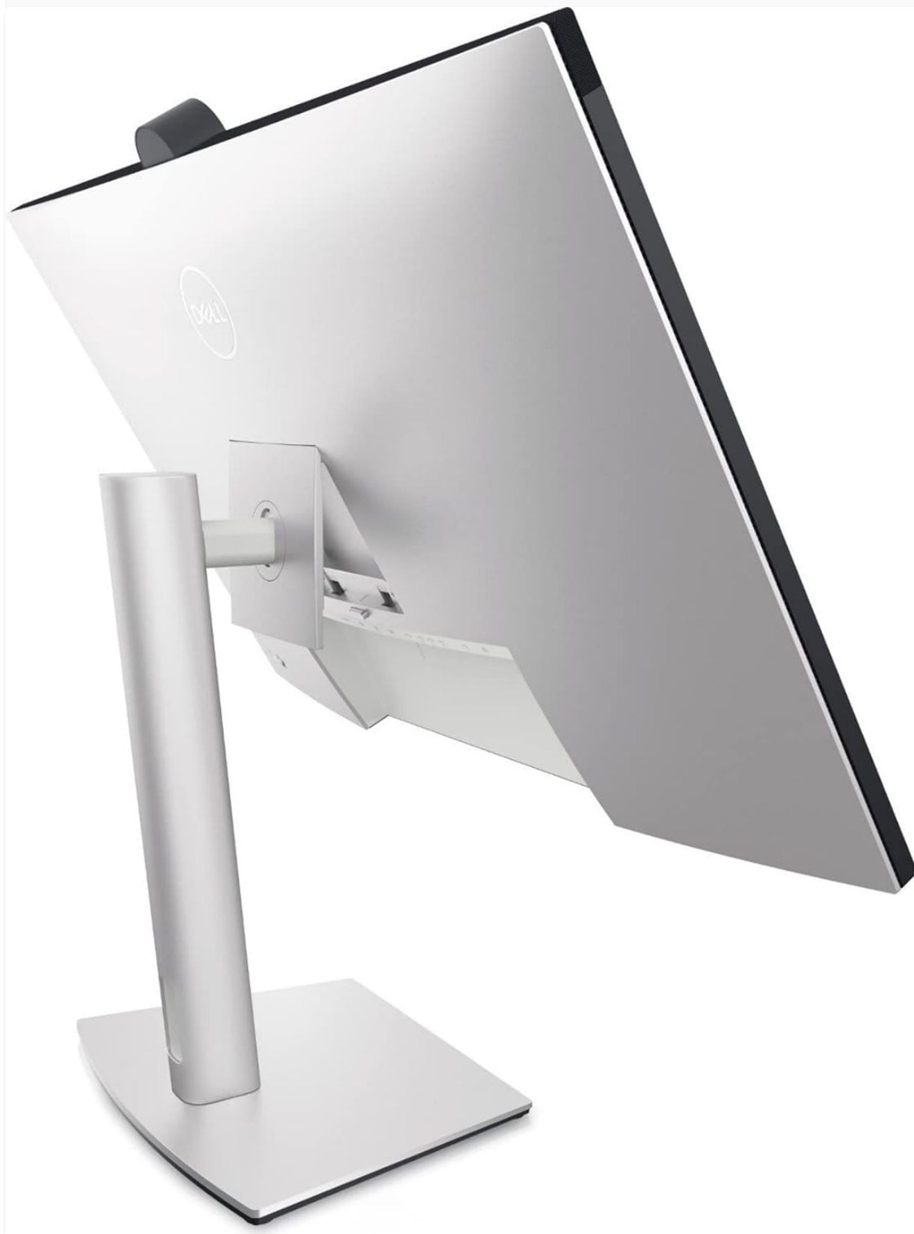
Figure 2: Monitor Rear View with Stand

Carefully remove all components from the packaging. Ensure all parts are present before proceeding with assembly.