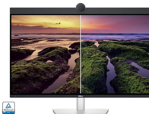
Figure 7: IPS Black Technology for Enhanced Contrast

Access the On-Screen Display (OSD) menu using the buttons on the monitor to adjust settings such as brightness, contrast, color modes, and input source. The 4K UHD resolution provides a vast workspace, and IPS Black technology ensures deep blacks and vibrant colors.