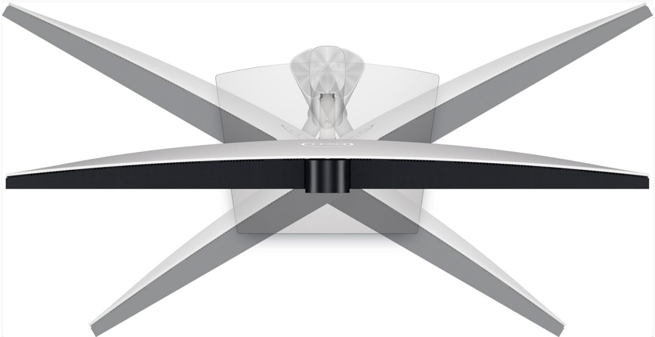
Figure 6: Monitor Swivel Adjustment