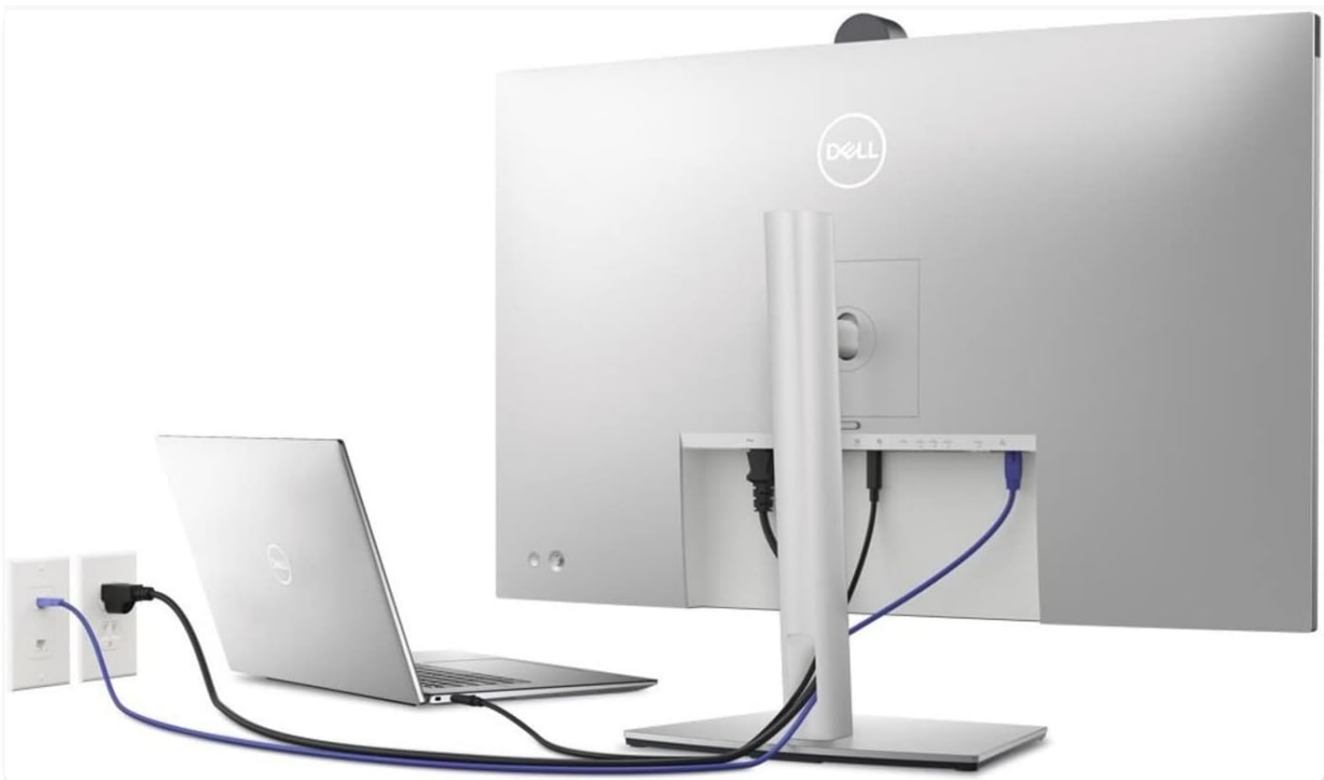
Figure 3: USB-C Connectivity to Laptop

Additional ports are available for various peripherals. Refer to the diagram below for port identification.