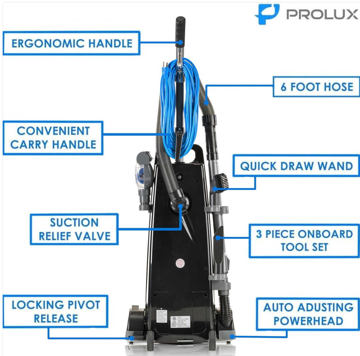
Figure 3: Back view highlighting the ergonomic handle, 6-foot hose, quick draw wand, and 3-piece onboard tool set.