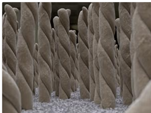
Figure 9: Visual representation of carpet fibers before and after cleaning, demonstrating effective dirt removal.

Regularly inspect the steel brush roll for tangled hair or debris. A quick-release metal bottom plate allows for easy access to the brush and belt for cleaning or replacement.