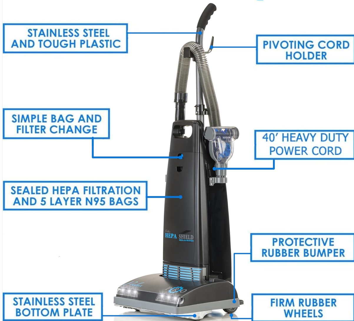
Figure 4: Side view showing the pivoting cord holder and 40-foot heavy-duty power cord.