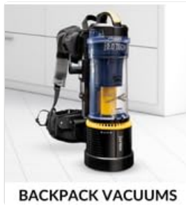
Figure 11: Prolux customer support is available for product assistance.

Should you require assistance with setup, operation, maintenance, or troubleshooting, our dedicated customer support team is available to help. Contact information can be found on the Prolux website or in your product documentation.