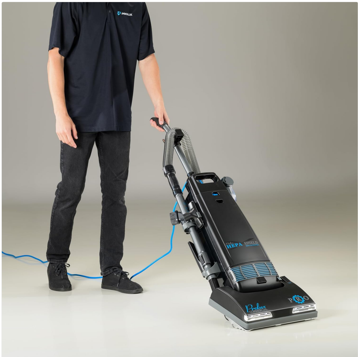
Figure 6: Operating the vacuum on carpet, demonstrating ease of use.

For detailed cleaning, detach the hose and attach the desired tool. The extendable wand provides additional reach for high areas or tight spaces. The Mini Pet Turbo Brush is effective for removing pet hair from upholstery and stairs.