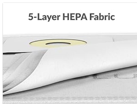
Figure 8: A 5-layer HEPA filter, crucial for advanced air purification.

The advanced HEPA filter captures fine particles and allergens. Periodically check and replace the HEPA filter according to usage to ensure continued high-level filtration.