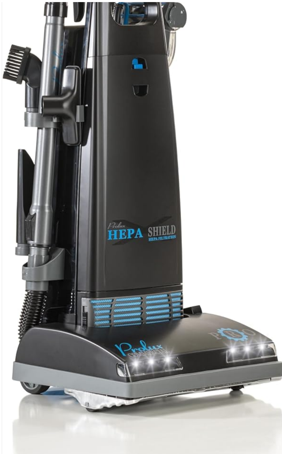
Figure 1: Front view of the Prolux 8000 Commercial Upright Vacuum Cleaner.