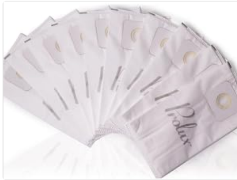
Figure 7: Genuine Prolux HEPA dust bags for replacement.

The vacuum utilizes a paper collection bag as part of its dual filtration system. Replace the bag when it is full to maintain suction power and filtration efficiency. Refer to the vacuum unit for specific bag replacement instructions.