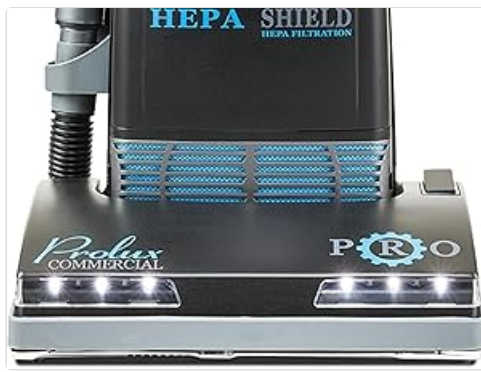
Figure 5: The vacuum head features integrated LED headlights for improved visibility during cleaning.