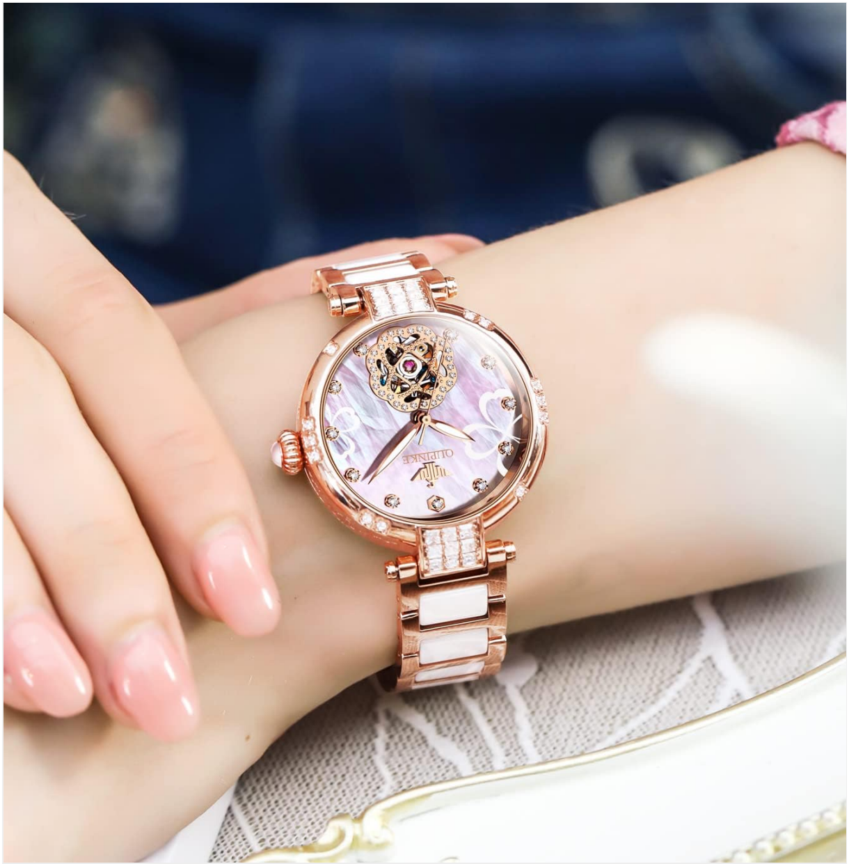
Image: Close-up of the OUPINKE L3183 watch on a woman's wrist, highlighting the pink dial and diamond accents.