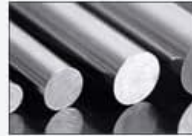
STAINLESS STEEL MATERIAL

The strap is made of high-quality ceramics With solid stainless steel, comfortable to wear