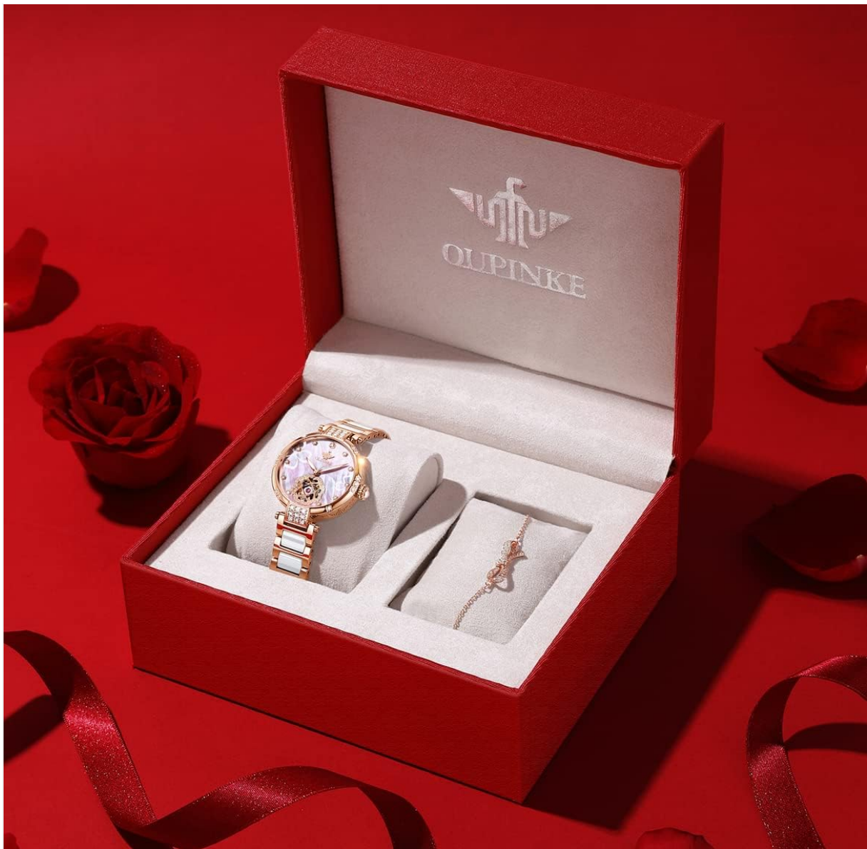
Image: The OUPINKE L3183 watch and a matching bracelet displayed within its red gift box.