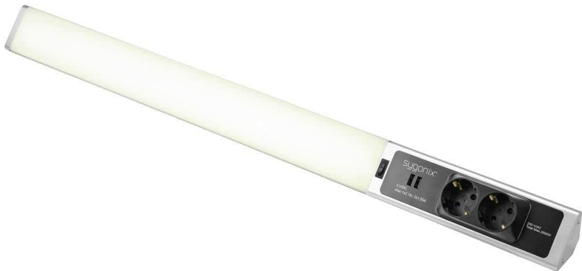
Figure 1: Top view of the Sygonix SY-4998010 LED Under-Cabinet Light, showing the integrated power outlets and USB ports on the right side.