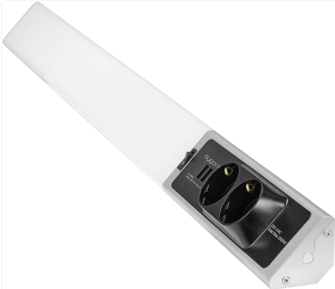
Figure 4: Angled view of the Sygonix LED light, highlighting the light bar, power switch, and integrated outlets/USB ports.