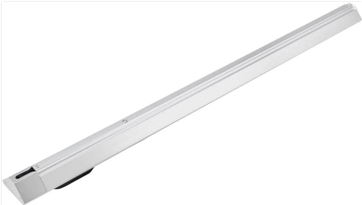
Figure 2: Side view of the LED light bar, illustrating its slim profile and potential mounting points.