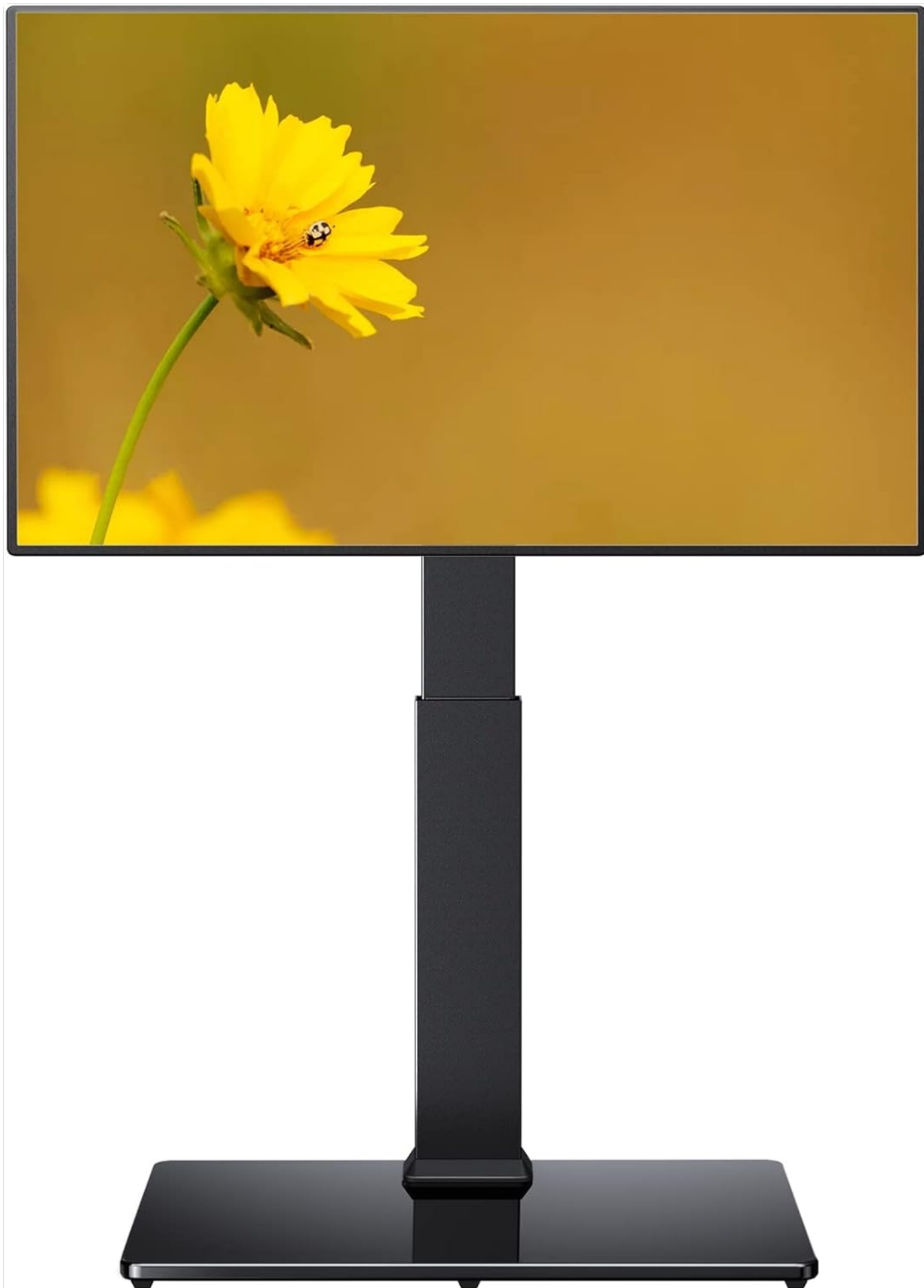
Image: Front view of the Perlegear PGFS03 TV stand with a television mounted, showcasing its sleek design.