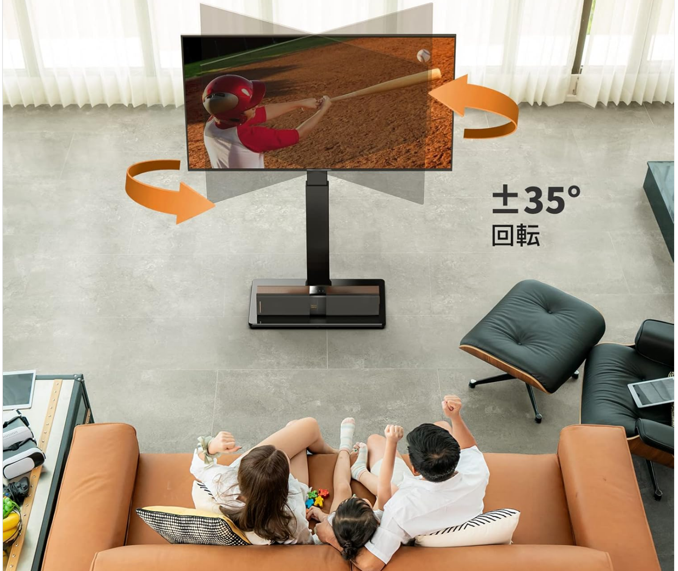
Image: Illustration of the TV stand's \pm 35^\circ swivel capability, enhancing viewing flexibility.