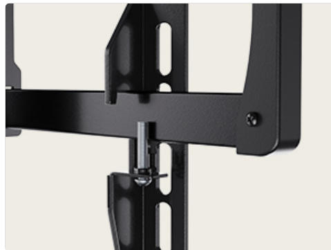
Image: Detailed view of the TV mounting bracket, illustrating the secure attachment points.