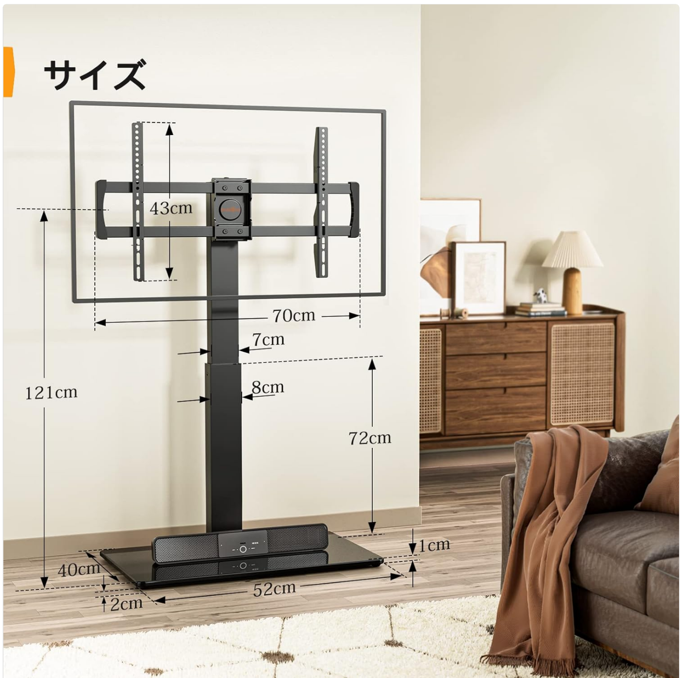
Image: Comprehensive dimensional diagram of the TV stand, providing all key measurements.