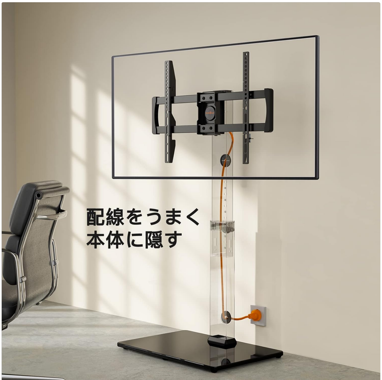
Image: Demonstration of the integrated cable management feature, allowing for a clean setup.