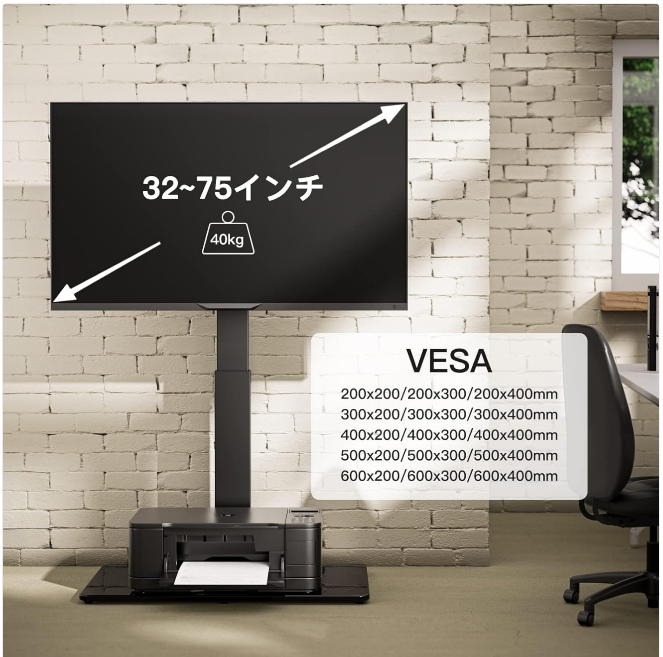
Image: Visual guide for checking TV compatibility with VESA patterns, screen size, and weight limits.