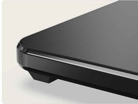
Image: Detail of the stand's base, highlighting the sturdy construction and anti-slip pads.