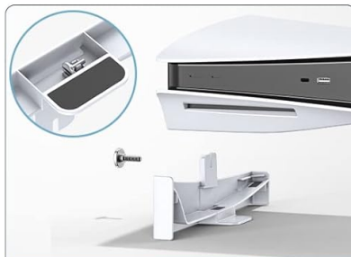
Screw Storage & Fixed

Keeps the system stable and solves the wobble problem