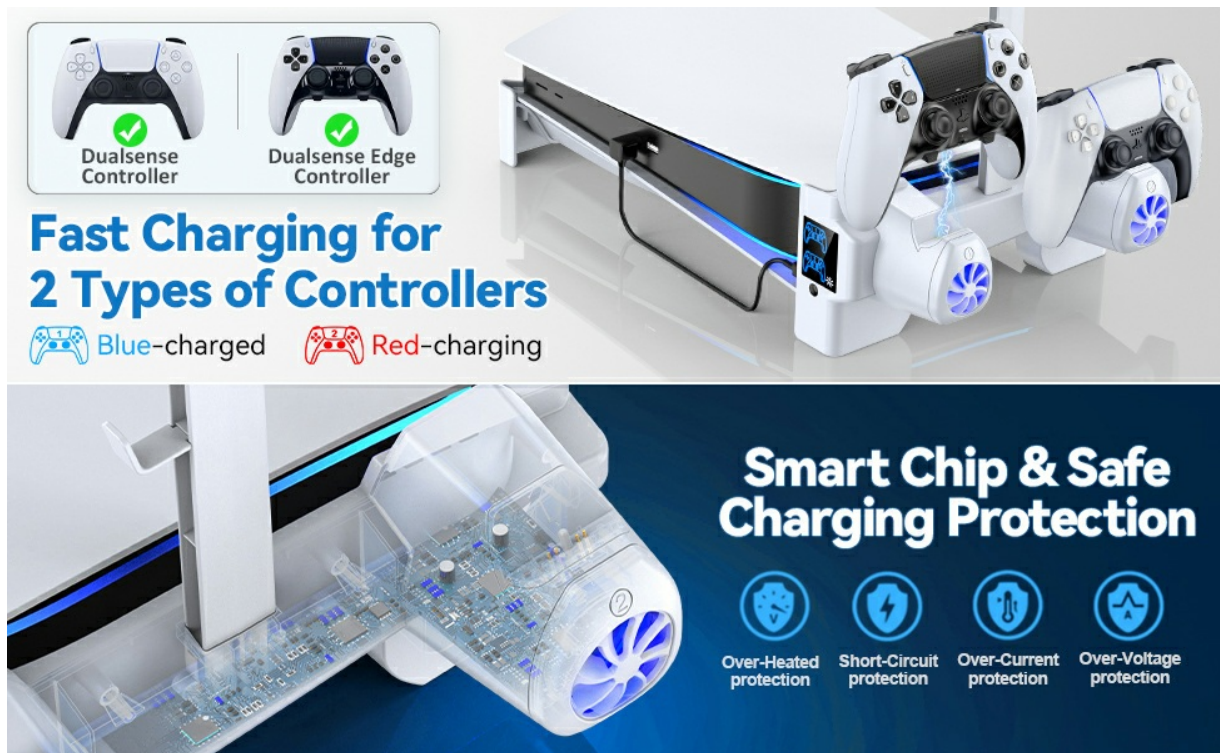
Image: Guide on configuring PS5 settings to allow charging and cooling in standby mode.