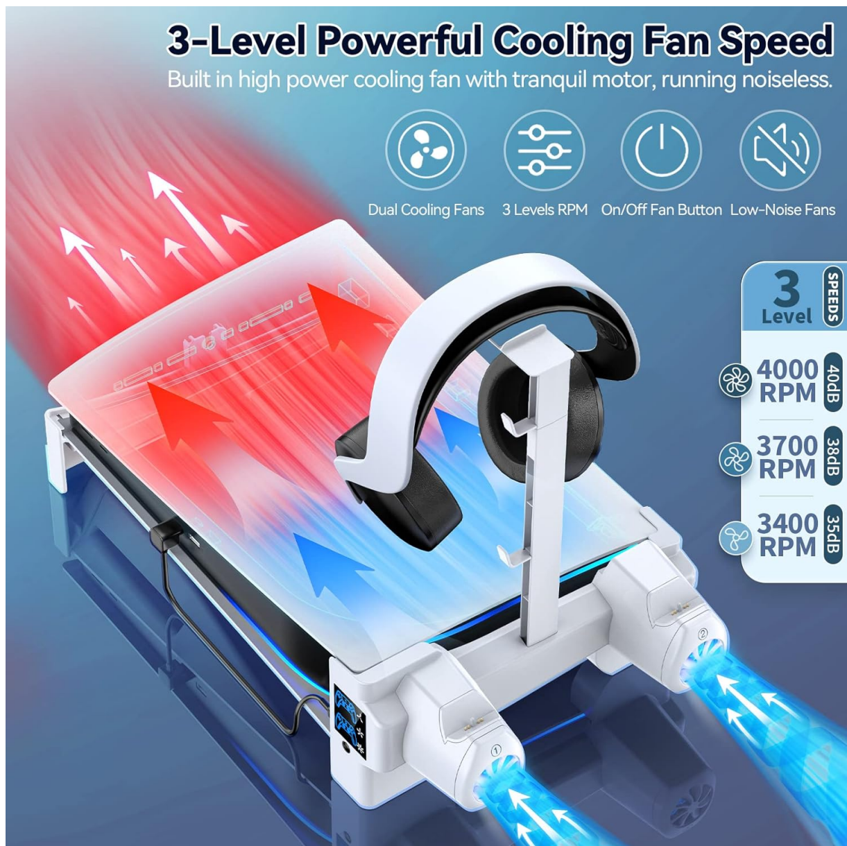
Image: Illustration of the 3-level powerful cooling fan speed settings and their effect on console temperature.

Video: Demonstration of the fan speed adjustment on the Tokluck PS5 Horizontal Stand.