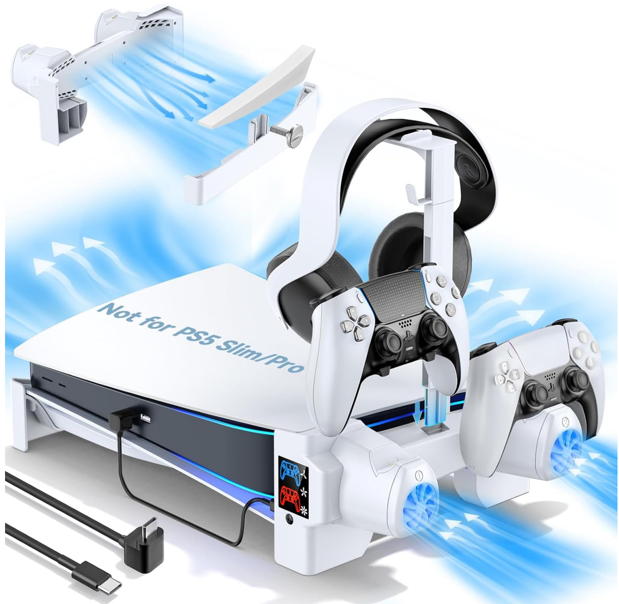
Image: The Tokluck PS5 Horizontal Stand with the PS5 console, two controllers, and a headset in place.