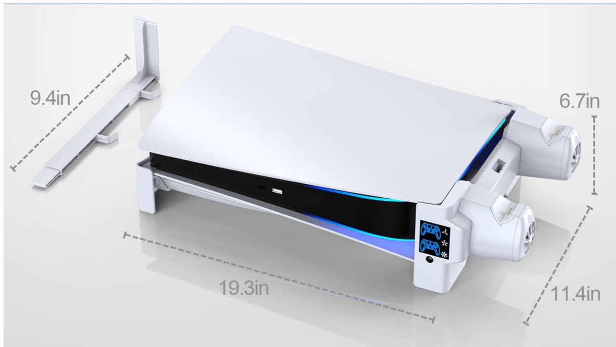
Image: Features ensuring the stability of the PS5 console on the horizontal stand.