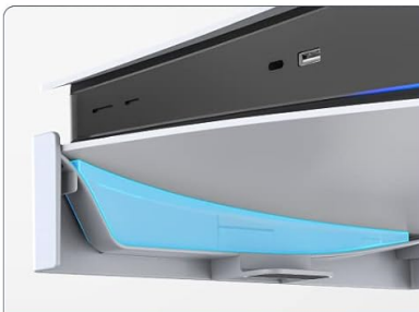
Foam Pads for PS5 Digital