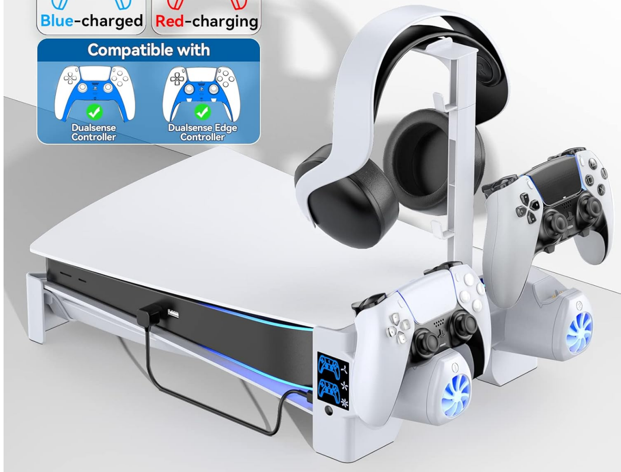
Image: Two PS5 controllers charging on the stand, illustrating the 2-hour fast charging capability.