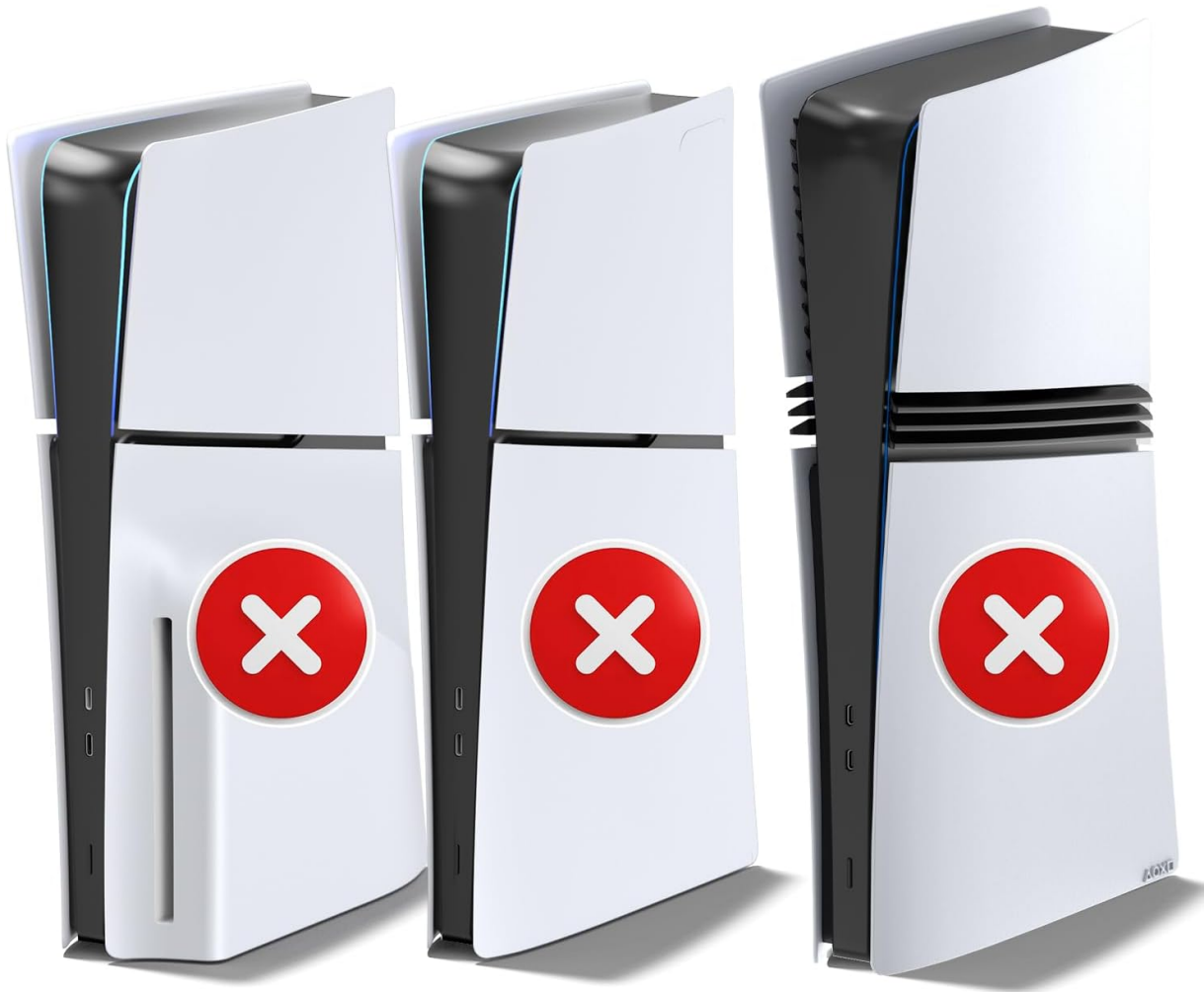
Image: Visual representation indicating incompatibility with PS5 Slim and PS5 Pro models.

This stand is specifically designed for the original PS5 console. It is not compatible with the newer PS5 Slim or PS5 Pro versions. Please ensure you have the correct PS5 model before installation.