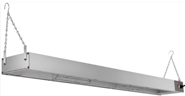
Figure 3.1: Front view of the Kratos 28W-212 Commercial Electric Strip Warmer.

This image shows the overall design of the 48-inch Kratos strip warmer, featuring its sleek stainless steel body and integrated hanging chains for overhead installation.