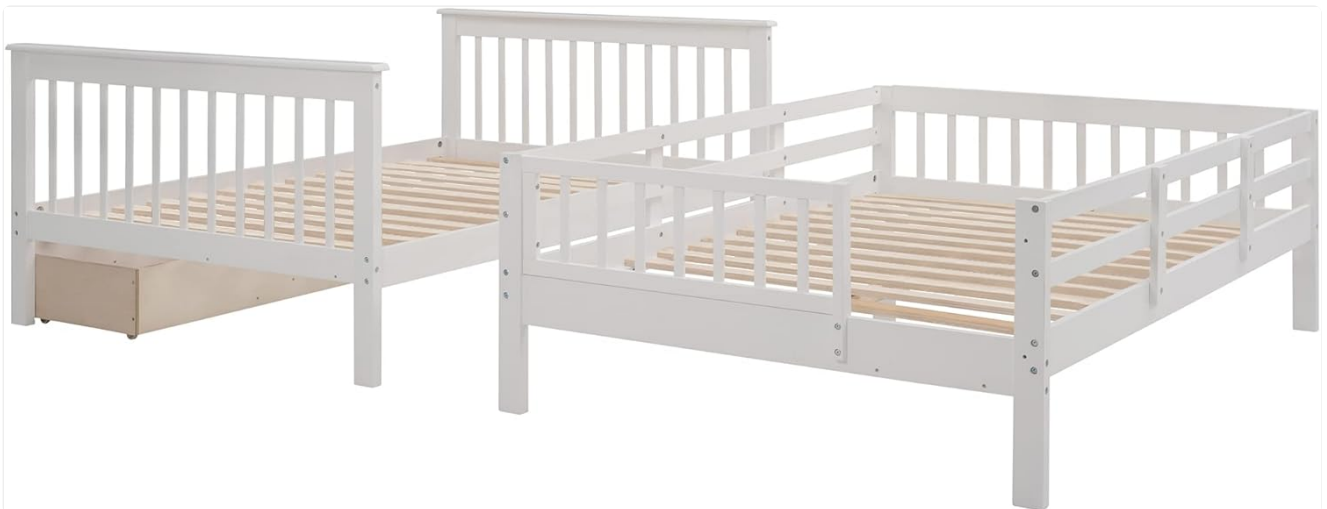
Image 4.2: The MOEO Bunk Bed disassembled into two separate full-size bed frames.