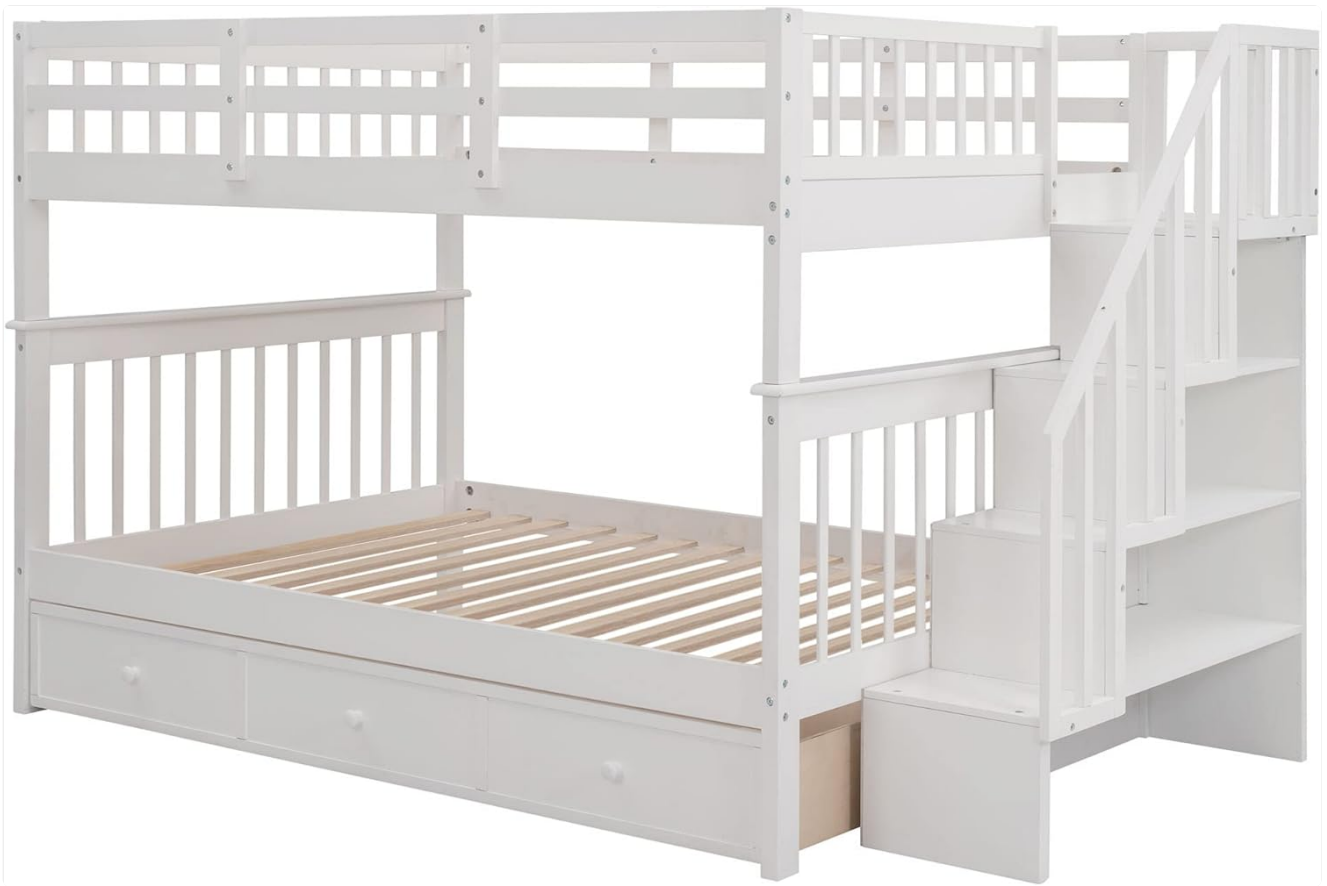
Image 4.1: The MOEO Bunk Bed showcasing the three under-bed storage drawers in an open position.