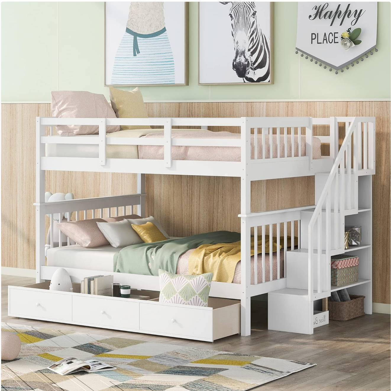
Image 1.1: The MOEO Full Over Full Bunk Bed with integrated storage stairs and under-bed drawers, shown in a white finish.