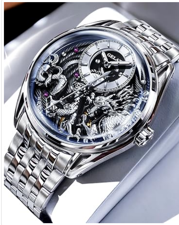
Image: Detail of the tungsten steel strap and clasp.

The watch features a tungsten steel strap, known for its durability and scratch resistance. While robust, proper care will extend its lifespan and appearance.