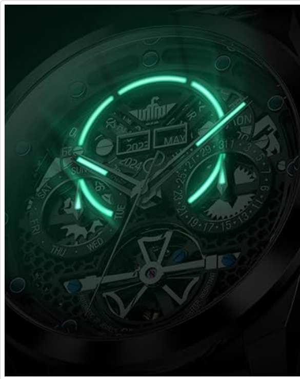
Image: The watch dial displaying its luminous properties in darkness.