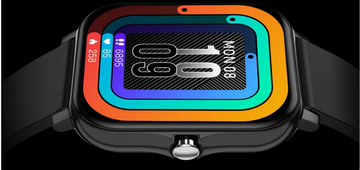
Image: A close-up view of the watch screen, emphasizing the "1.69" HD color screen" feature with vibrant display colors.

1.69-inch IPS full touch colorful screen with 240*280 resolution, bringing clear and delicate display, The color saturation is high and the display is real and vivid, as amazing as first sight.