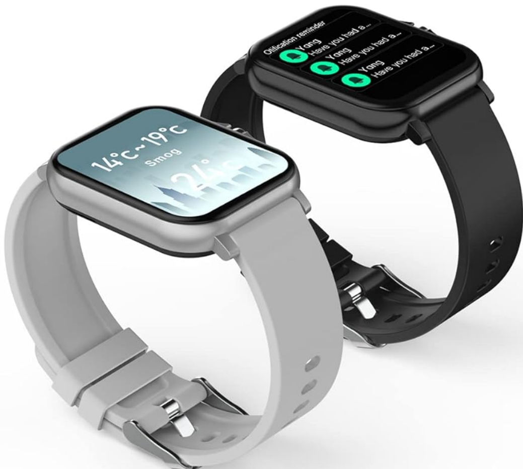
Image: Two Smart Watches, one showing a weather display and the other illustrating icons for incoming calls, message notifications, sedentary reminders, and weather forecasts, highlighting the watch's smart reminder features.