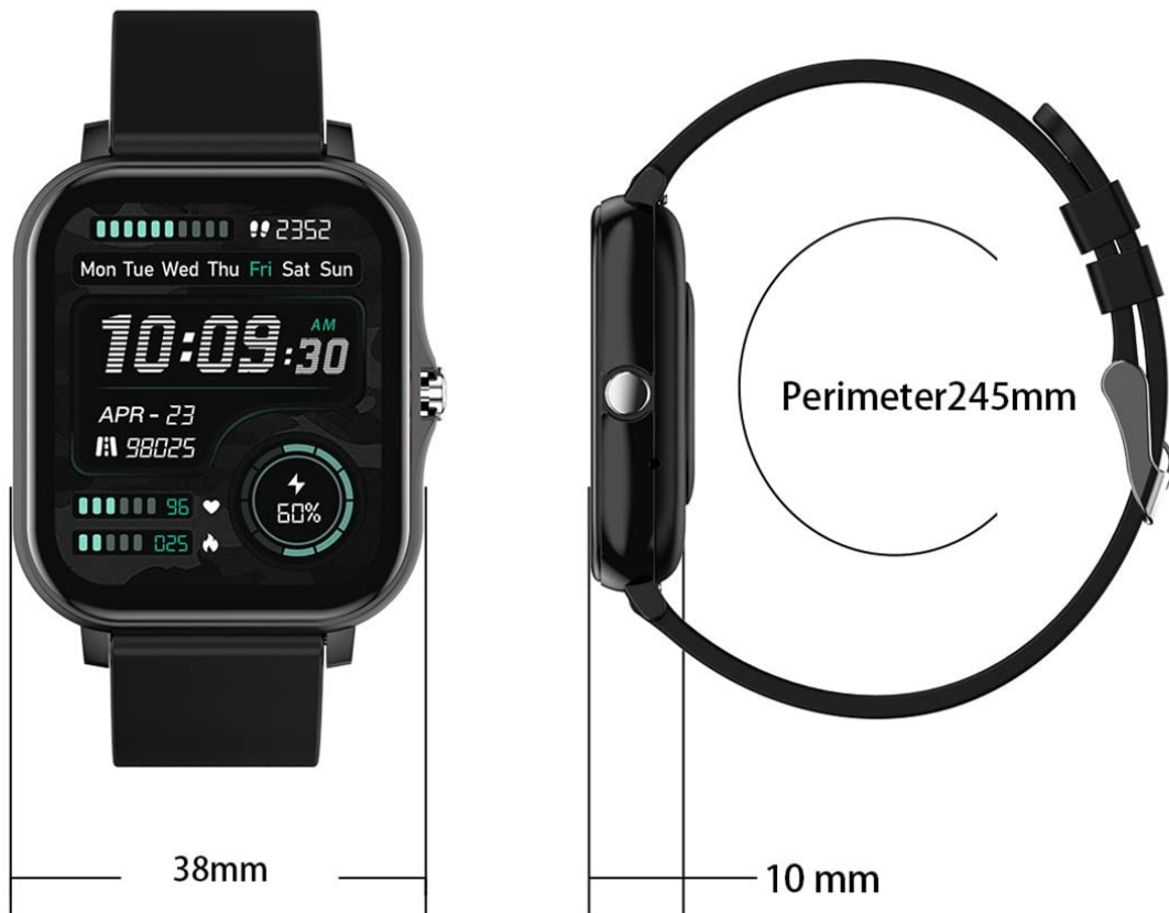
Image: A diagram illustrating the physical dimensions of the Smart Watch H20, showing a width of 38mm, a thickness of 10mm, and a perimeter of 245mm for the strap.