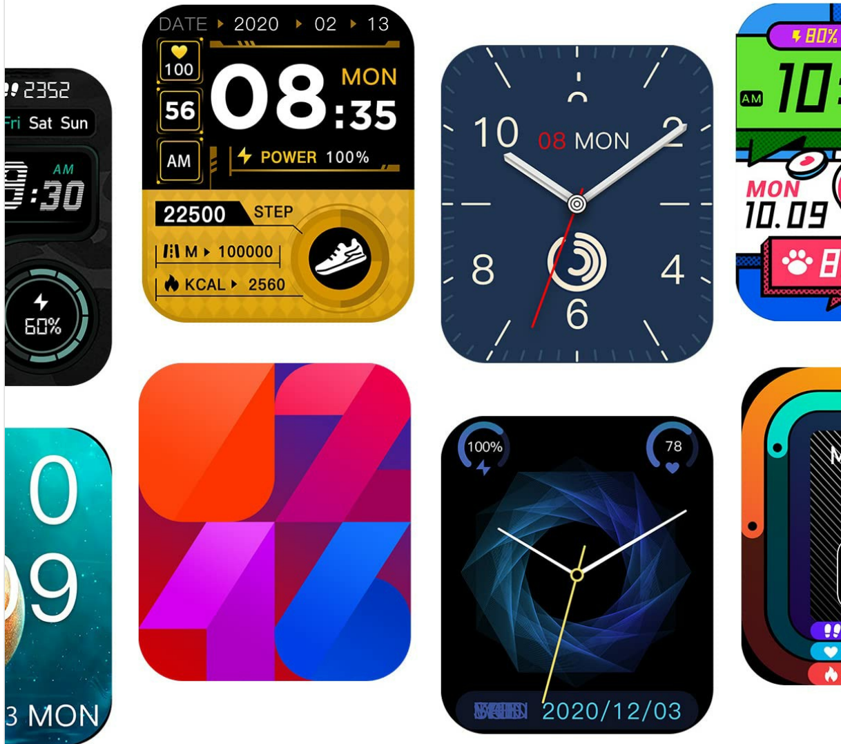
Image: A collage of different watch faces available for the Smart Watch H20, demonstrating the versatility and customization options for the display.

A variety of creative dials can be replaced at will, there is always a trend that belongs to you.