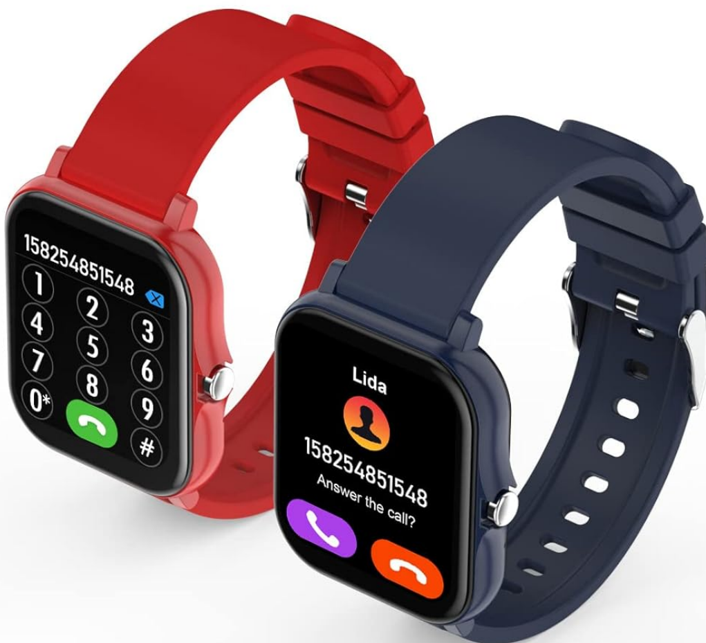
Image: Two Smart Watches, one showing a numeric dial pad for making calls and the other displaying an incoming call screen with contact information, demonstrating the Bluetooth call feature.

Built-in microphone and speaker, phone via Bluetooth. You can use the watch to connect listen to incoming calls on your mobile phone, so that important calls are not missed, and you can dial and answer freely. Built-in call records and contacts make communication more free.