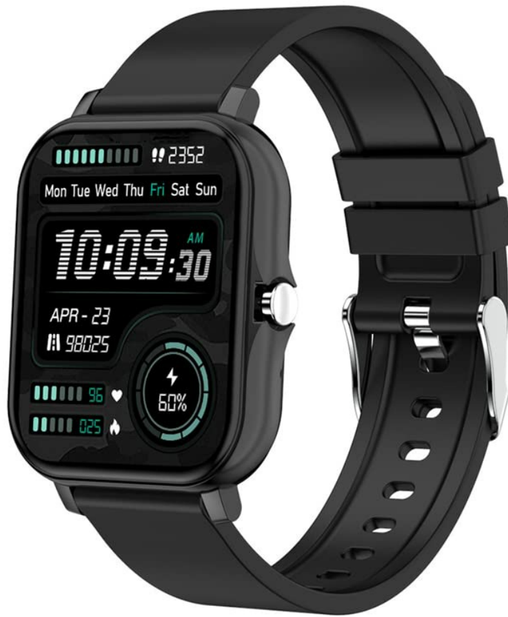
Image: The Smart Watch H20, featuring a black strap and a rectangular display showing time, date, steps, and battery percentage.