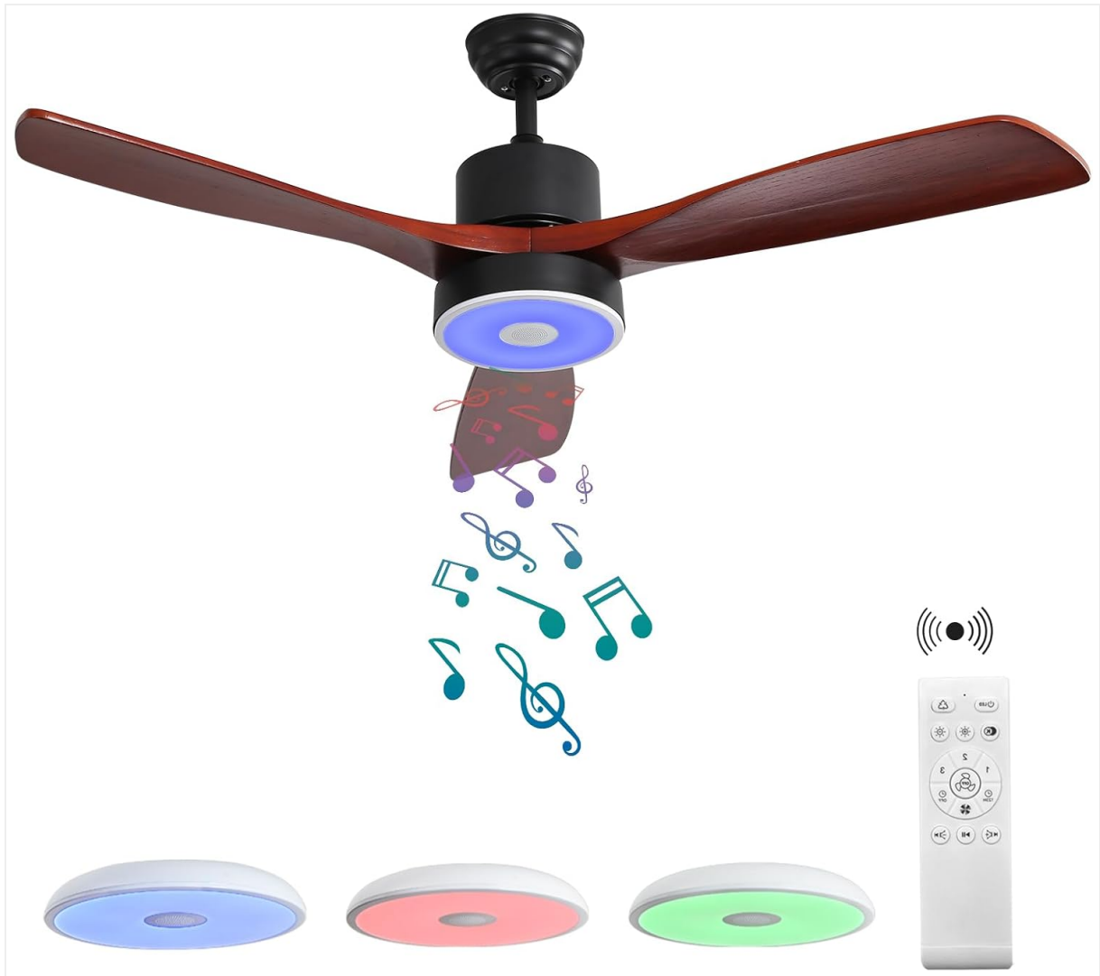
Image: The ASALL ceiling fan with visual representation of music notes, indicating its Bluetooth speaker functionality.