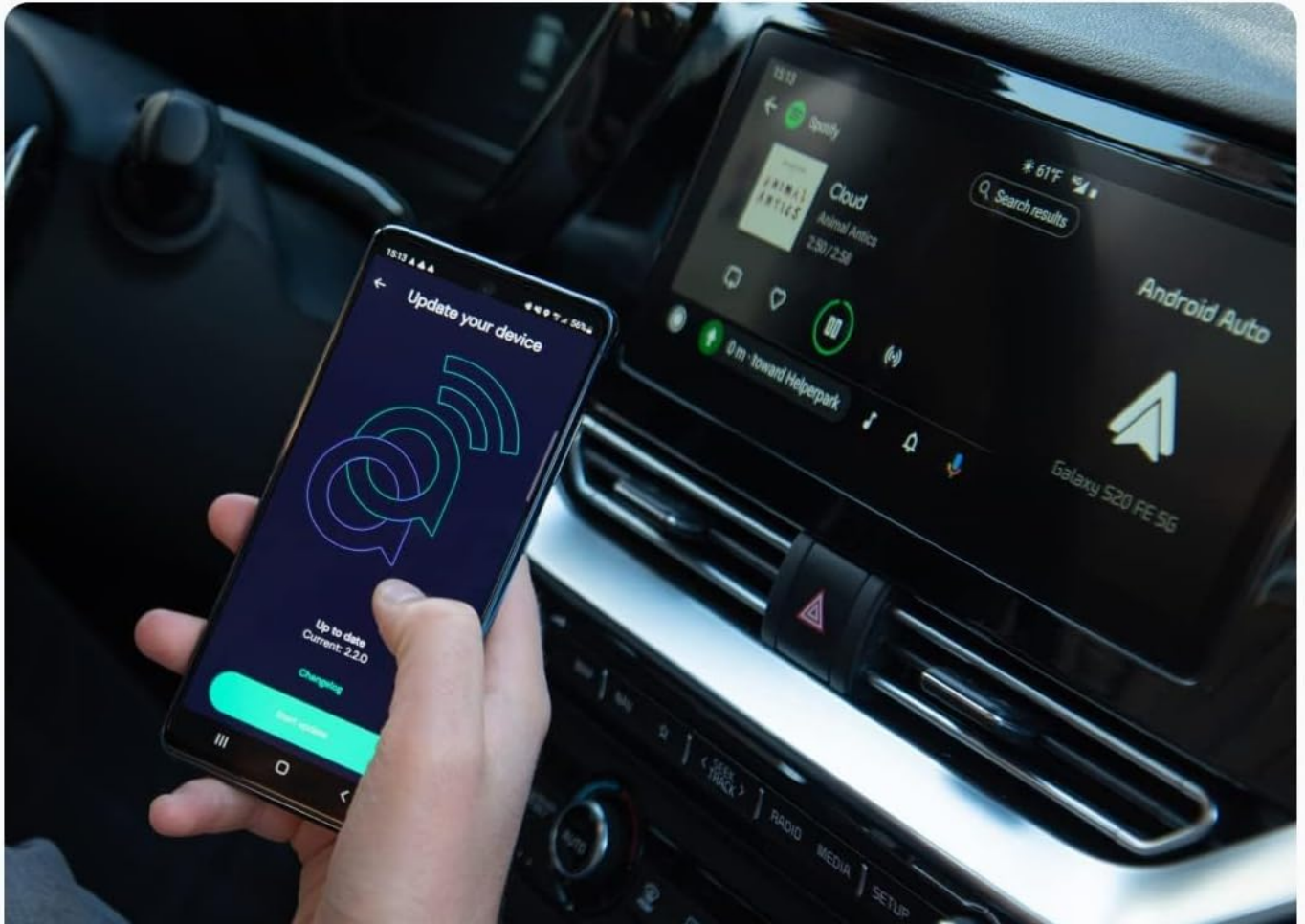
Image: A smartphone screen showing the AAWireless companion app interface, with the car's display in the background, indicating device update functionality.

Customize Android Auto • Update device Troubleshoot issues • Manage connections