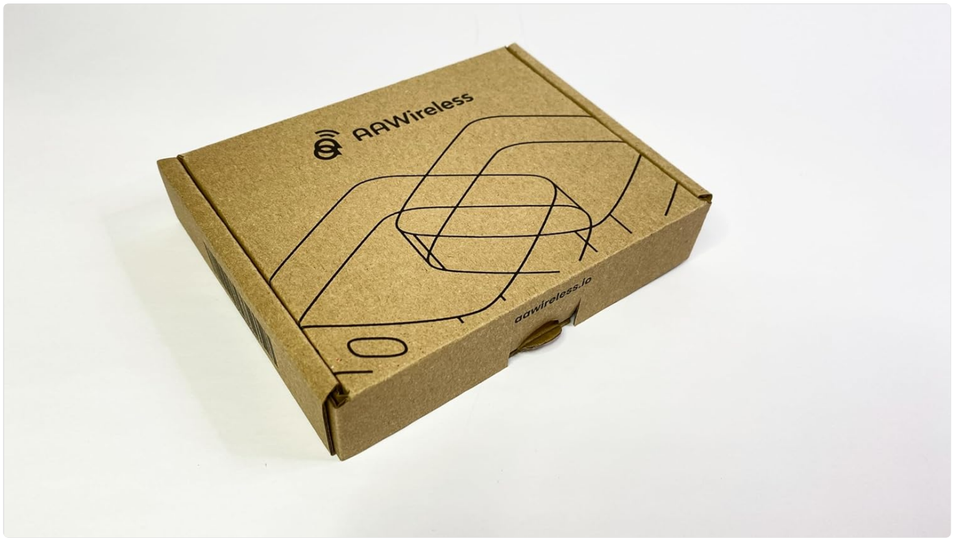
Image: The retail packaging for the AAWireless dongle, indicating the contents.