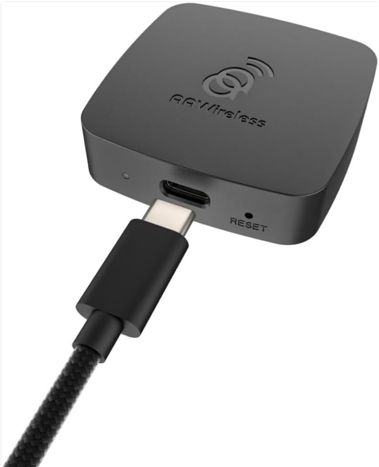
Image: The compact AAWireless dongle with a USB-C cable connected, ready for use.