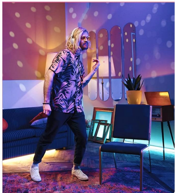
Image: Illustrates 8 scene modes and music synchronization capabilities.