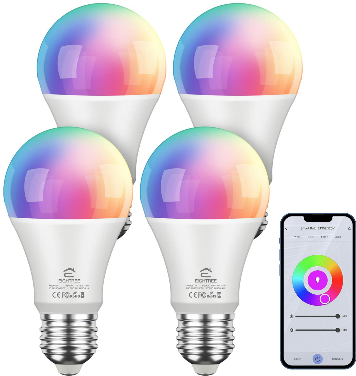
Image: EIGHTREE Smart WiFi LED Light Bulb highlighting its core functionalities.