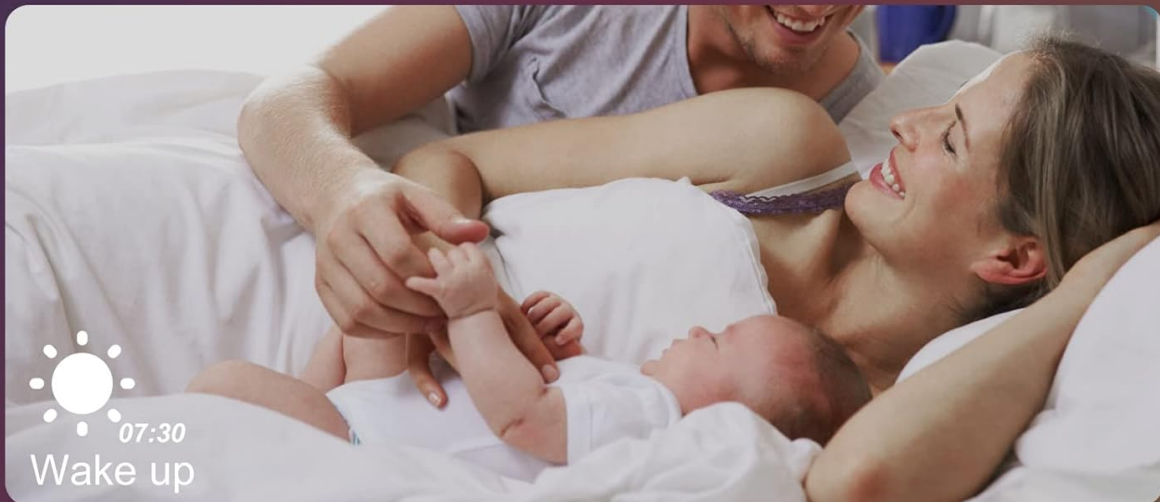
Image: Examples of setting schedules for bedtime and wake-up routines.