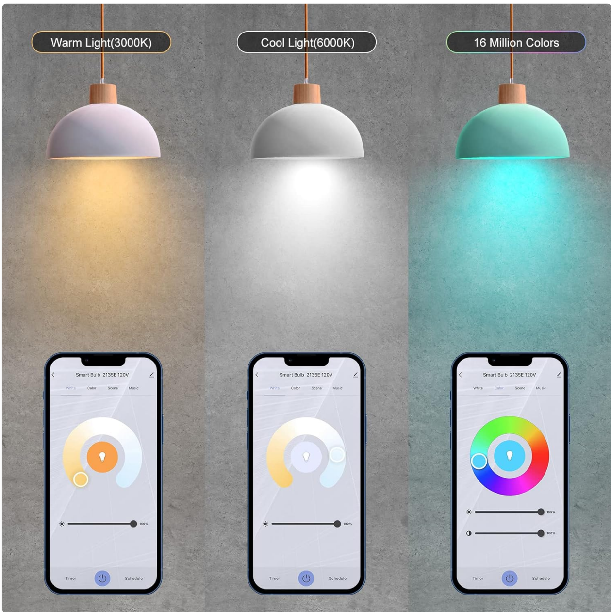
Image: Demonstrates warm, cool, and colored light options with app control interfaces.