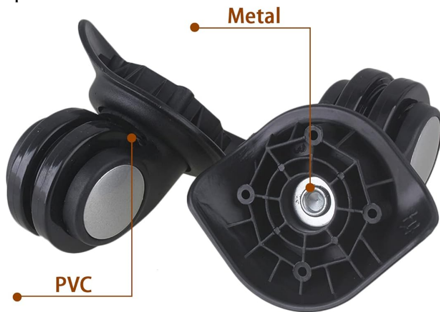
Image 2: Detailed view of the wheel construction, showing the plastic housing, PVC wheel, and metal axle.