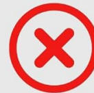
Image 3: Compatibility guide indicating suitability for hard-cover luggage only.