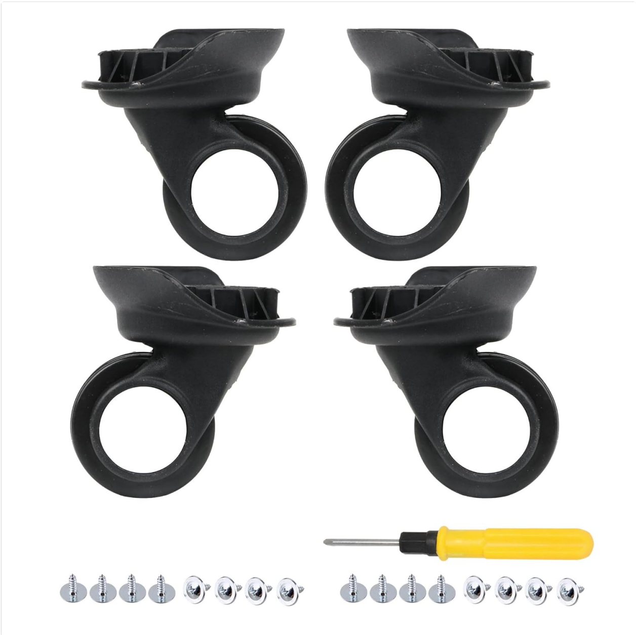
Image 1: Complete BQLZR W003 Luggage Wheels Replacement Kit, including four wheels, screws, and a screwdriver.