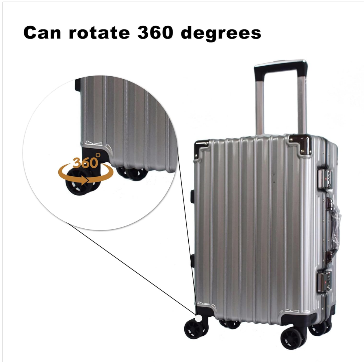
Image 7: Illustration of the 360-degree rotation capability of the luggage wheels.

These spinner wheels allow your luggage to rotate 360 degrees, providing effortless maneuverability in any direction. This feature reduces strain when navigating through airports or crowded spaces.