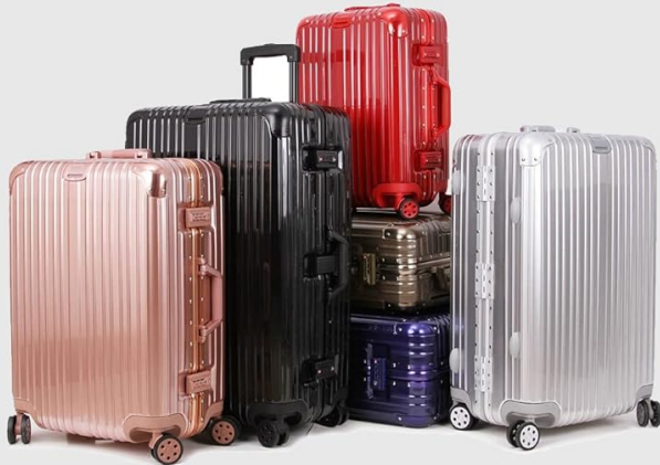
Hard Cover Luggage