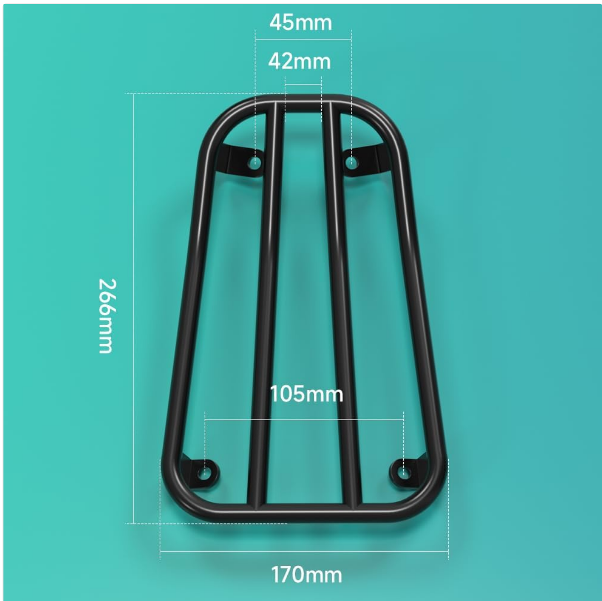
Figure 8.1: Dimensional drawing of the pannier rack, indicating key measurements for fitment and reference.