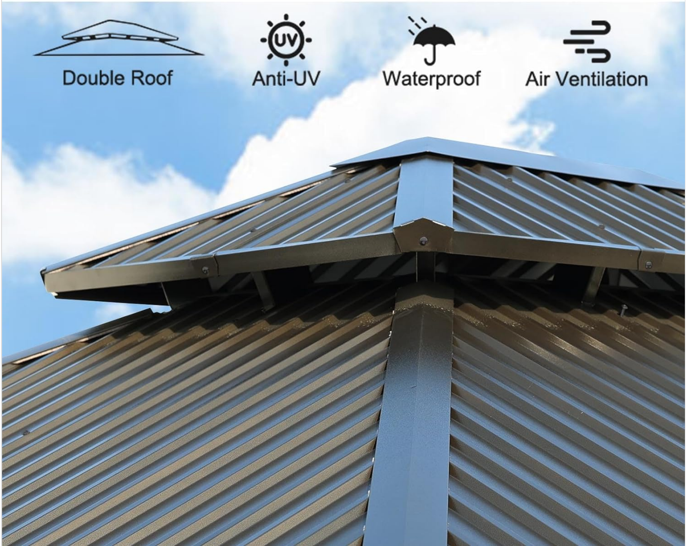
Image: Detail of the metal top with water gutters and double slopes for effective drainage.