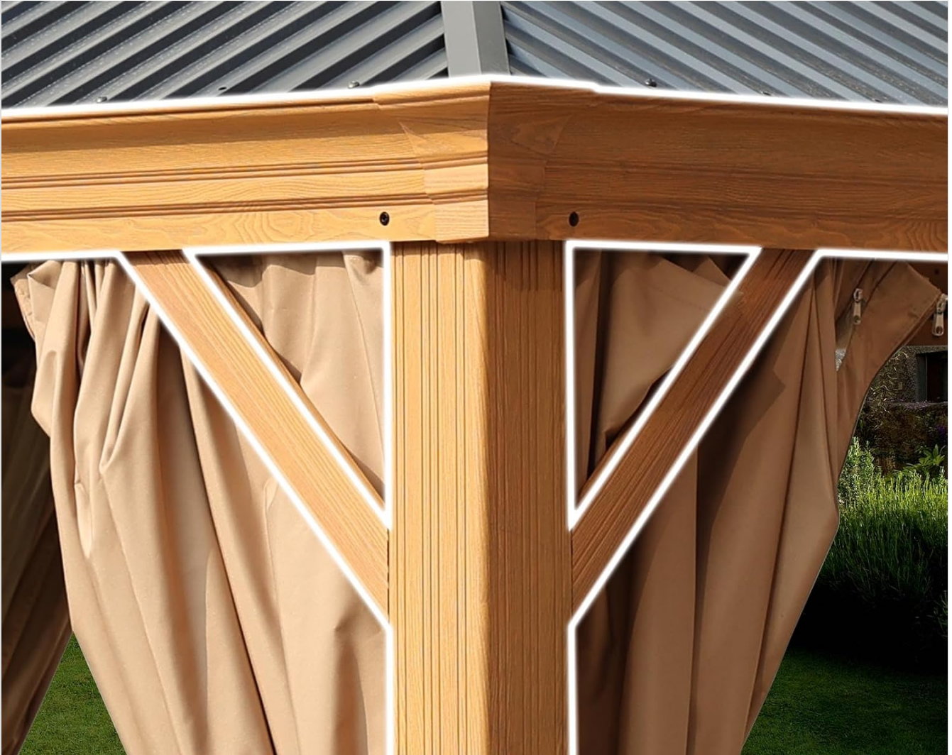
Image: The 2-tier metal hardtop roof, illustrating its fade-resistant, rust-resistant, anti-UV, waterproof, and air ventilation properties.

Wooden finish coated aluminum frame, triangle mechanics structure reinforced the framewor.