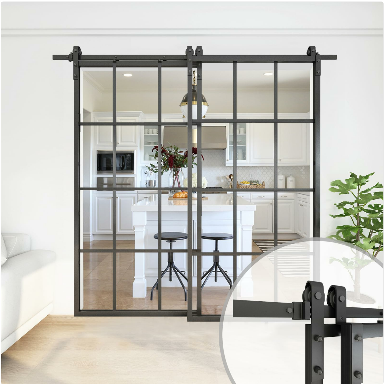
Image: A JUBEST Bypass Double Glass Barn Door installed in a modern home, showcasing its functionality and aesthetic appeal.