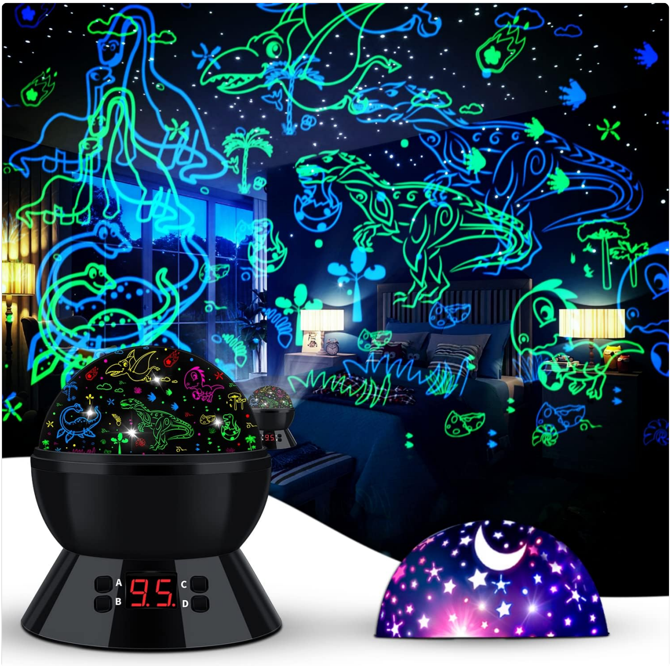
Figure 1: MOKOQI Dinosaur Night Light Projector in a child's room, projecting vibrant dinosaur patterns.