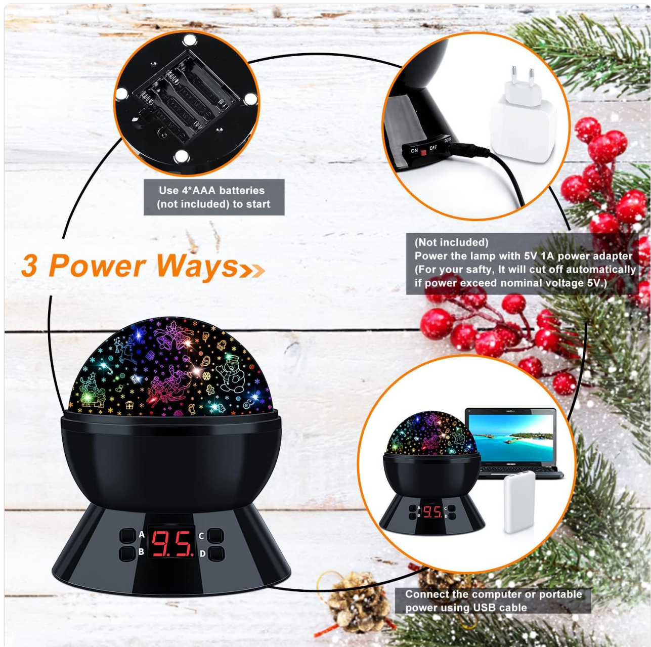
Figure 2: Powering the projector via USB or AAA batteries.