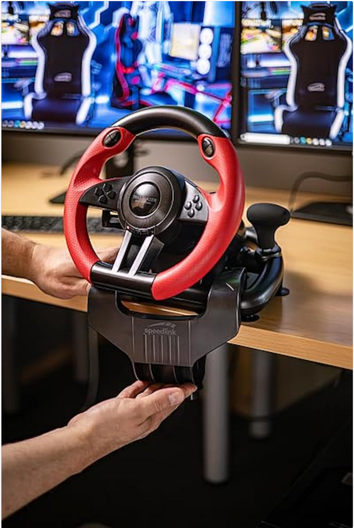
Figure 3: A racing wheel fully installed on the table mount, ready for use.