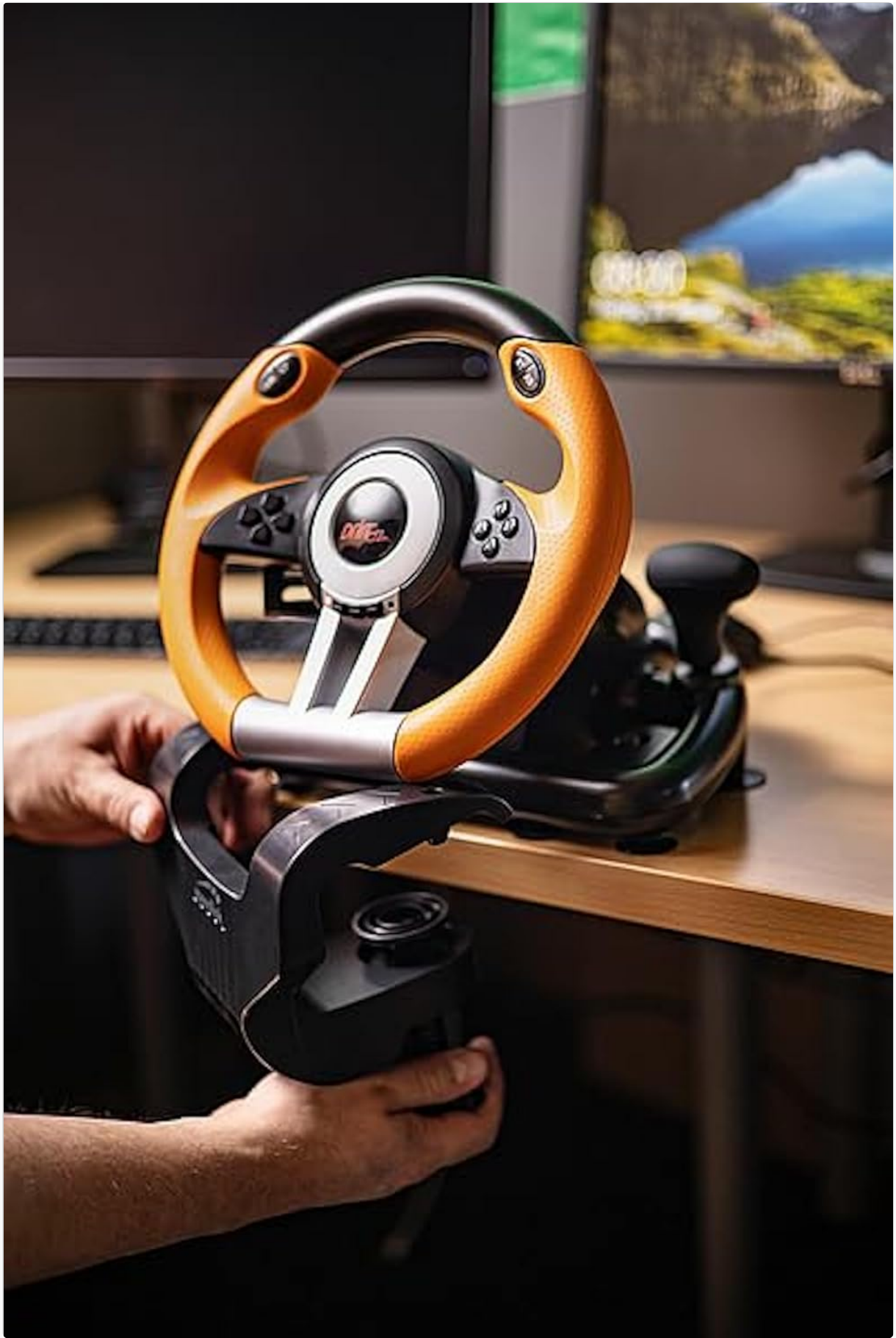
Figure 2: Hands demonstrating the attachment of the table mount to a desk surface.