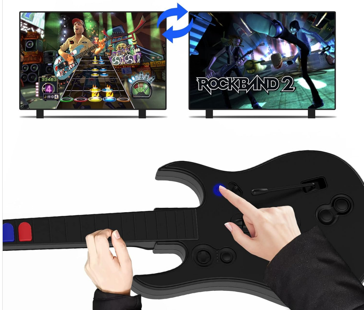
Figure 5.1: One-click switch game mode.