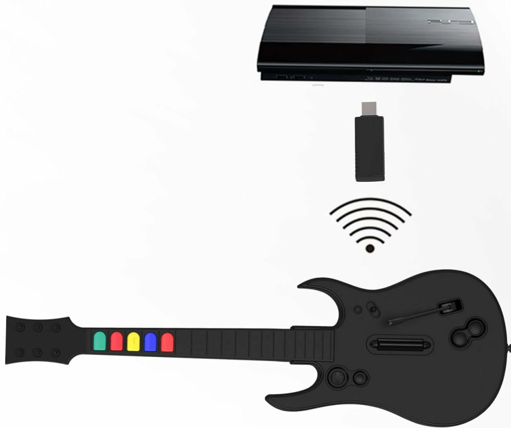
Figure 4.2: Wireless connection to PS3.