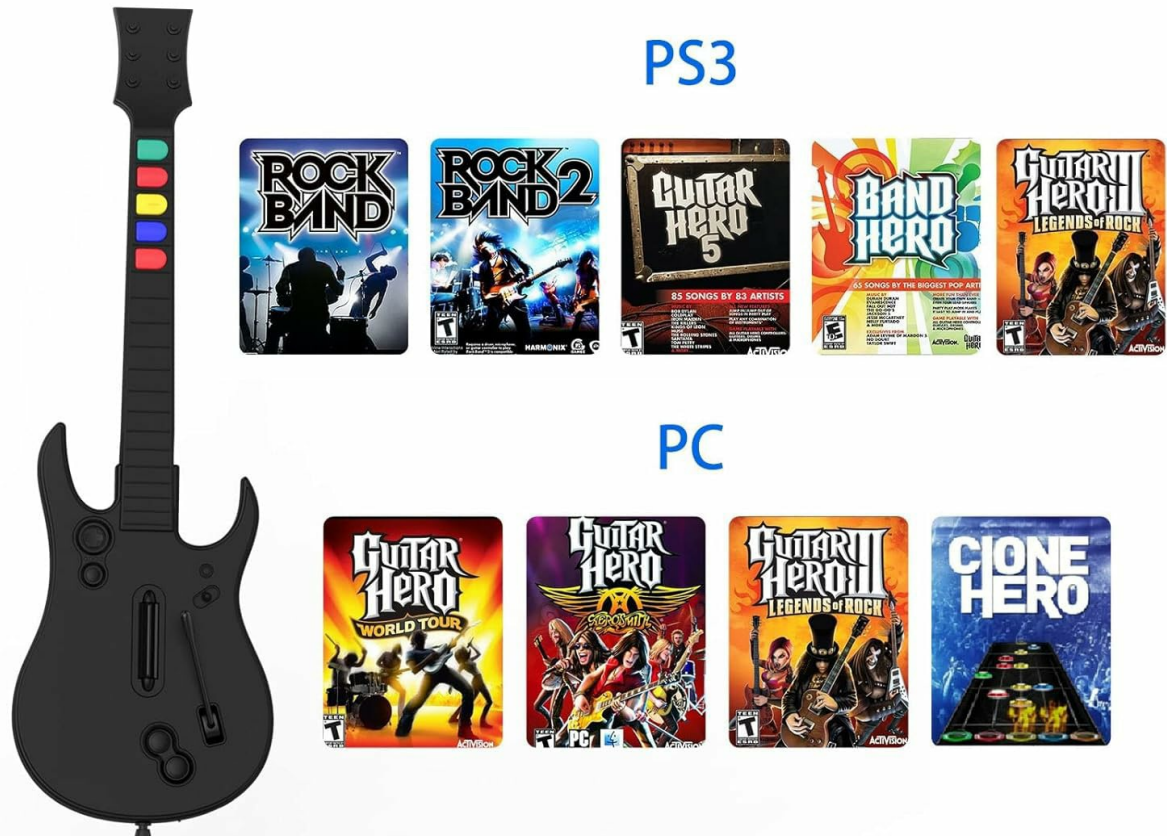
Figure 5.2: Compatible games for PC and PS3 platforms.