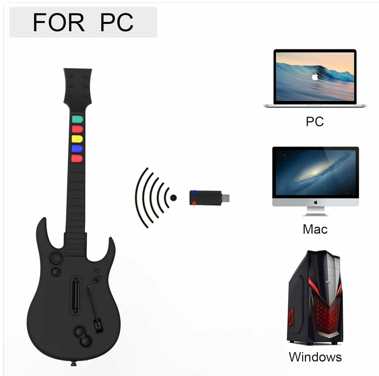
Figure 4.1: Wireless connection to PC.