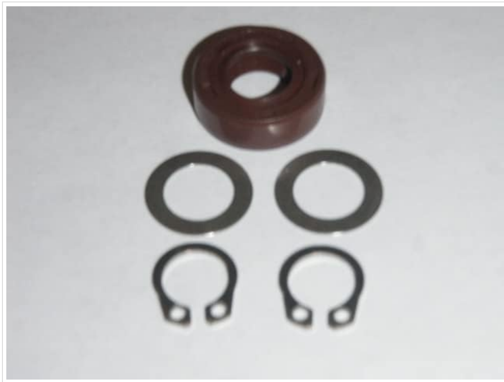
Image Description: A close-up view of the Pan Seal Kit components. It shows a coiled brown rubber seal at the top, two flat silver washers below it, and two C-shaped silver retaining clips at the bottom, all arranged on a white background.